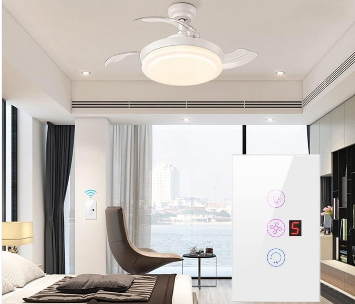
Figure 2.1: Avatto WiFi Smart Fan and Light Switch in a modern room setting, demonstrating its integration with a ceiling fan and light.