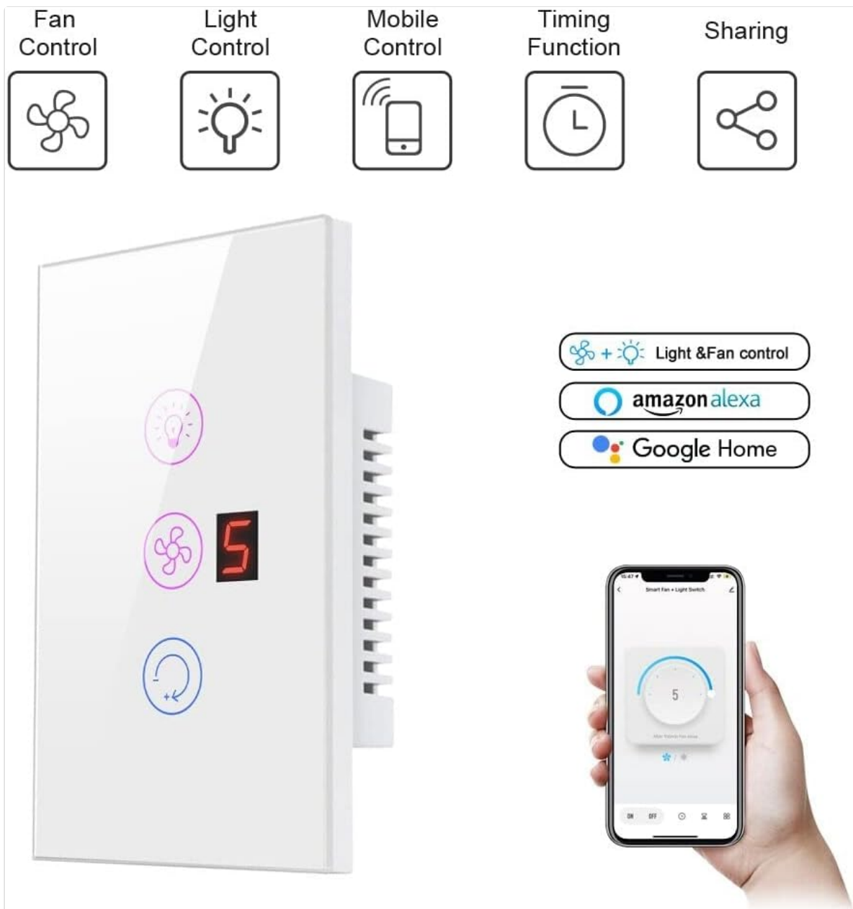
Figure 7.3: The timing function allows users to set specific times for the switch to turn devices ON or OFF automatically.