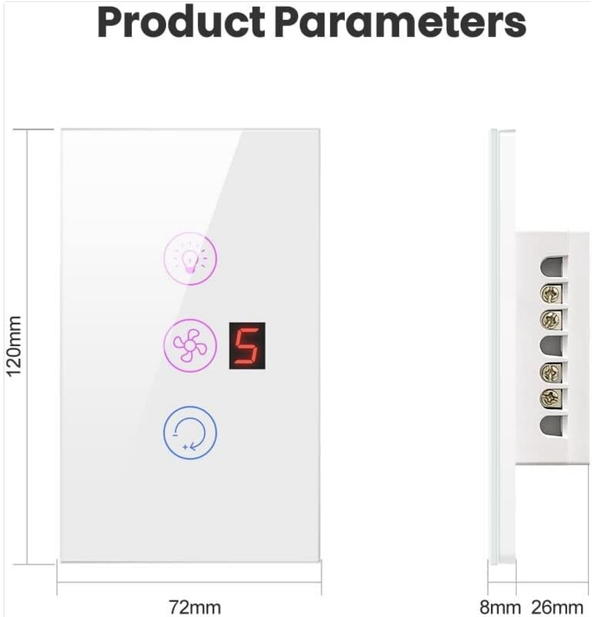
Figure 4.1: Physical dimensions of the Avatto WiFi Smart Fan and Light Switch.