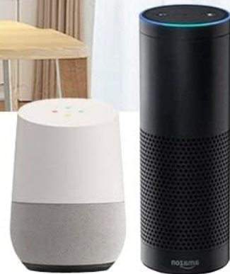
Figure 7.2: The smart switch can be controlled using voice commands through compatible devices like Amazon Echo and Google Home.

With amazon Echo and Alexa support You can now control your switch with your voice