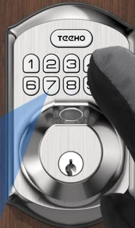
Figure 4.3: Auto-lock and one-touch locking.