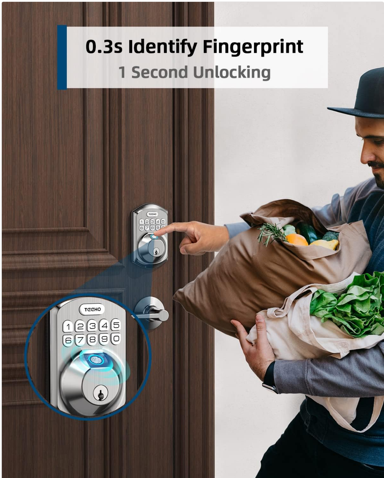
Figure 4.1: Fingerprint unlocking in progress.

To unlock the door using your fingerprint, place your registered finger on the fingerprint sensor. The lock will recognize your fingerprint in approximately 0.3 seconds and unlock the door within 1 second.