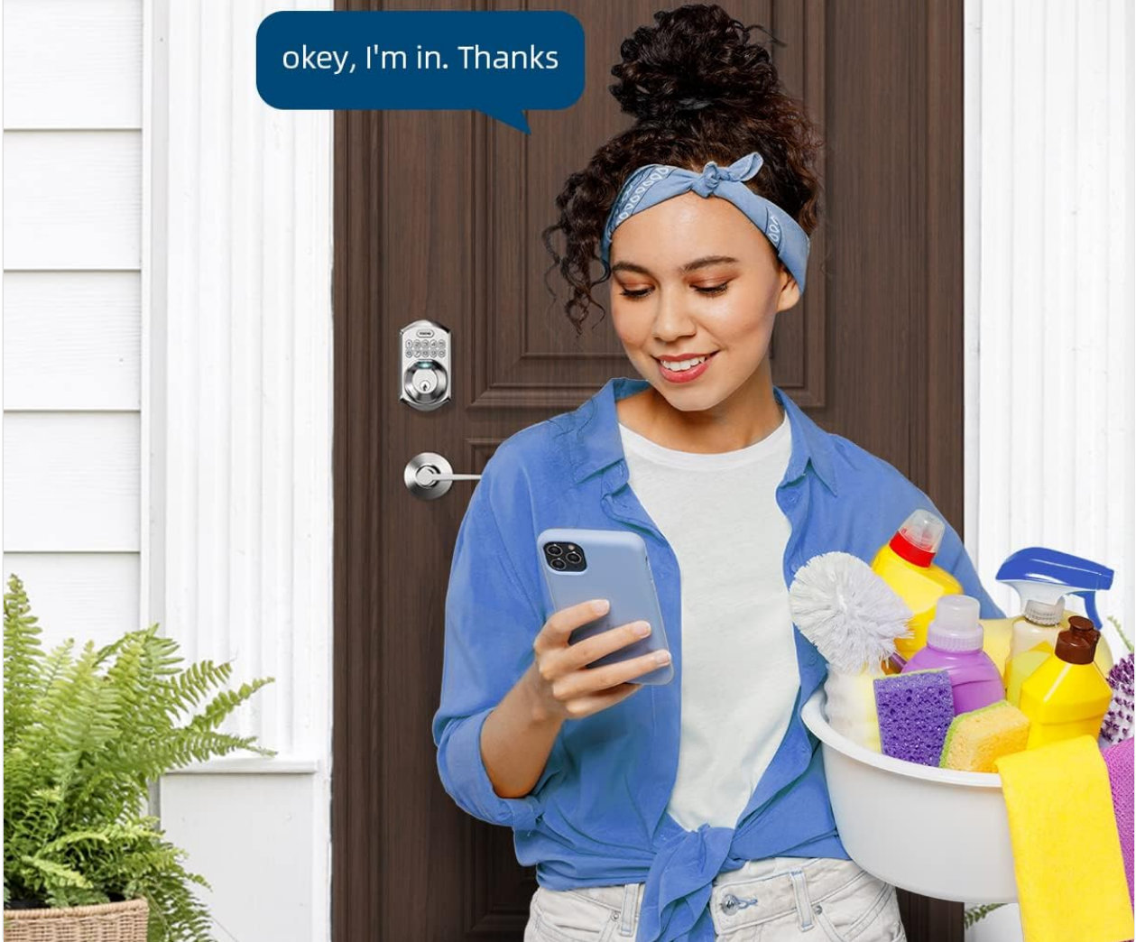
Figure 4.4: One-time PIN code usage.