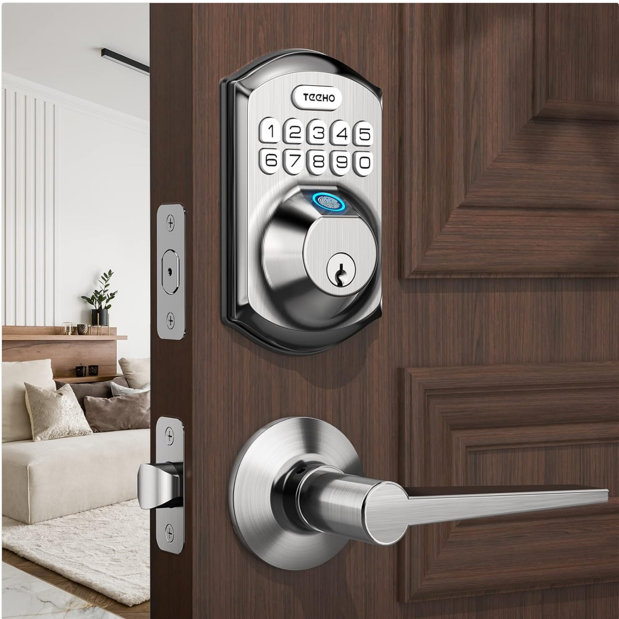
Figure 2.1: TEEHO Fingerprint Door Lock with lever handle.