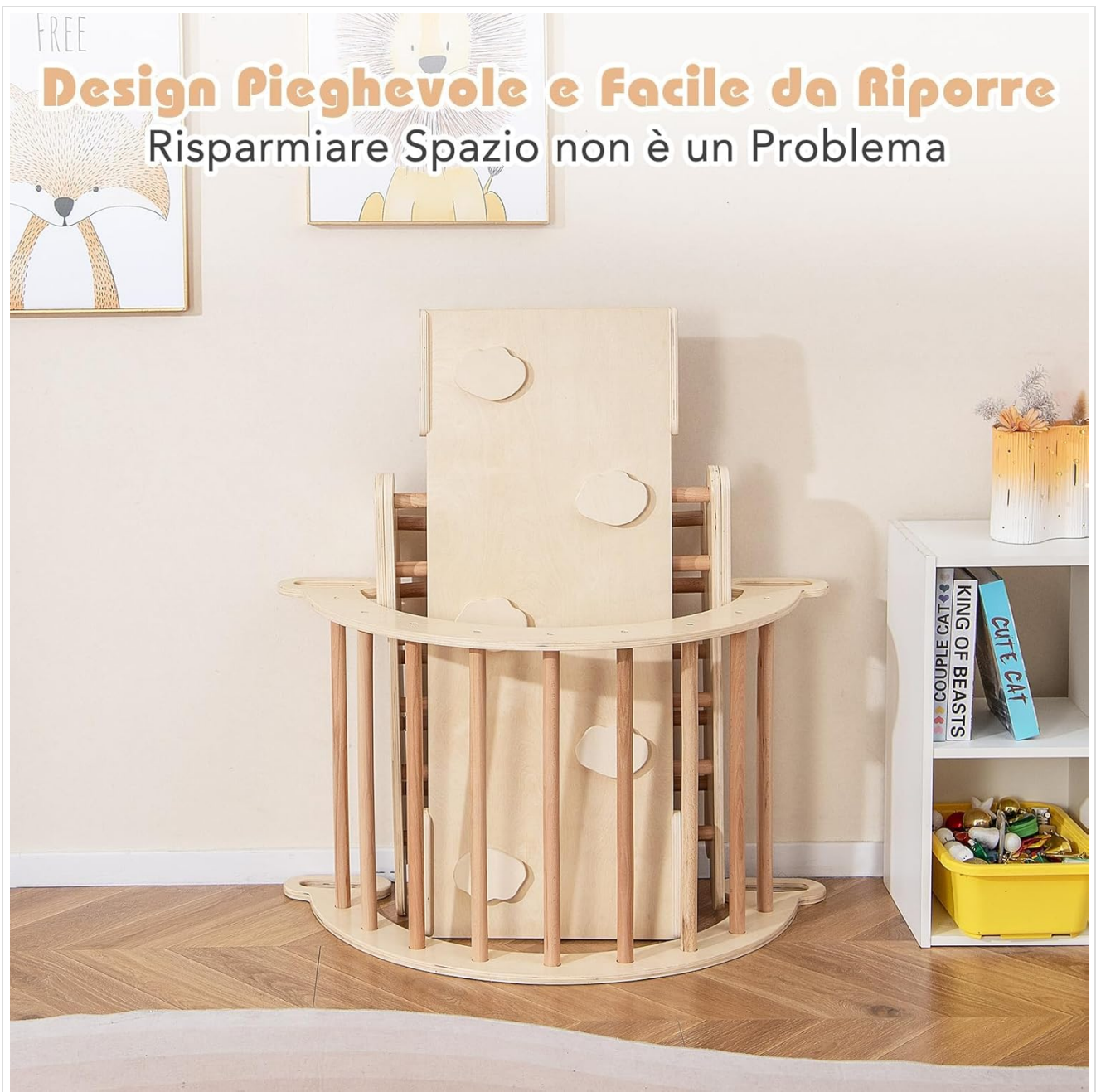
Image: Foldable Design and Easy Storage. This image shows the climbing triangle folded and stored upright, demonstrating its space-saving design.