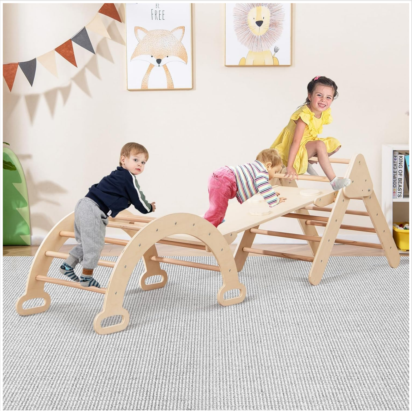
Image: Children engaging with the climbing set. This image shows children actively using the climbing triangle, arch, and ramp in a combined setup, demonstrating various play possibilities.

The climbing arch can also be used as a crawling tunnel when placed on its side, encouraging motor skills and imaginative play.