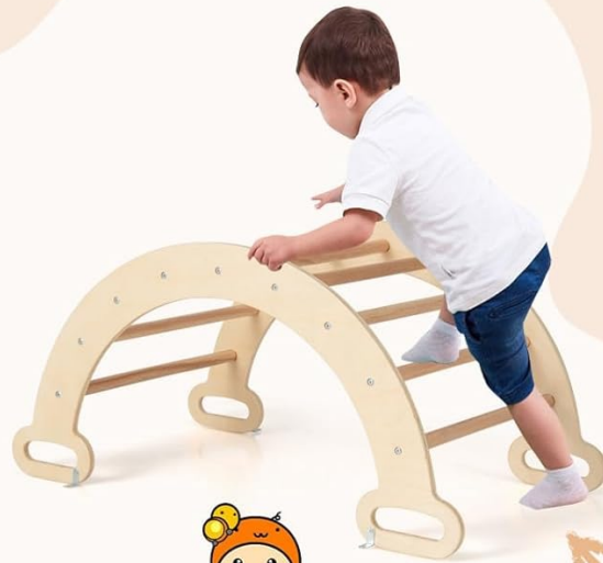
Arco di Arrampicata