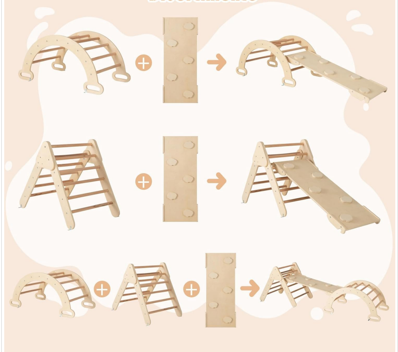
Image: Different Combination Modes. This image illustrates how the climbing triangle, arch, and ramp can be combined in various ways to create different play structures.