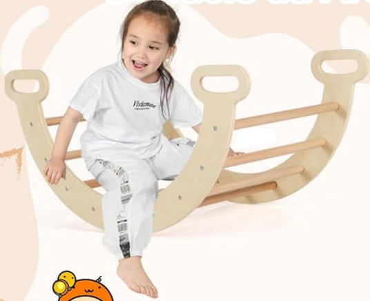
Cavallo a Dondolo