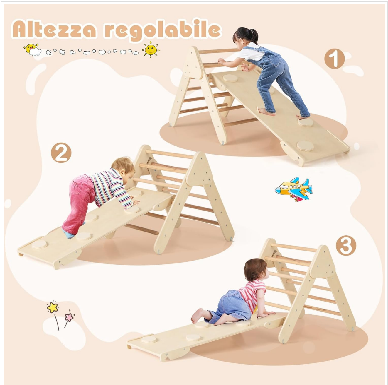
Image: Adjustable Height. This image demonstrates how the ramp can be attached at different heights on the climbing triangle to vary the challenge for children.