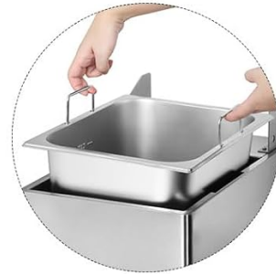
Handles on tank for easy removal, cleaning easy as pie