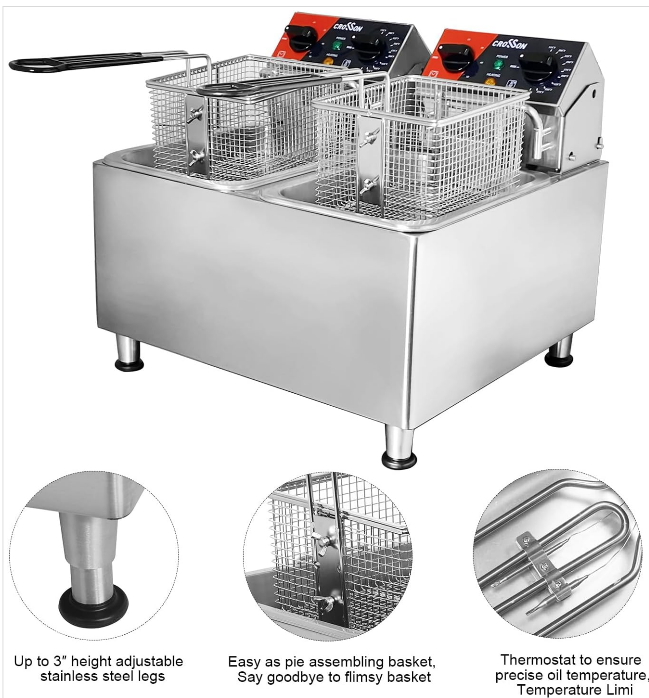
Figure 5.2: Features including adjustable stainless steel legs for stability, a robust frying basket, and the thermostat probe ensuring accurate oil temperature.