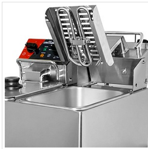
Figure 5.1: The swing-up heating element design facilitates easy access to the oil tank for cleaning and oil drainage.