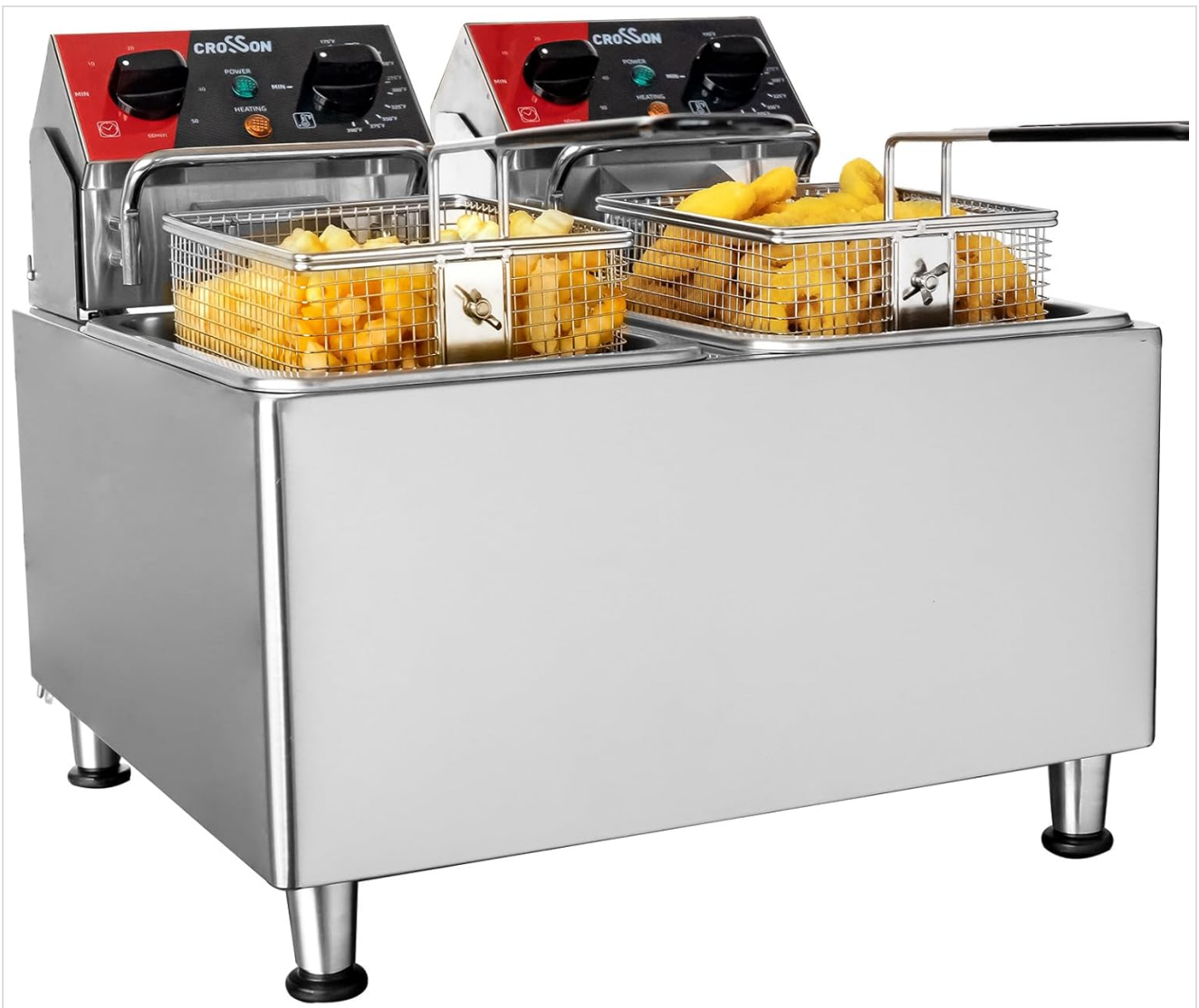
Figure 2.1: The CROSSON 20Lbs Dual Tank Electric Deep Fryer with two baskets of food.