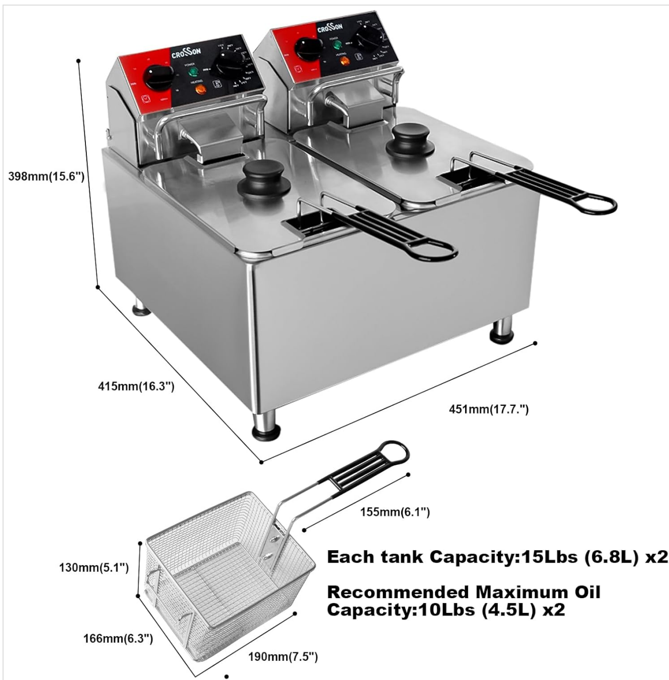
Figure 7.1: Dimensional drawing of the CROSSON 20Lbs Dual Tank Electric Deep Fryer and its frying basket, showing key measurements in inches and millimeters.