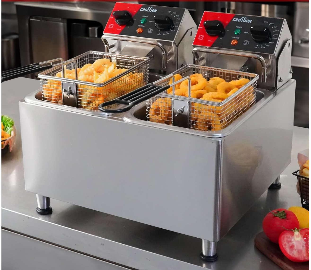
Figure 2.2: Illustration of the dual tank system, designed to prevent flavor transfer between different fried items.

Say goodbye to unwanted flavour transfer! Dual Tanks Equipped, Each for a sole Purpose.