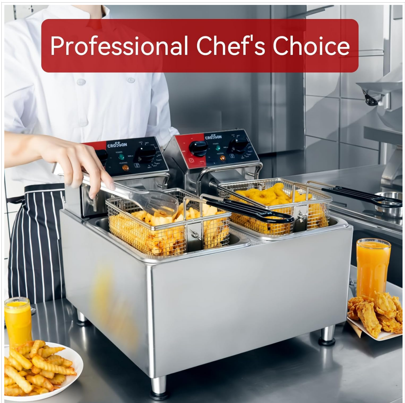
Figure 4.1: A chef demonstrating the use of the dual tank deep fryer for preparing different food items.