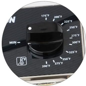
Germany EGO Thermostat Inside, Premium Precise Temperature Control