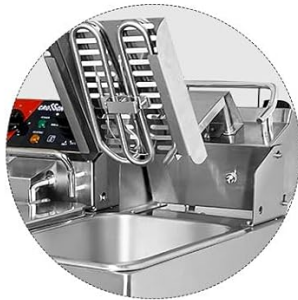
Swung up fryer head for easy drainage and cleaning