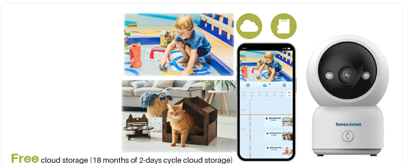
Image: Free cloud storage and Micro SD card storage benefits.