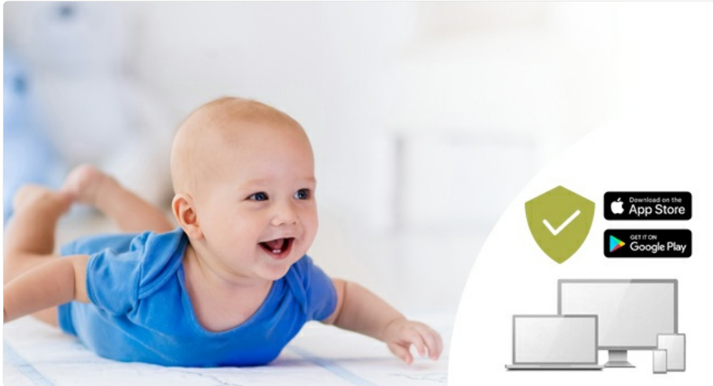
Image: Download the companion app from your device's app store.