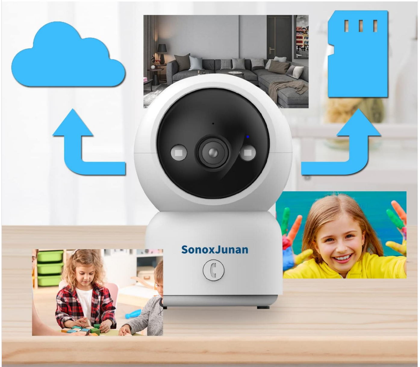
Image: Visual representation of cloud and Micro SD card storage options.