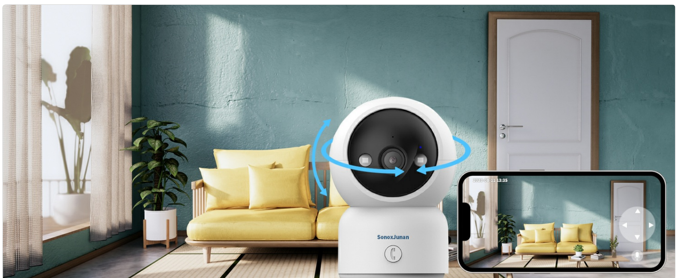
Image: Visual representation of the camera's pan and tilt functionality.