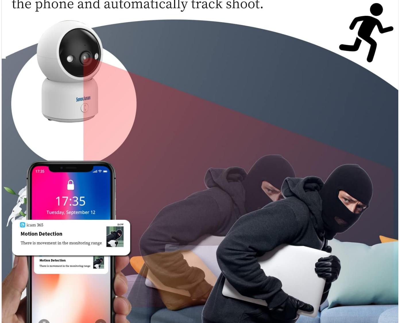
Image: Motion detection feature in action, showing an alert on a smartphone.

When it detects someone passing through the monitoring area it will automatically send an alarm message to the phone and automatically track shoot.