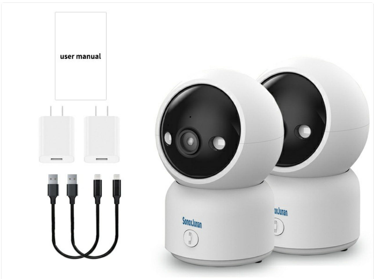
Image: Package contents including cameras, power adapters, USB cables, and user manual.

Before you begin, please ensure all components are present: