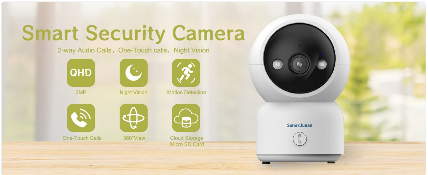
Image: Overview of the camera's smart features.