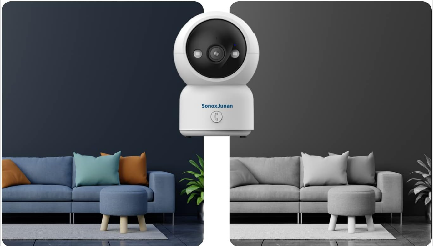
Image: Demonstration of the camera's HD Night Vision capabilities, showing both color and infrared modes.