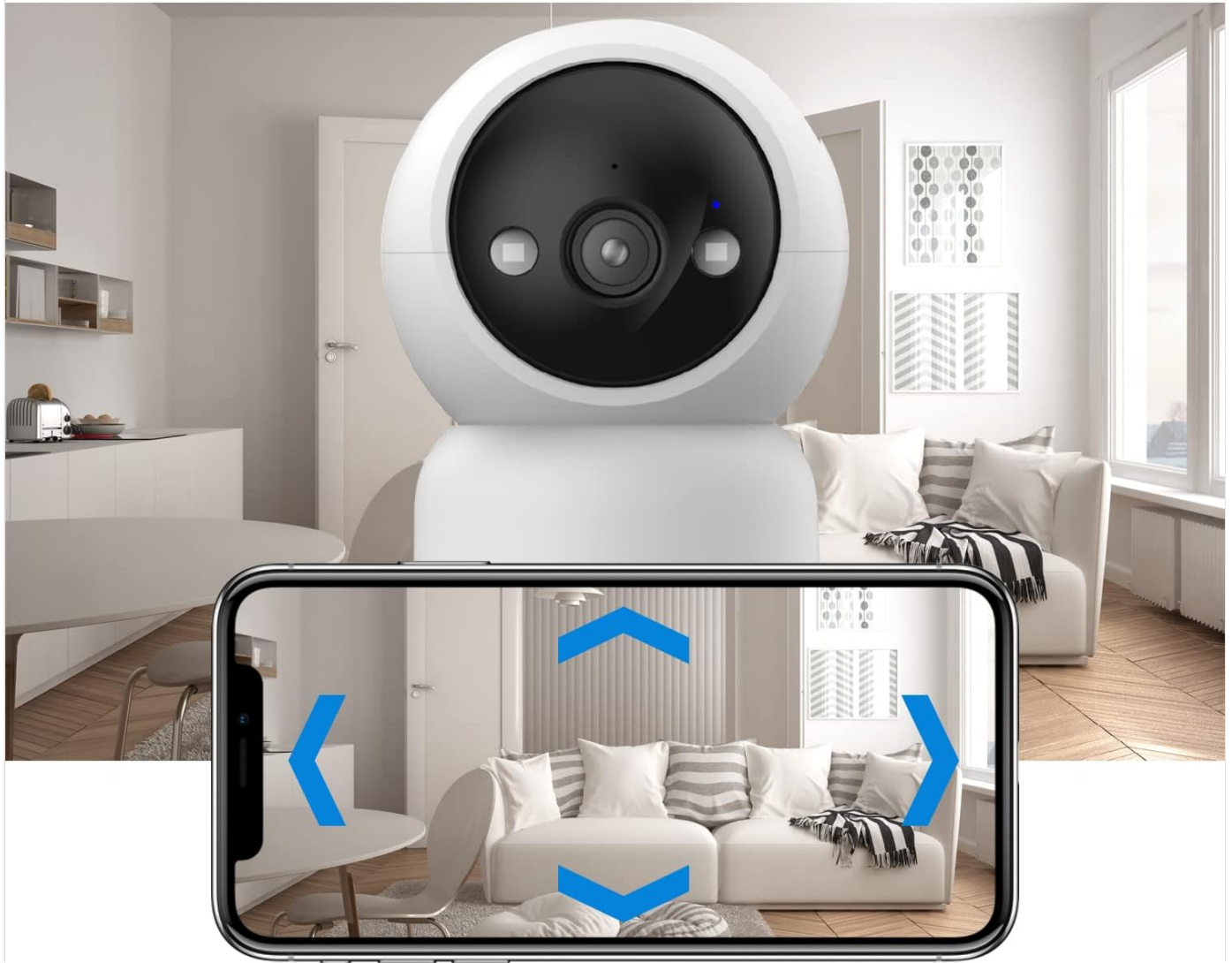
Image: The camera's 360° view capability controlled via a smartphone.