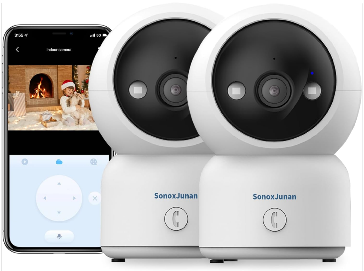
Image: Two SonoxJunan 2K Indoor Security Cameras with a smartphone showing the live feed and control interface.