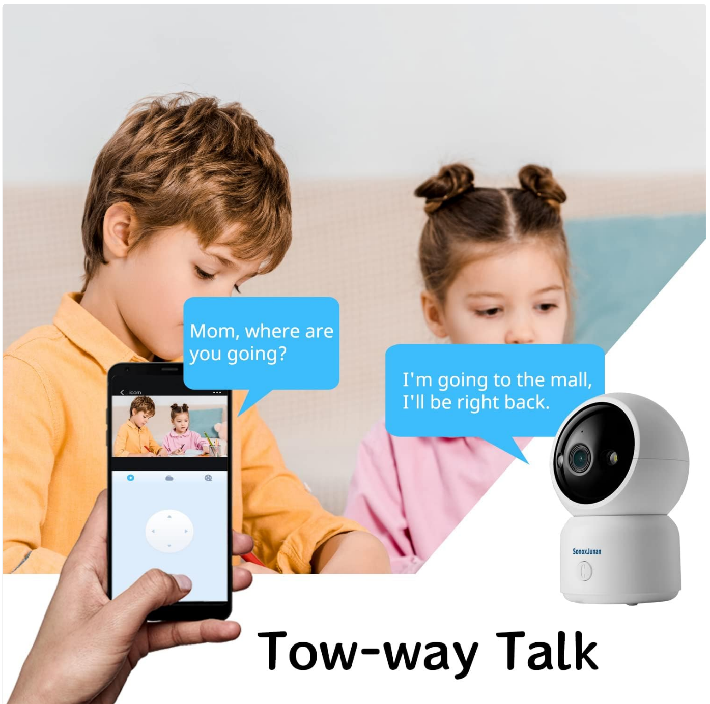
Image: Illustration of the two-way talk feature in use.