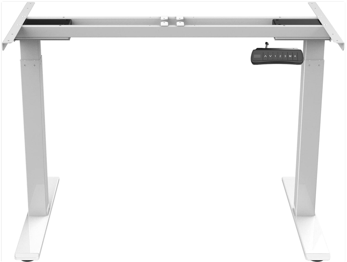
Image: The PrimeCables Dual-Motor Standing Desk Frame in white, showing the two legs, crossbar, and control panel.