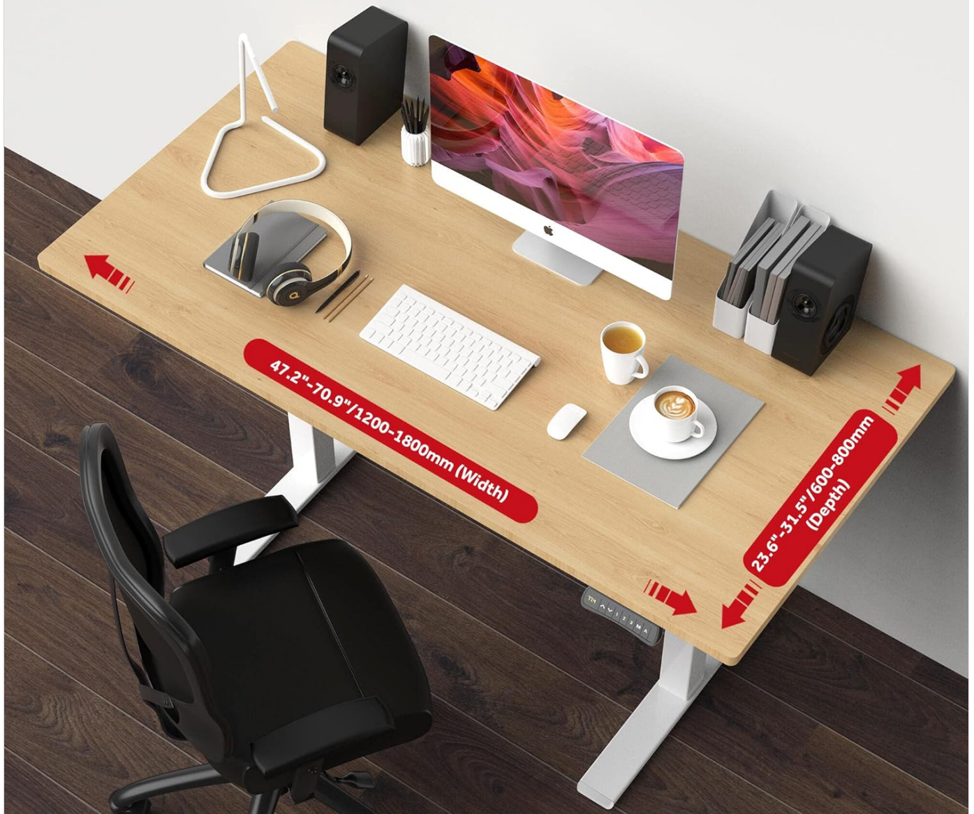
Image: Visual guide showing recommended tabletop dimensions: 47.2"-70.9" (1200-1800mm) width and 23.6"-31.5" (600-800mm) depth.

47.2"-70.9"/1200-1800mm(Width) 23.6"-31.5"/600-800mm(Depth)