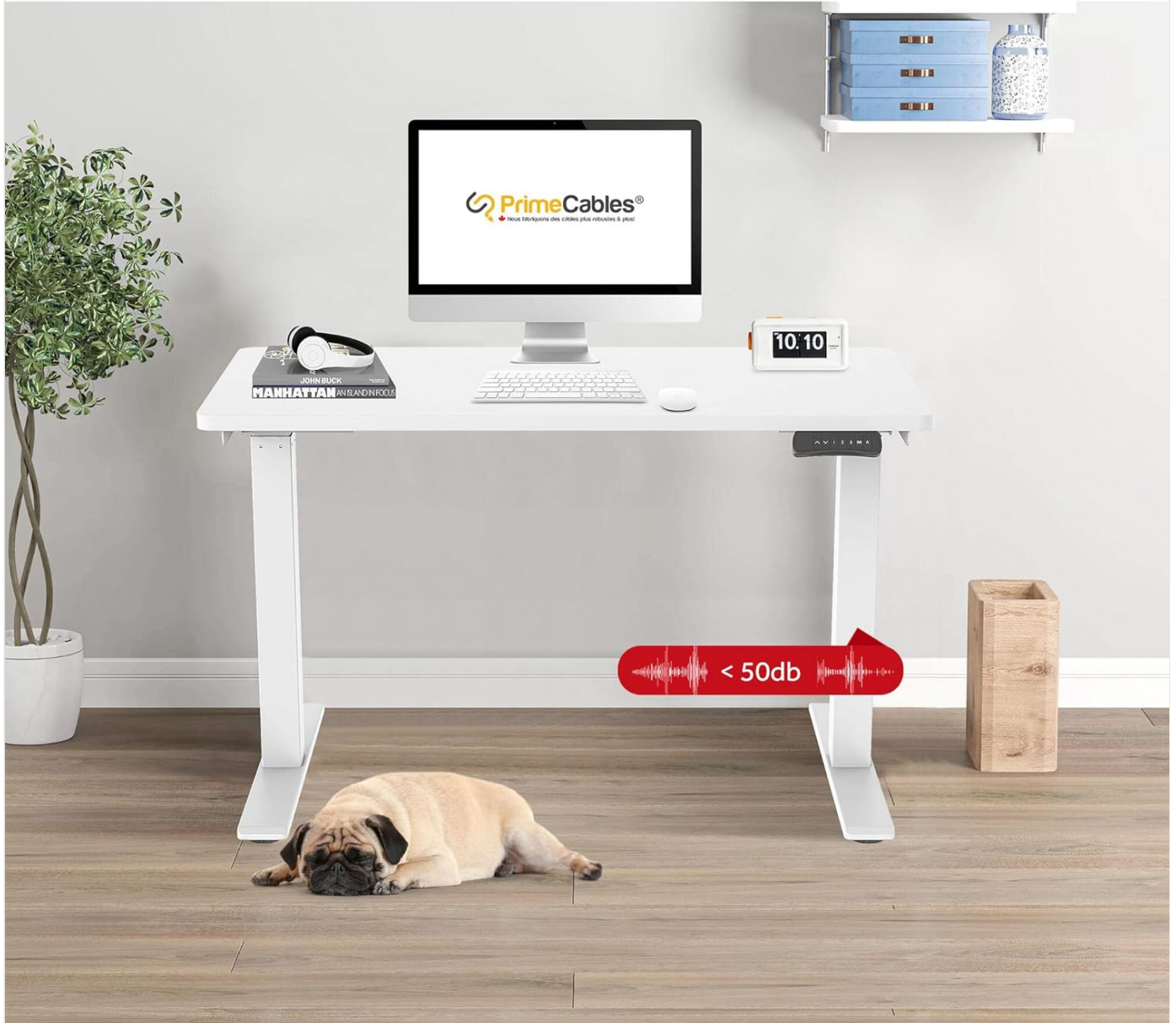
Image: A PrimeCables standing desk with a computer setup and a pug resting underneath, emphasizing its ultra-silent operation (less than 50dB).