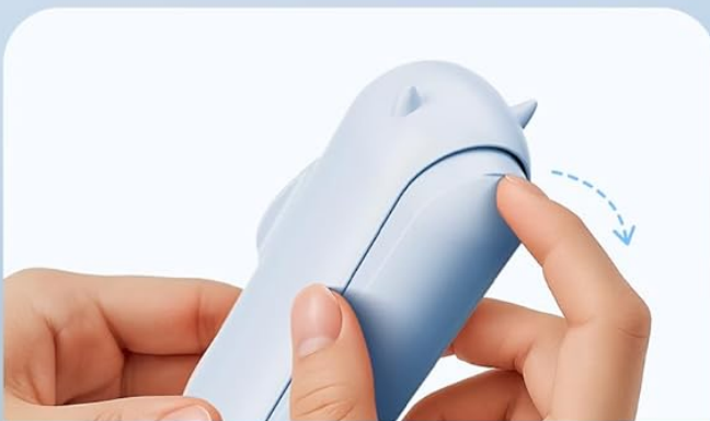
Method 1: Open from the Small Gap at Top