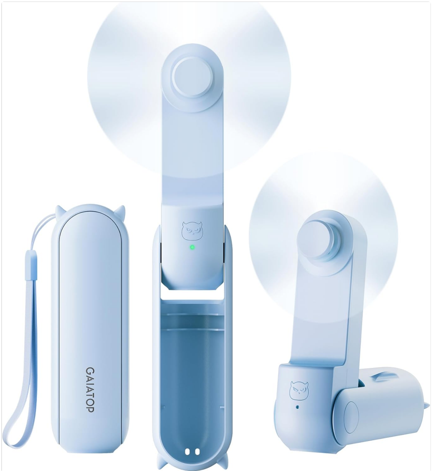
Image: The GAIATOP Portable Handheld Fan showcasing its compact folded form, handheld use, and desktop setup.