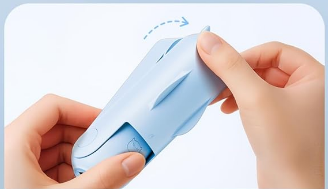
Method 2: Press the Switch Base Then Pull off the Exposed Top