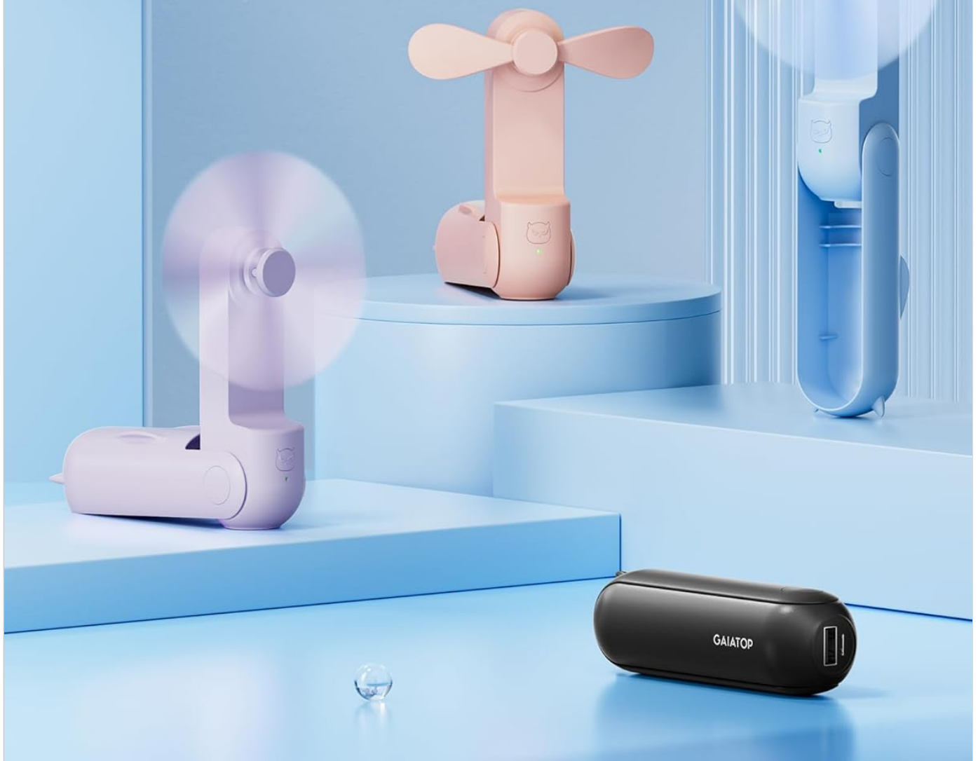
Image: The GAIATOP Portable Handheld Fan displaying its Type-C charging port and LED indicator.