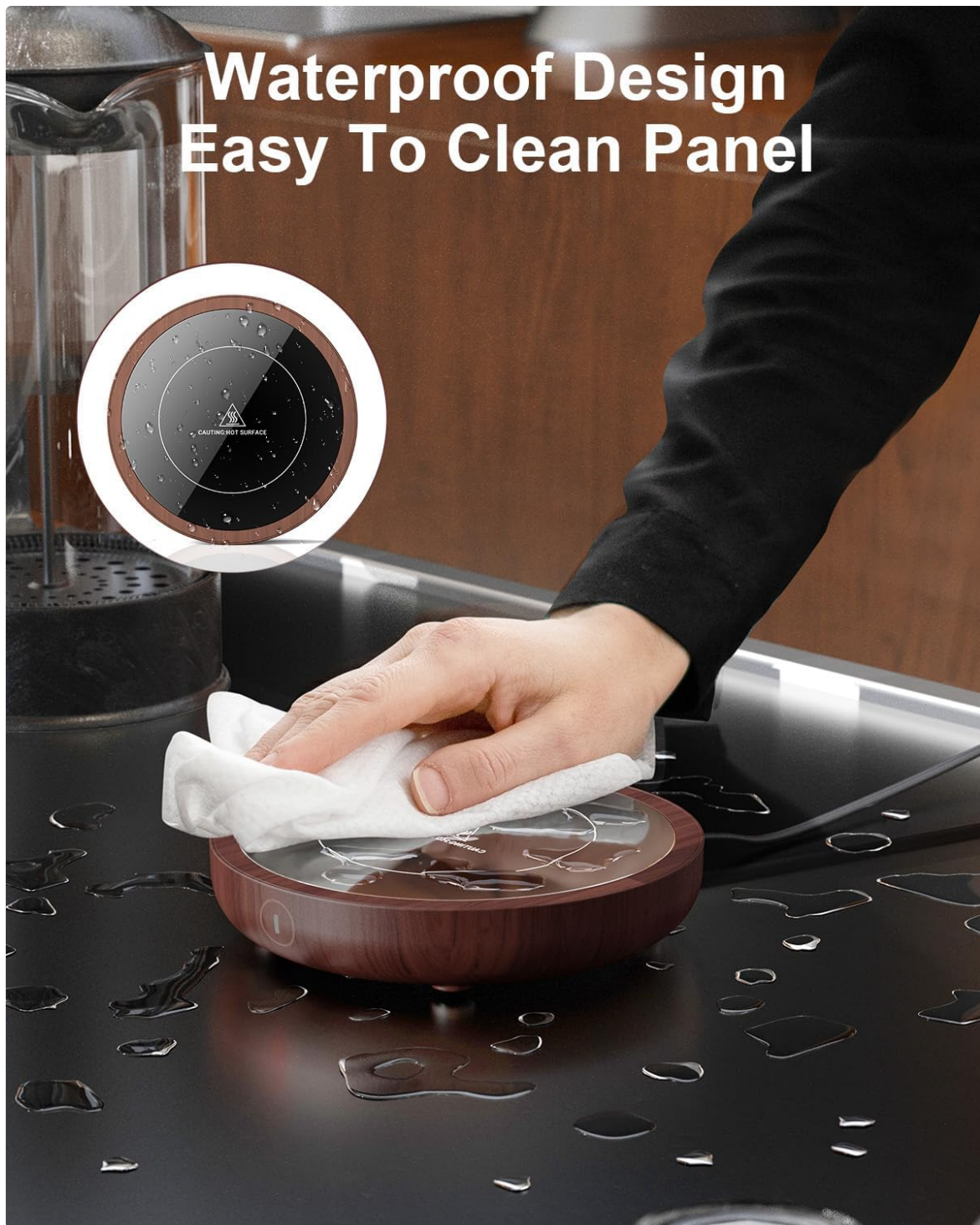
Image 7.1: The waterproof design allows for easy cleaning of spills.