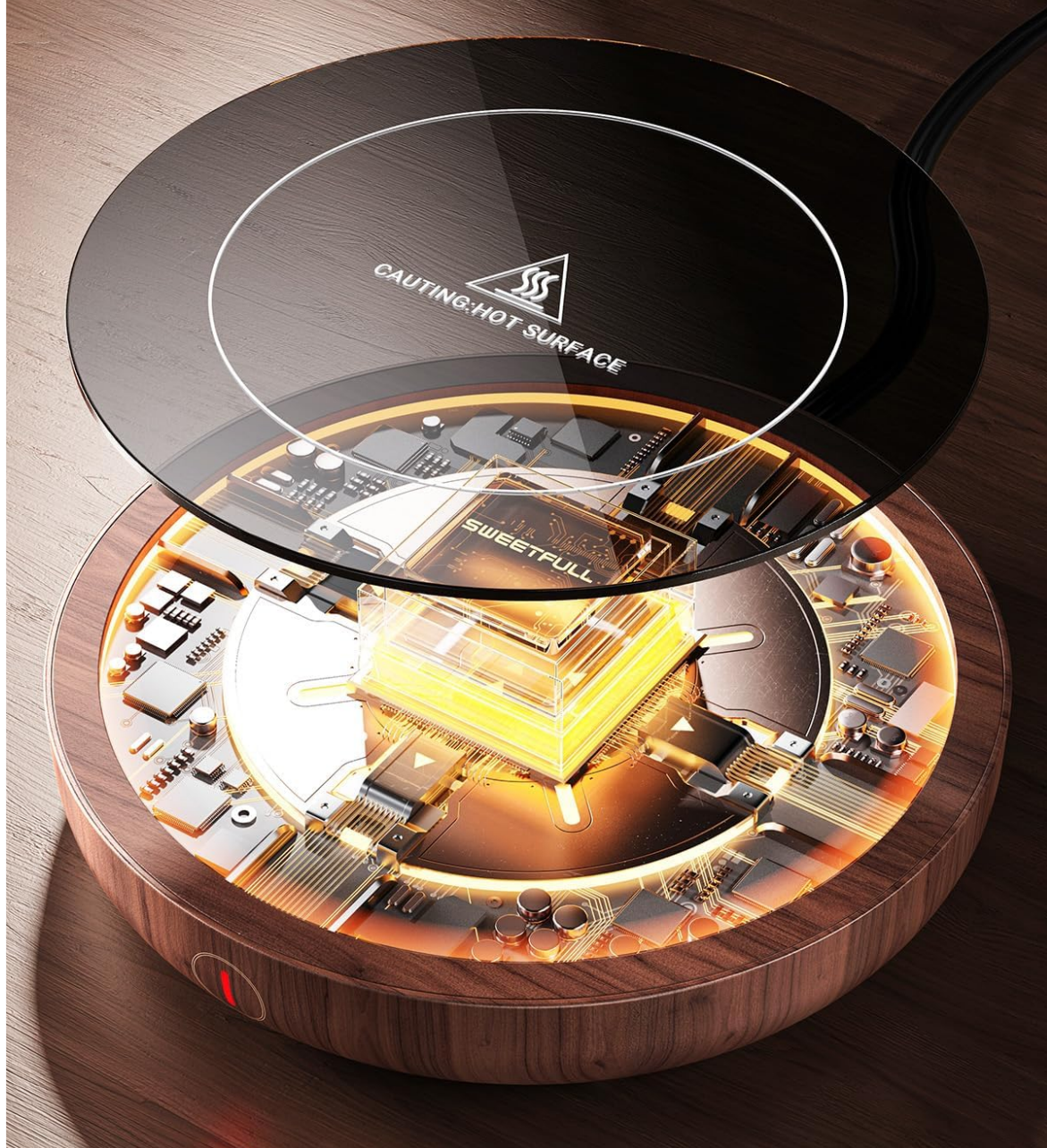
Image 4.2: Internal components highlighting the 36W heating element and ceramic glass.

Safety ceramic glass with resistance up to 1100°F