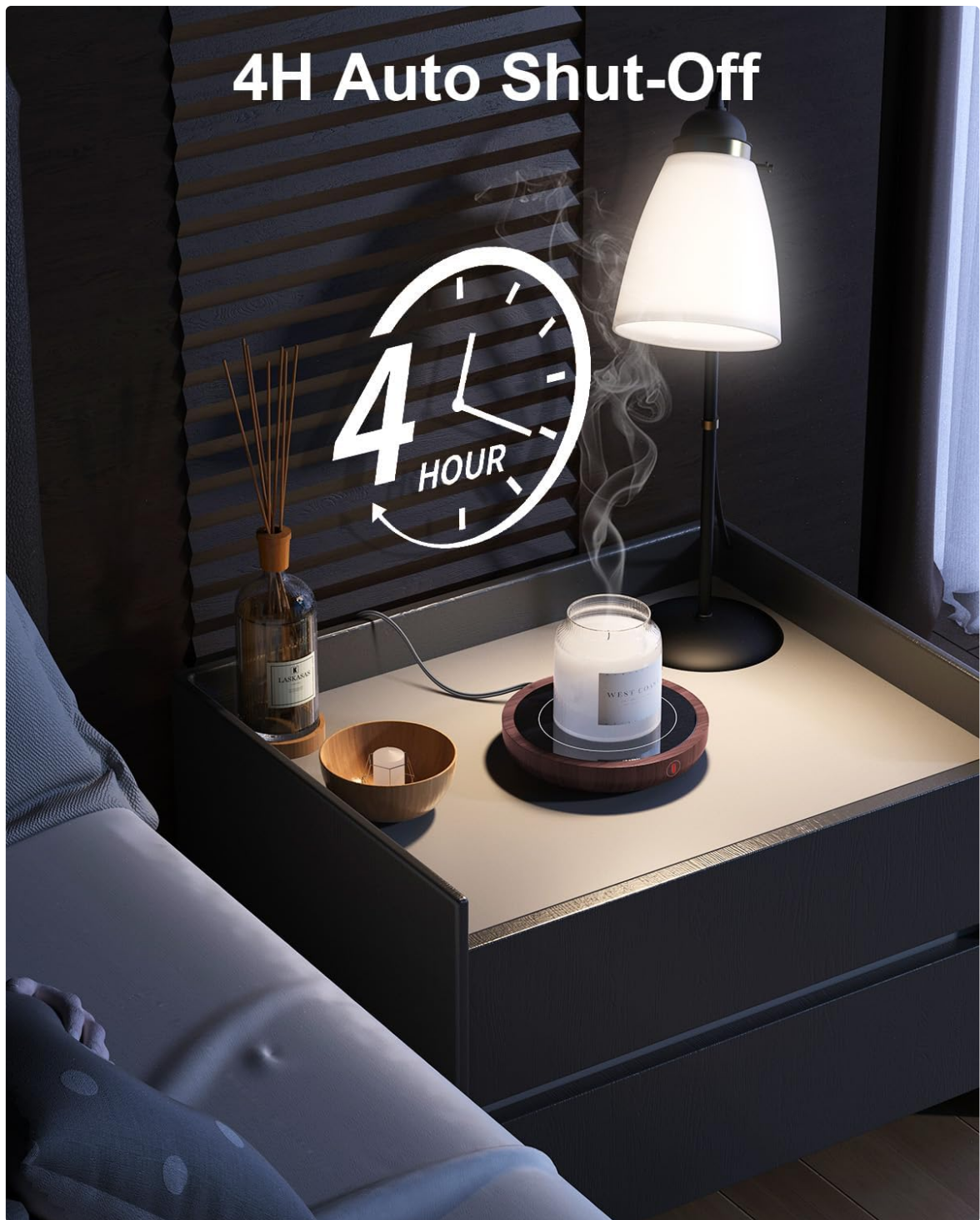
Image 6.2: The warmer features a 4-hour auto shut-off for safety. Your browser does not support the video tag.

Video 6.2: Demonstration of the warmer's ability to heat various mug types and beverages.