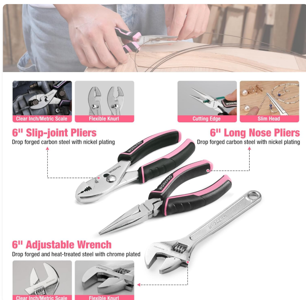
Figure 3: Gripping and fastening tools: 6-inch slip-joint pliers, 6-inch long nose pliers, and 6-inch adjustable wrench.