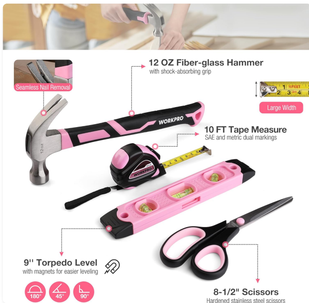
Figure 2: Essential measuring and striking tools: 12 oz hammer, 10 ft tape measure, 9-inch torpedo level, and 8-1/2 inch scissors.