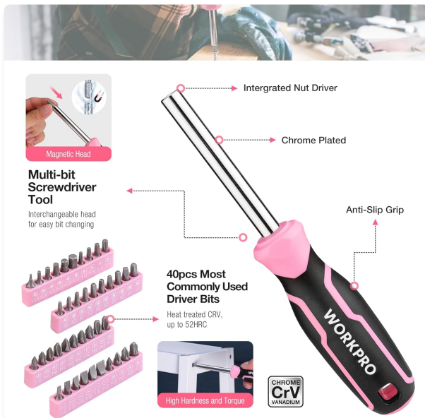
Figure 5: Versatile multi-bit screwdriver with magnetic head and 40 commonly used driver bits.