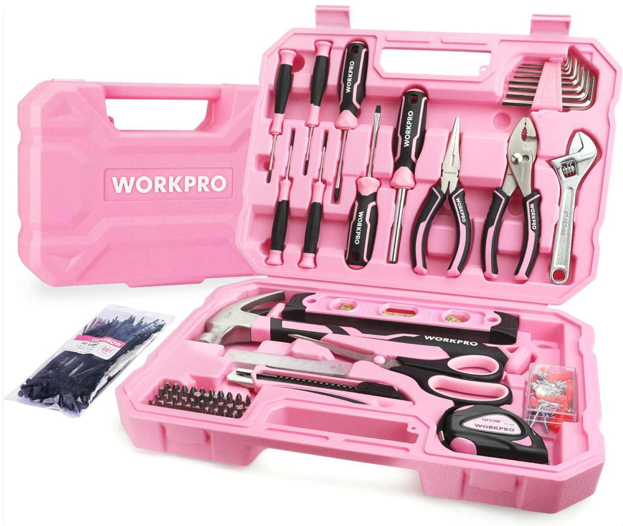
Figure 1: The WORKPRO 258-Piece Pink Household Tool Set, neatly organized within its durable carrying case.