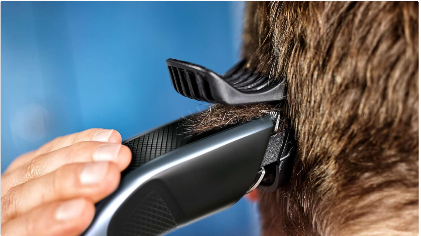
Figure 4.3: A close-up view of the clipper's blades and comb attachment actively cutting hair.