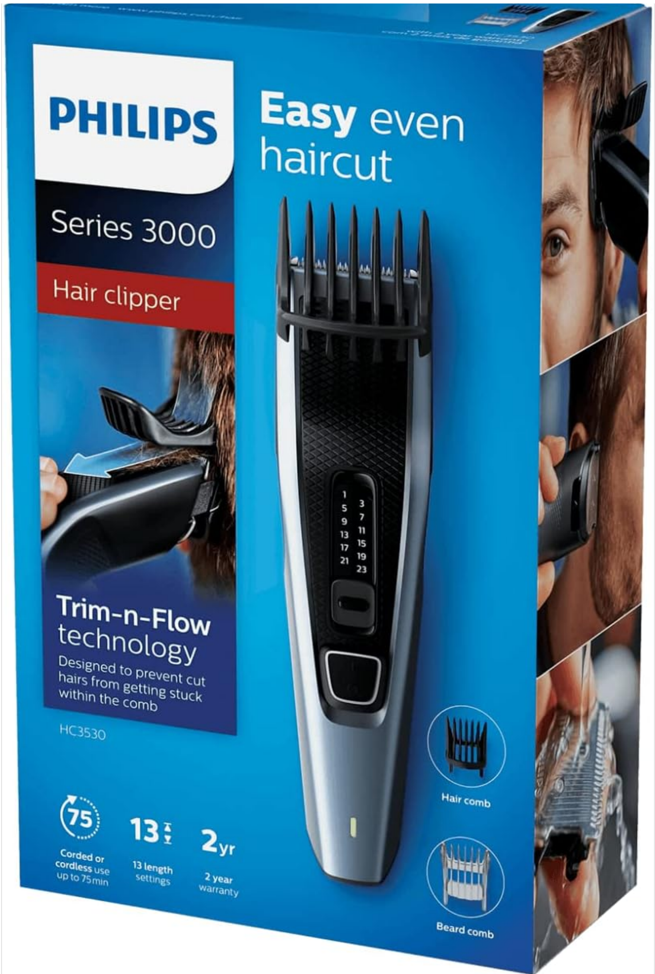
Figure 2.1: Retail packaging of the Philips HC3530/15 Hair Clipper, showing the product and its key features.