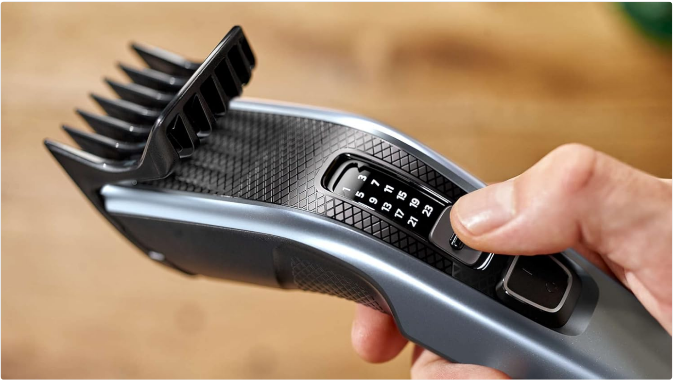
Figure 4.1: A hand demonstrating how to adjust the cutting length using the zoom wheel on the clipper.