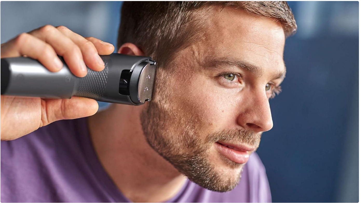
Figure 4.4: A user trimming his beard with the clipper, demonstrating use without a comb for a closer finish.