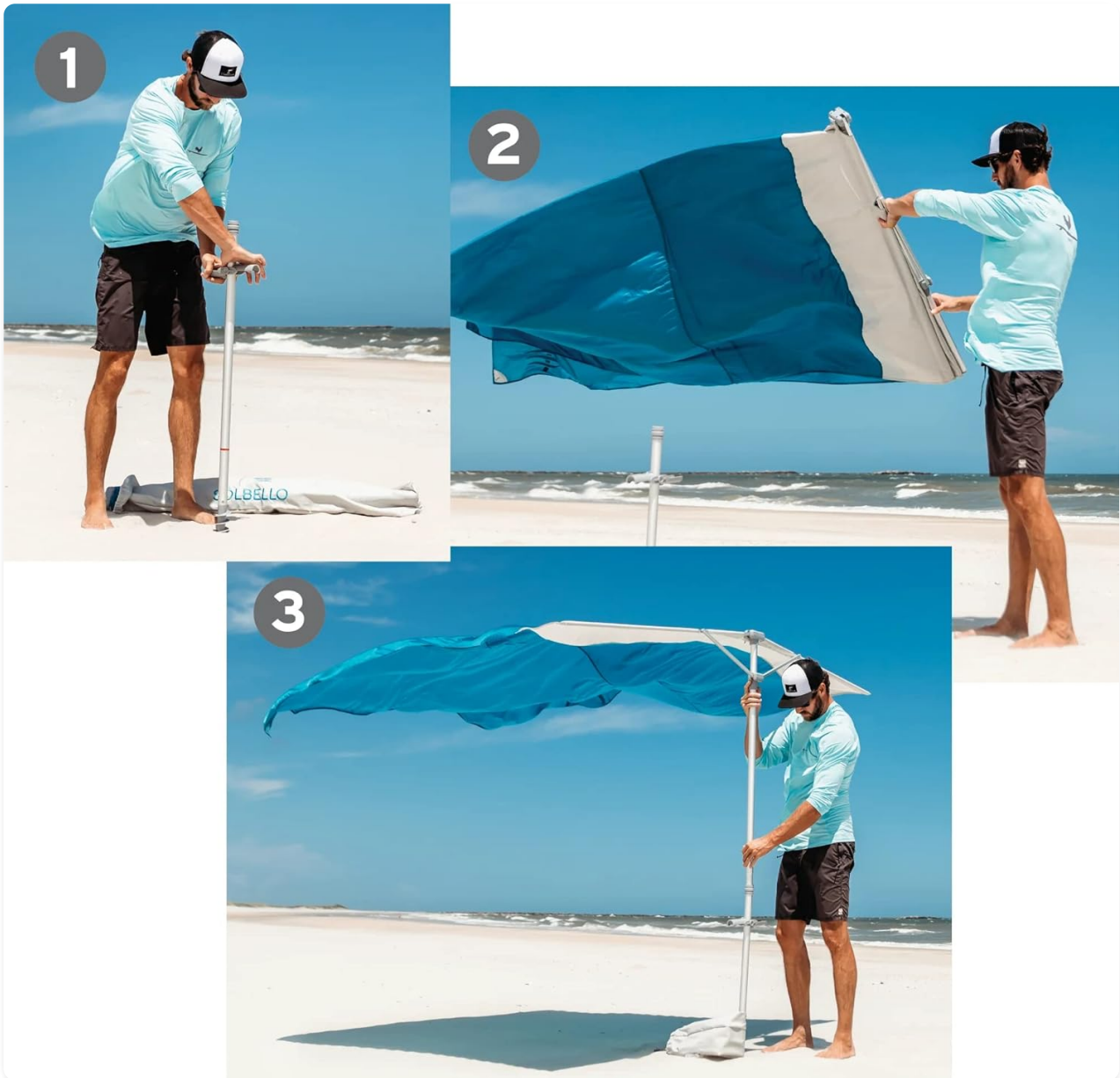
Figure 2: Step-by-step visual guide for quick and easy setup.