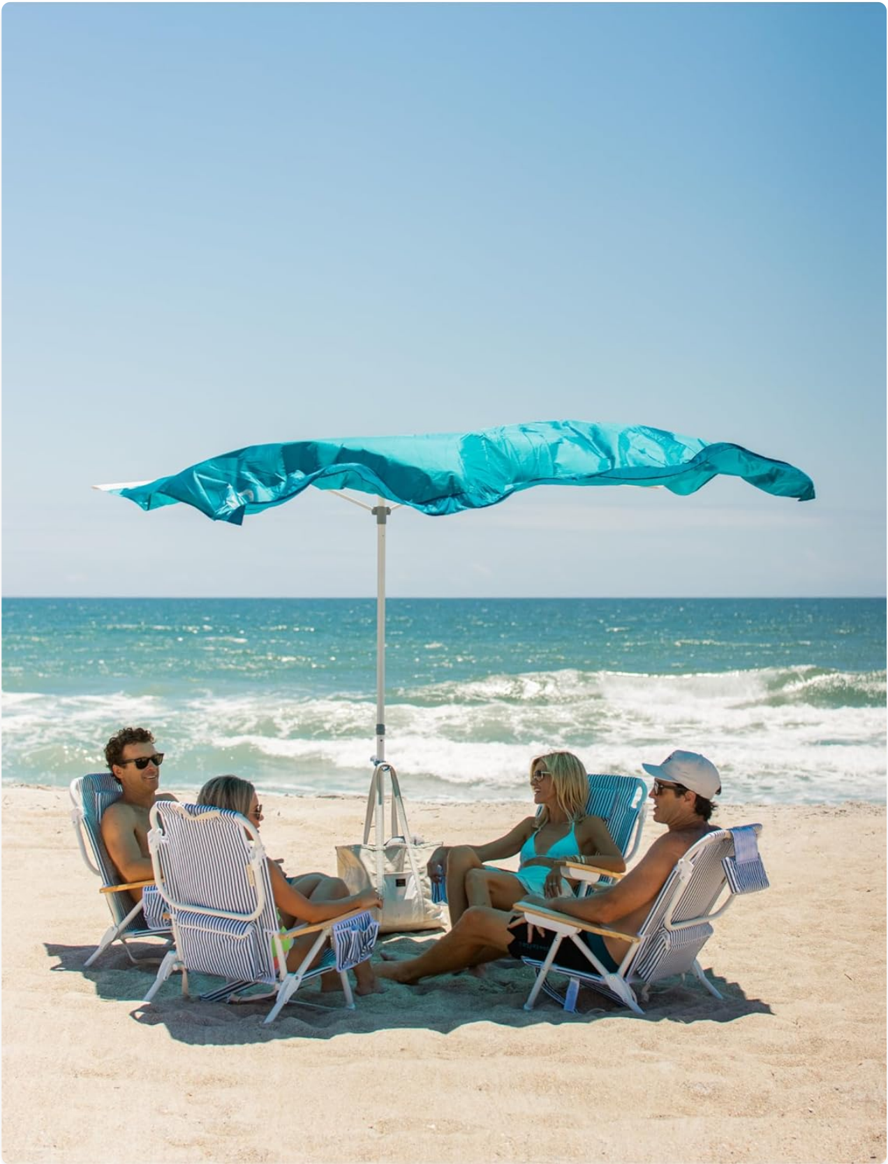
Figure 3: The Solbello shade providing comfortable coverage for a group.