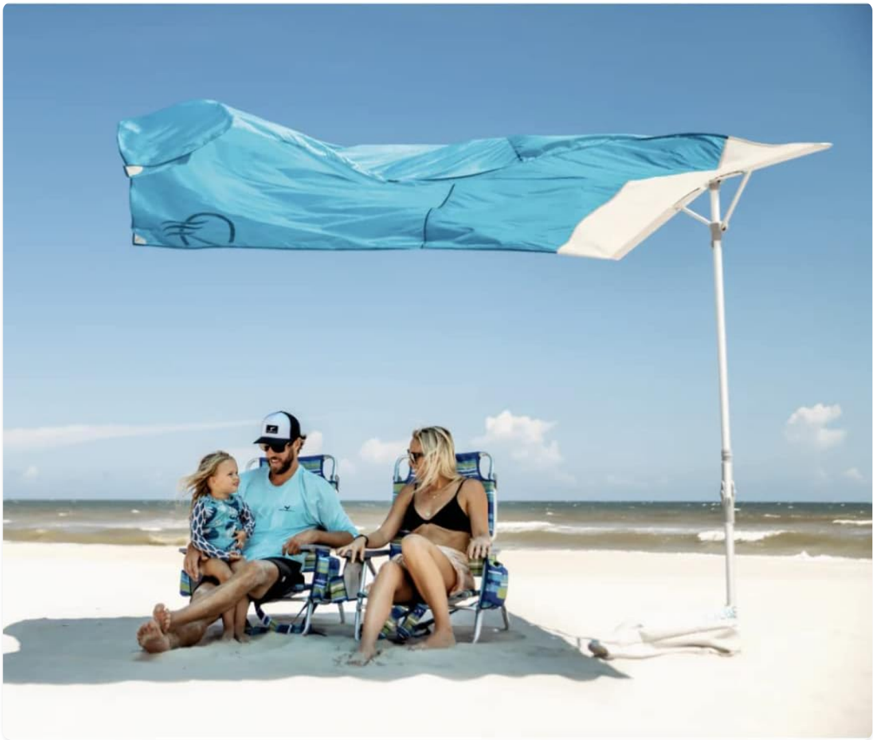
Figure 1: The Solbello® Wind-Driven® Beach Shade providing ample shade for a family on the beach.