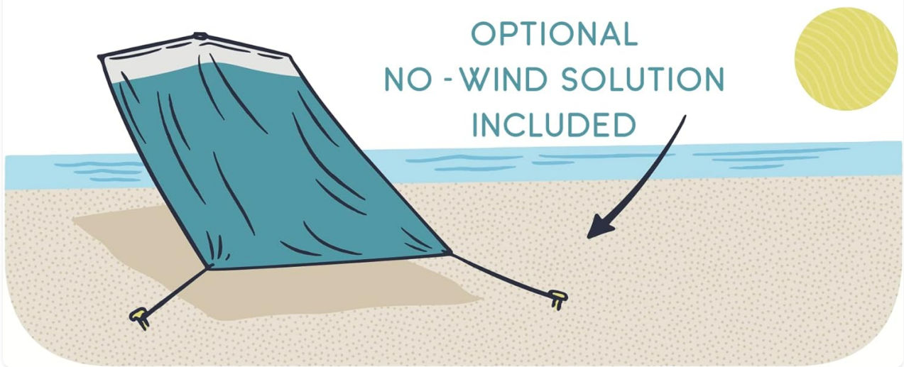
Figure 4: Dimensions and illustration of the No-Wind Solution.