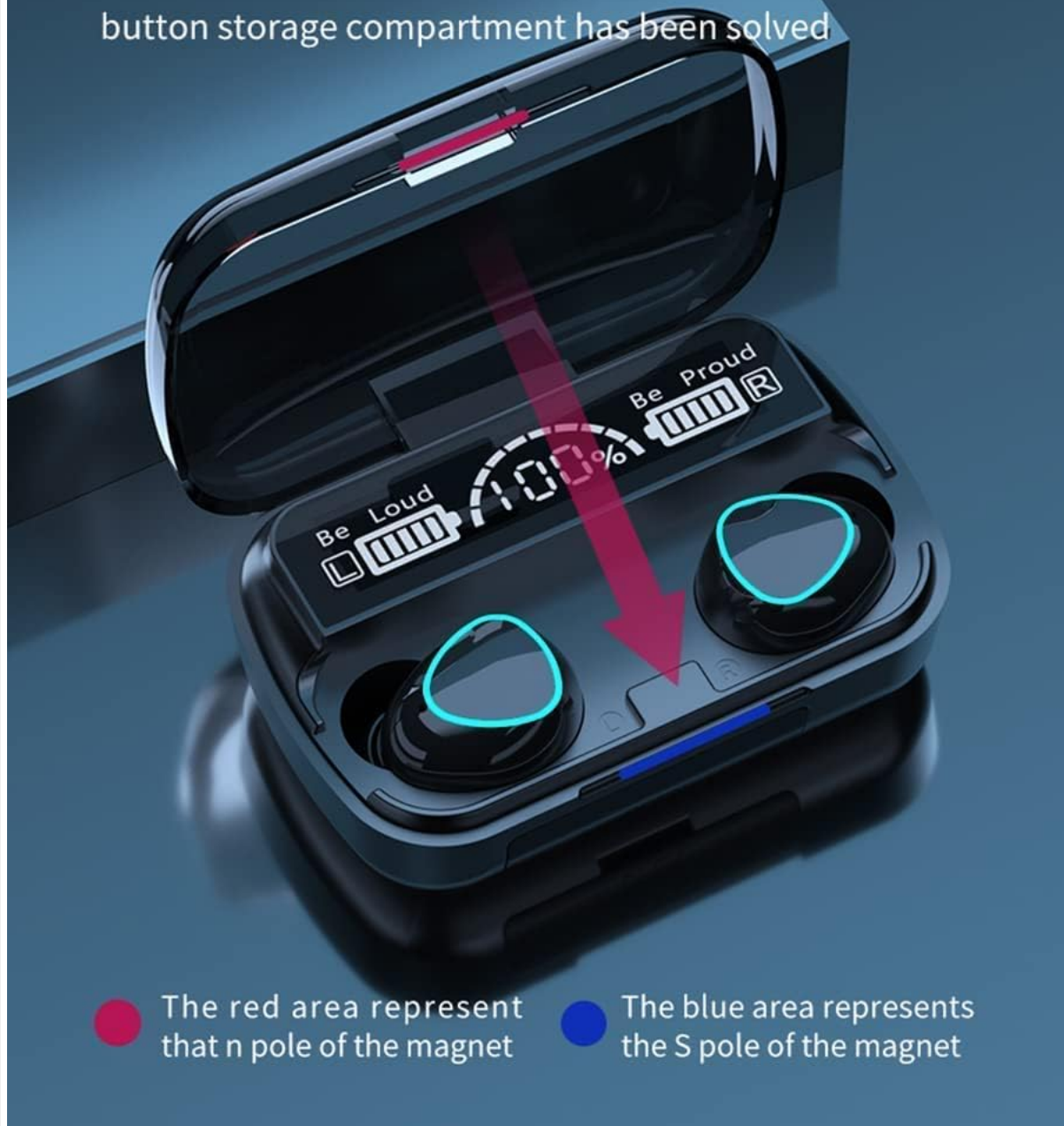
Figure 4: The charging case utilizes magnetic induction for secure and convenient storage of the earbuds. This design eliminates the need for physical buttons to open the compartment, enhancing user experience.

Magnetic induction storage cabin, no need to press hard, the user experience has been greatly increased, and the embarrassment of opening the traditional button storage compartment has been solved