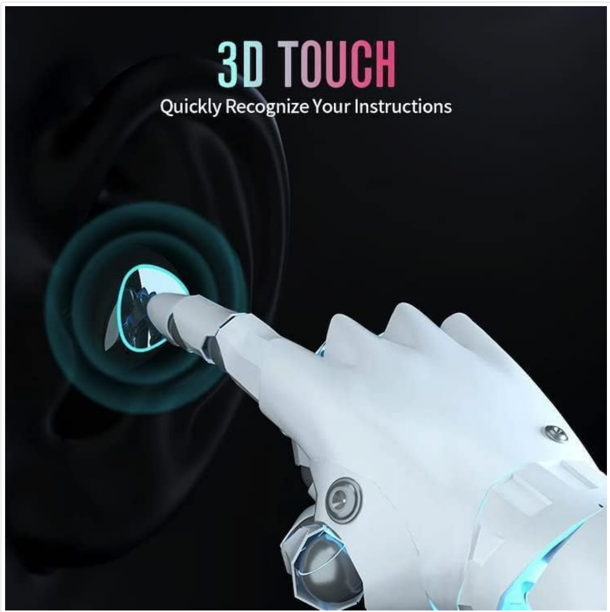
Figure 5: The earbuds feature a 3D touch sensitive area for controlling various functions. This allows for quick and intuitive recognition of user instructions.