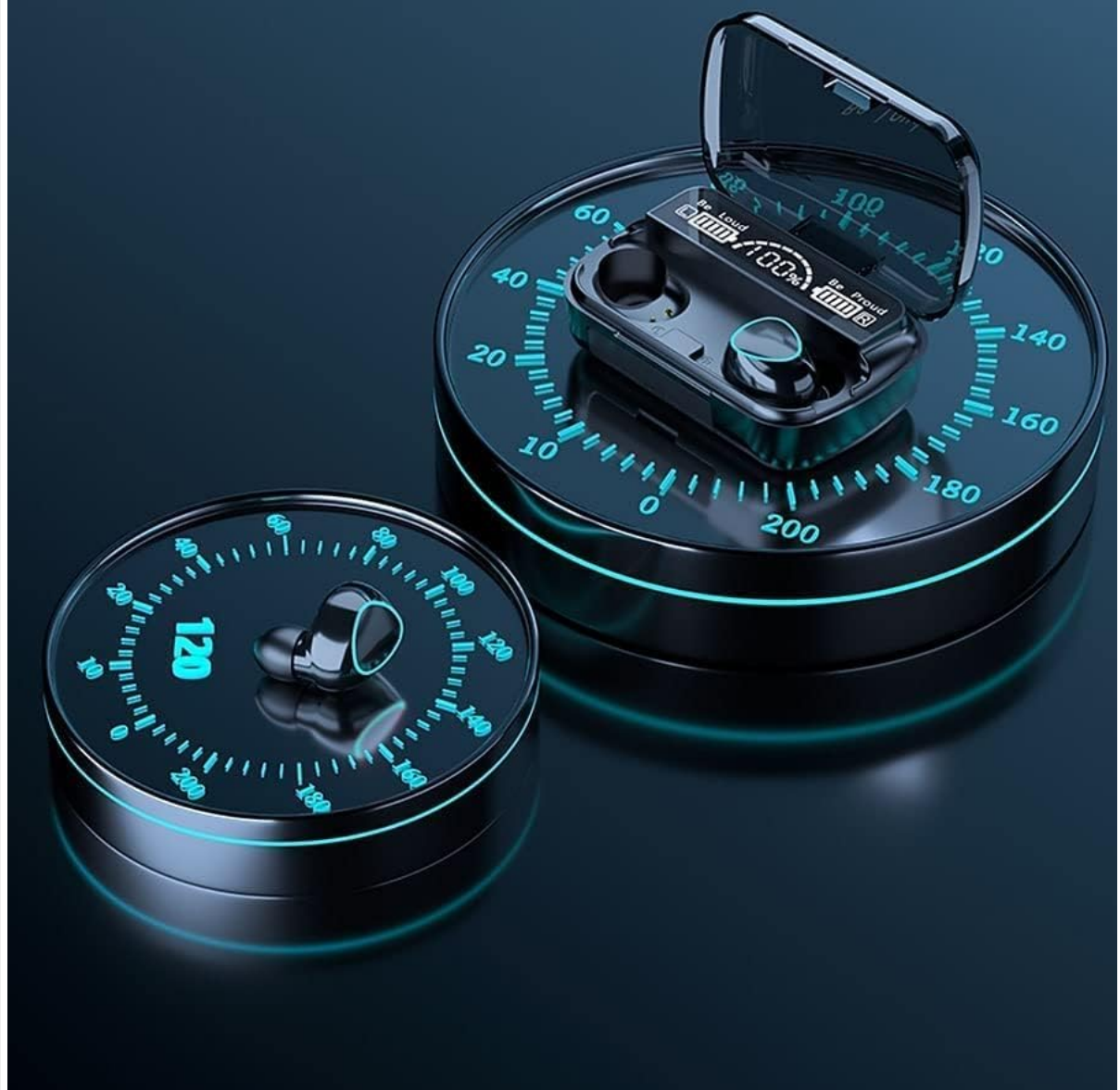
Figure 2: The charging case features a digital display that shows the remaining battery percentage of the case and the charging status of each earbud. This large capacity charging cabin ensures extended use.

Built-in large-capacity lithium battery, which can be charged immediately and fully charged, is suitable for a variety of scenarios, so that you can travel without worry