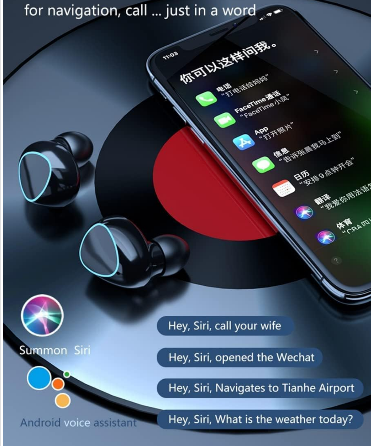
Figure 6: Long pressing the touch area for 2 seconds activates your device's voice assistant (e.g., Siri, Google Assistant). This allows for hands-free control and information retrieval.

Long press for 2 seconds to summon the voice assistant, and talk with your personal assistant conveniently and quickly. Check the weather, ask for navigation, call ... just in a word