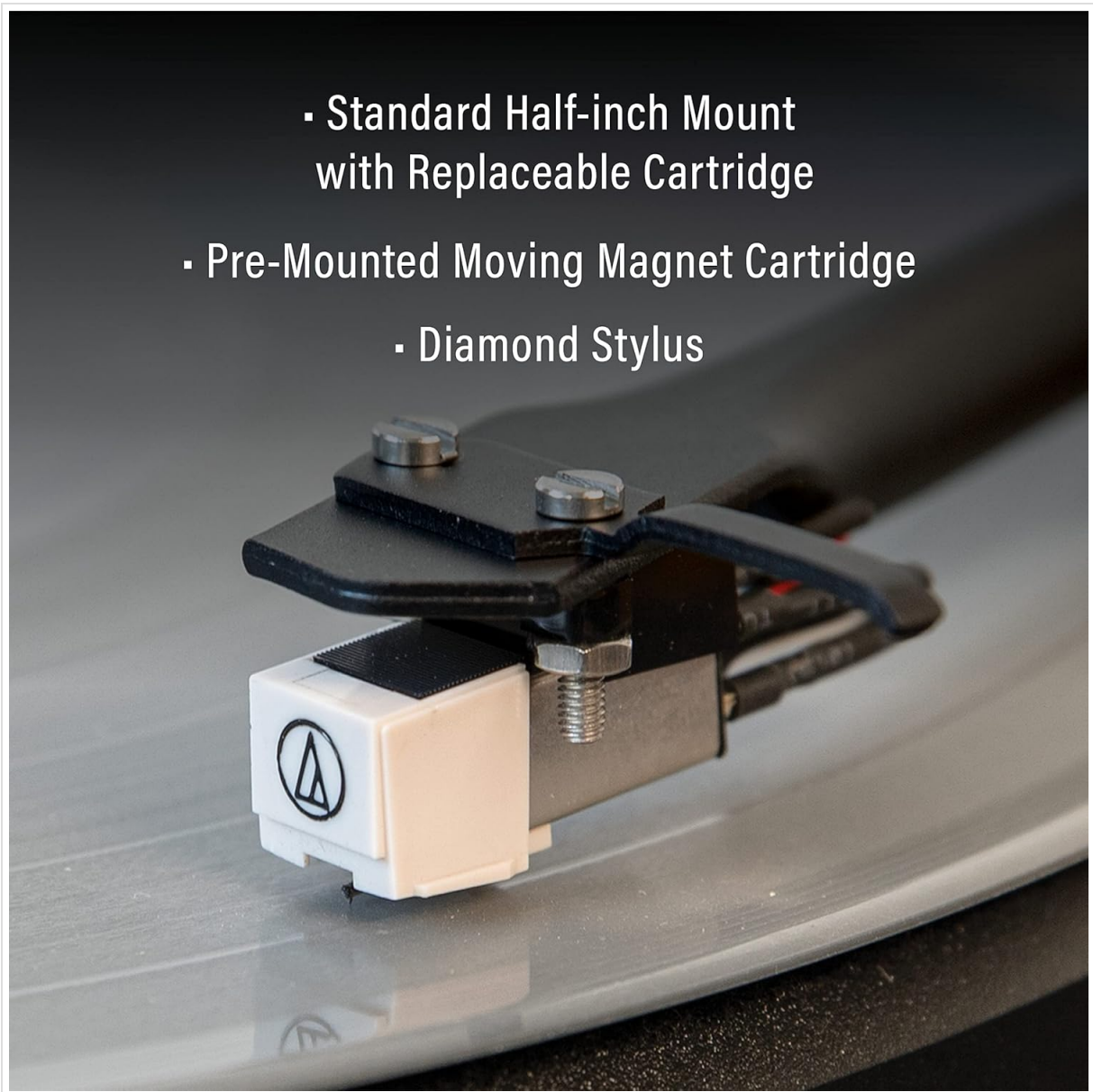
Image: A close-up shot of the pre-mounted Audio-Technica moving magnet cartridge, emphasizing its standard half-inch mount and diamond stylus for accurate sound reproduction.