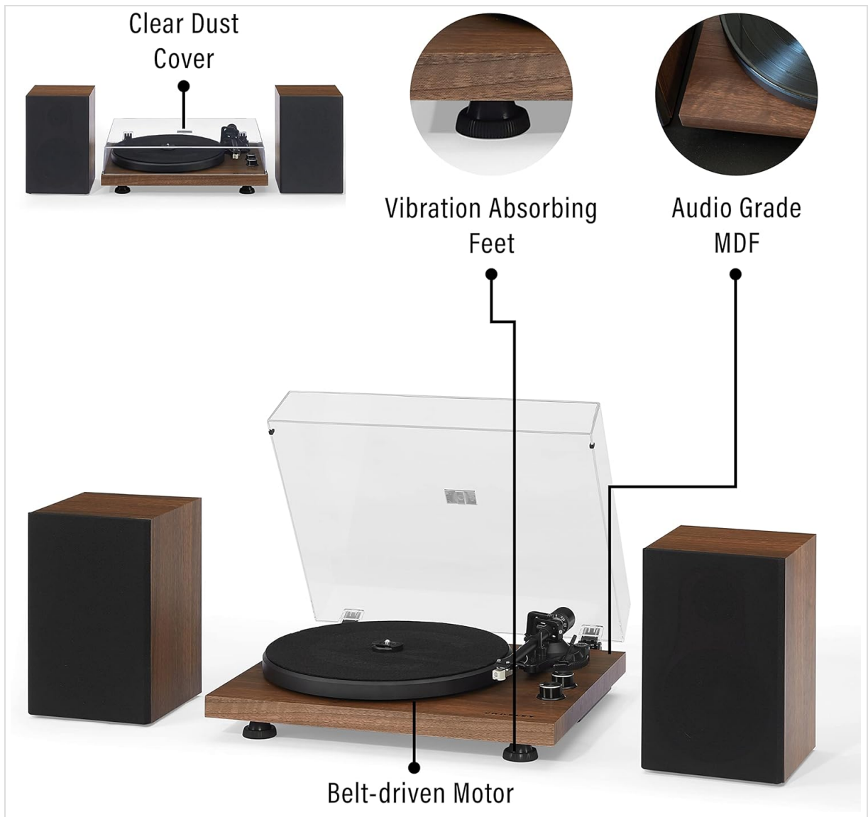
Image: An annotated diagram illustrating key structural features: the clear dust cover, vibration-absorbing feet, audio-grade MDF plinth, and the belt-driven motor system.