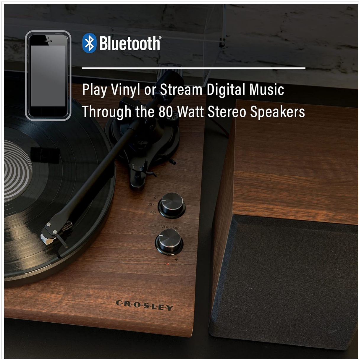
Image: A smartphone with the Bluetooth logo displayed, positioned near the Crosley C62C turntable, illustrating the wireless audio streaming capability.