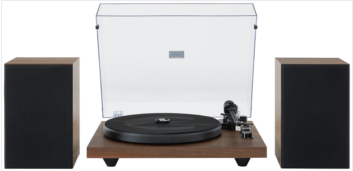
Image: The Crosley C62C turntable unit positioned between its two accompanying bookshelf speakers, showcasing the complete system.

The Crosley C62C is a two-speed belt-drive turntable system designed for high-fidelity audio playback. It features an adjustable tonearm, a pre-mounted Audio-Technica moving magnet cartridge, and comes with matching bookshelf speakers.