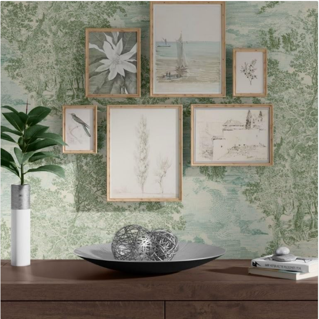
Figure 8: Wallpaper in a Bedroom Setting