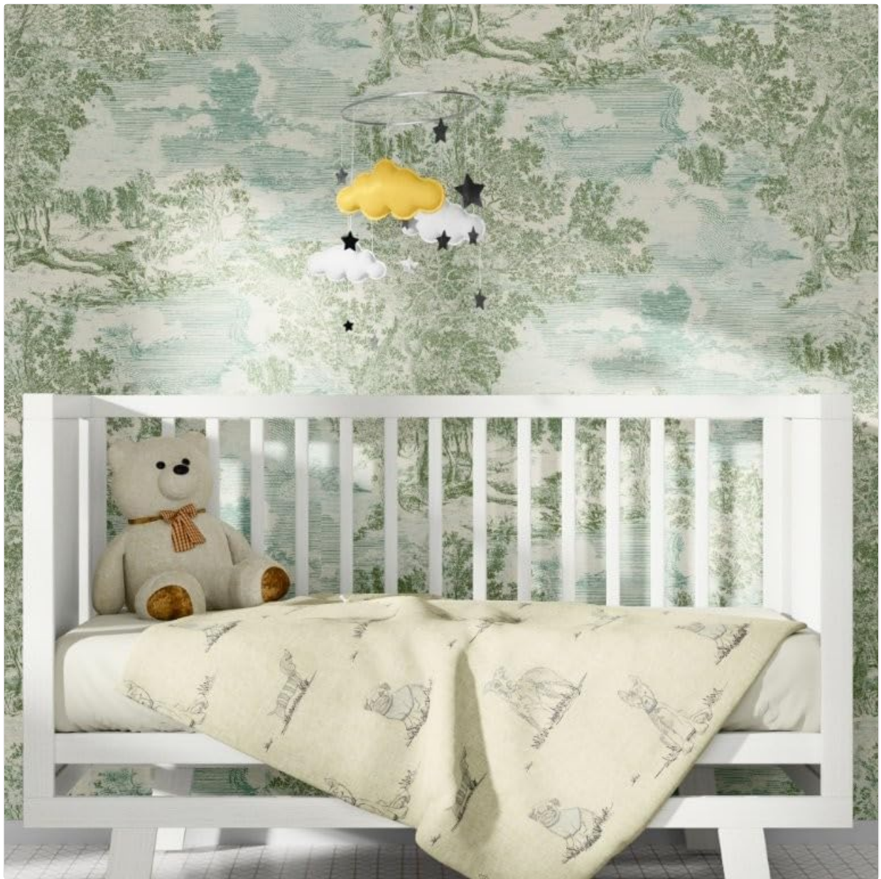
Figure 5: Wallpaper in a Nursery Setting