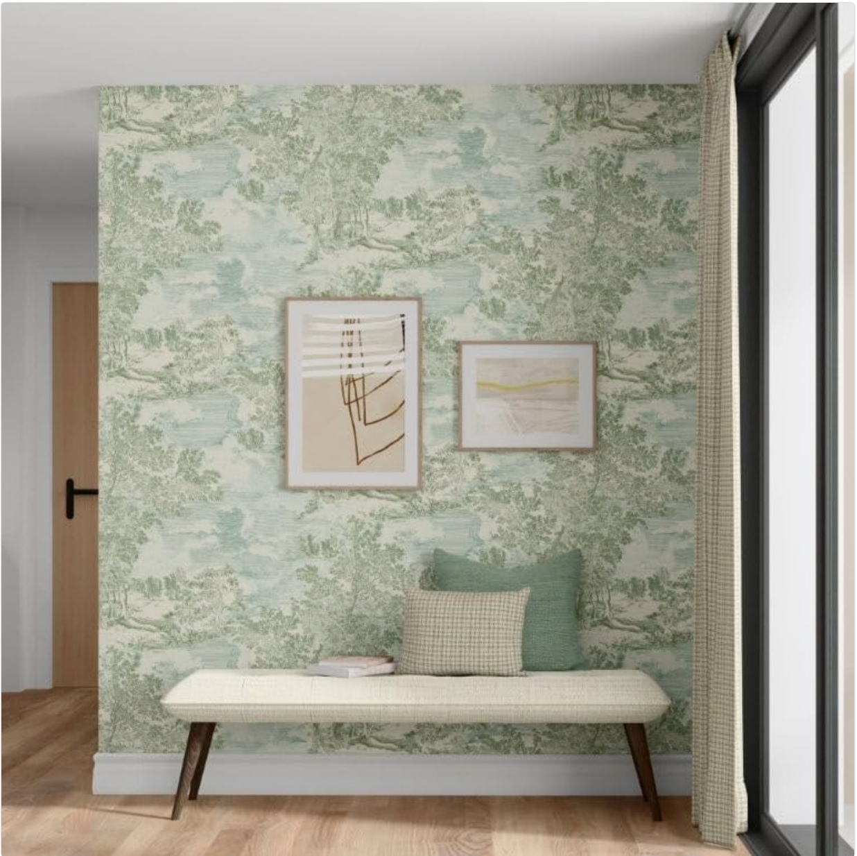
Figure 7: Wallpaper in an Entryway Setting