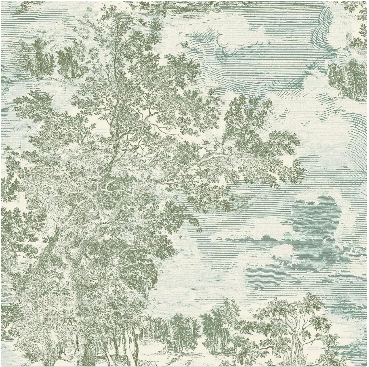
Figure 4: Serene Scenes Collection, Willow Pattern Detail