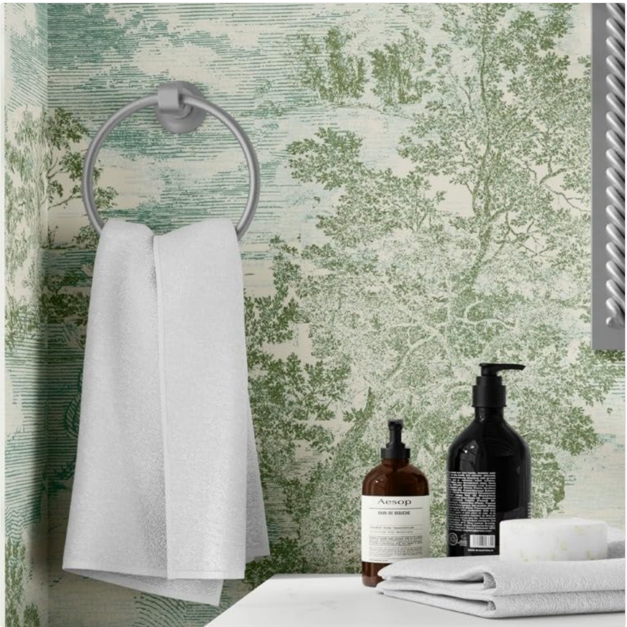
Figure 6: Wallpaper in a Bathroom Setting