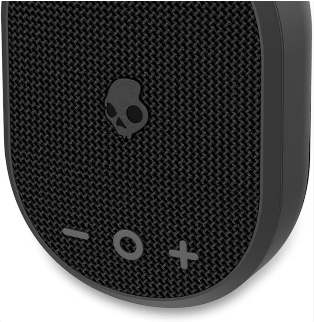
Image: The Skullcandy Kilo Wireless Bluetooth Speaker in black, showcasing its compact design.

Your browser does not support the video tag.