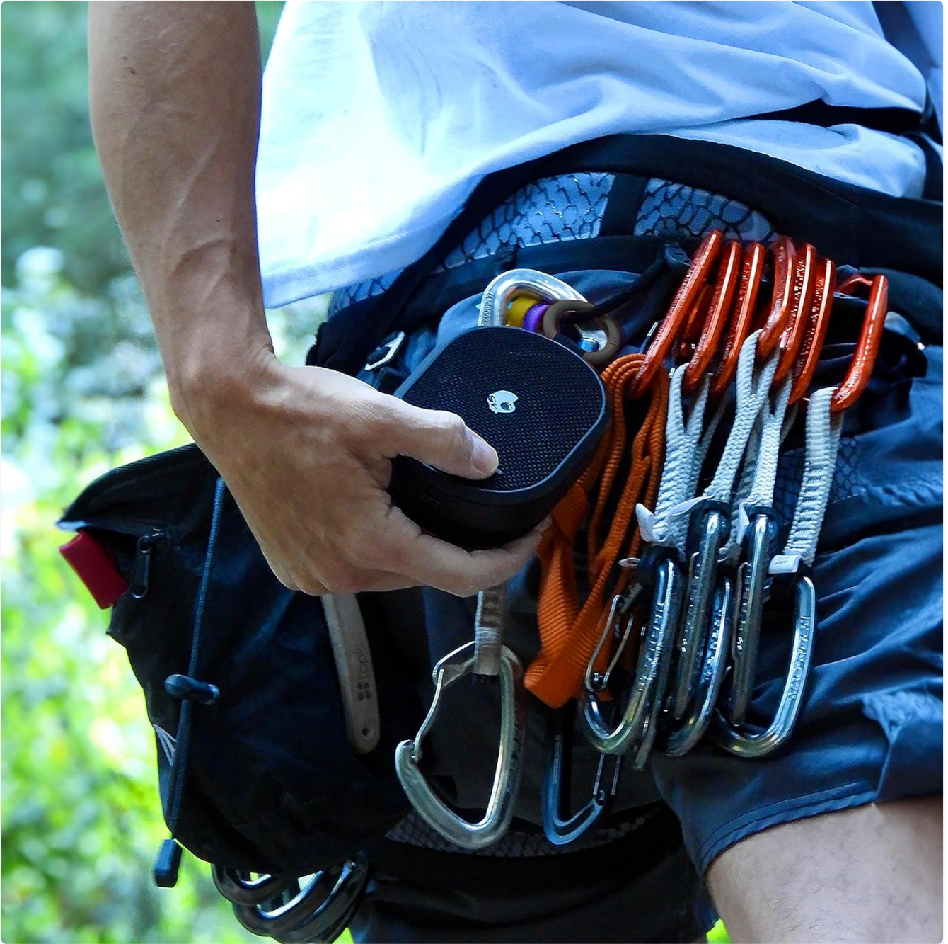
Image: The Skullcandy Kilo speaker clipped to a person's outdoor climbing gear, demonstrating its integrated carabiner and portability.

Your browser does not support the video tag.