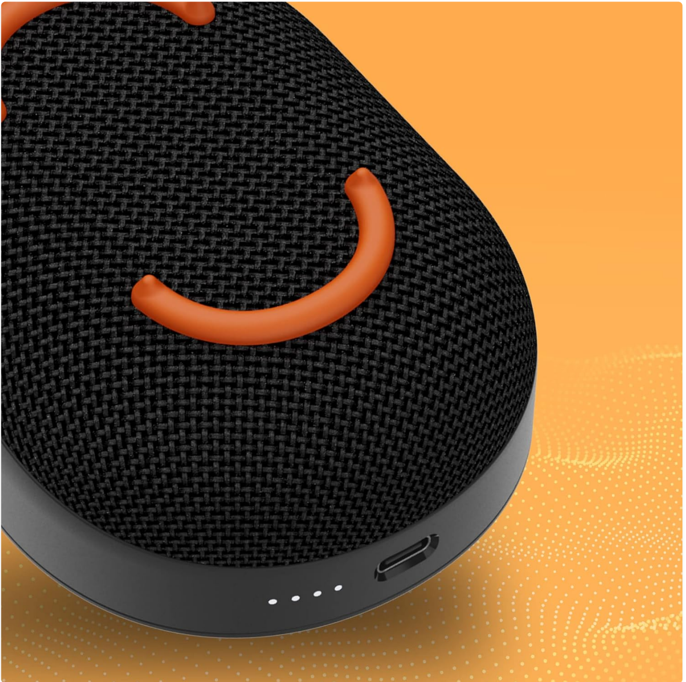
Image: A close-up view of the USB-C charging port and battery indicator lights located on the side of the speaker.