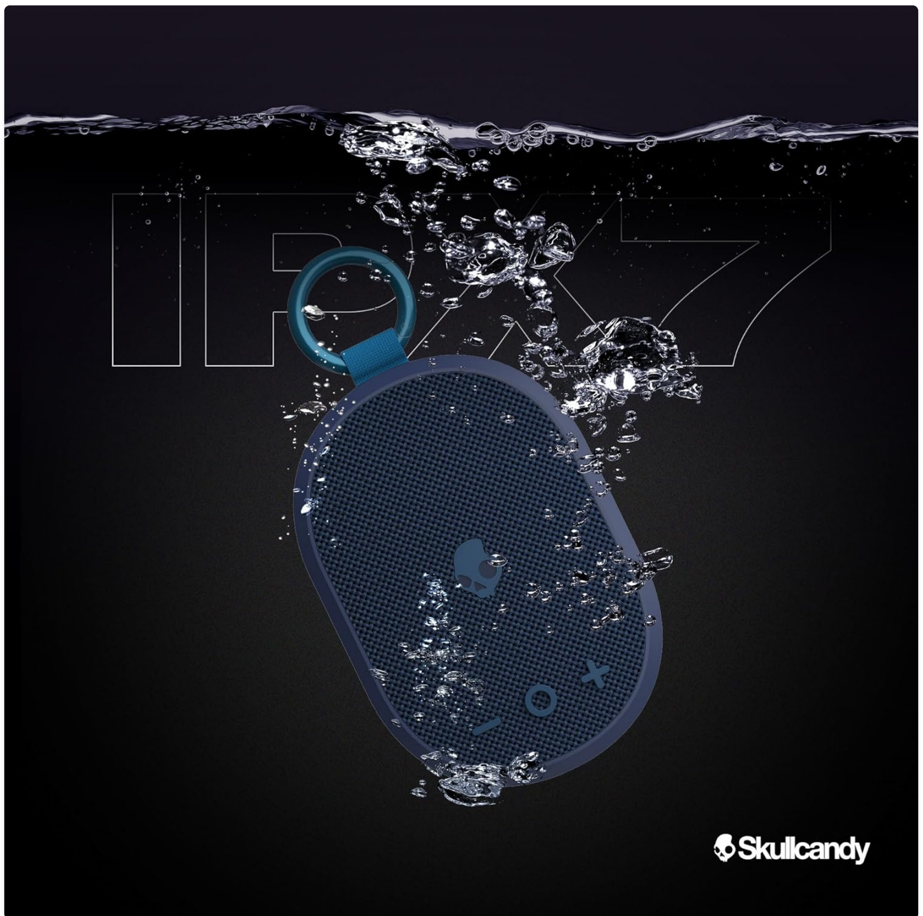
Image: The Skullcandy Kilo speaker partially submerged in water, demonstrating its IPX7 waterproof capability.