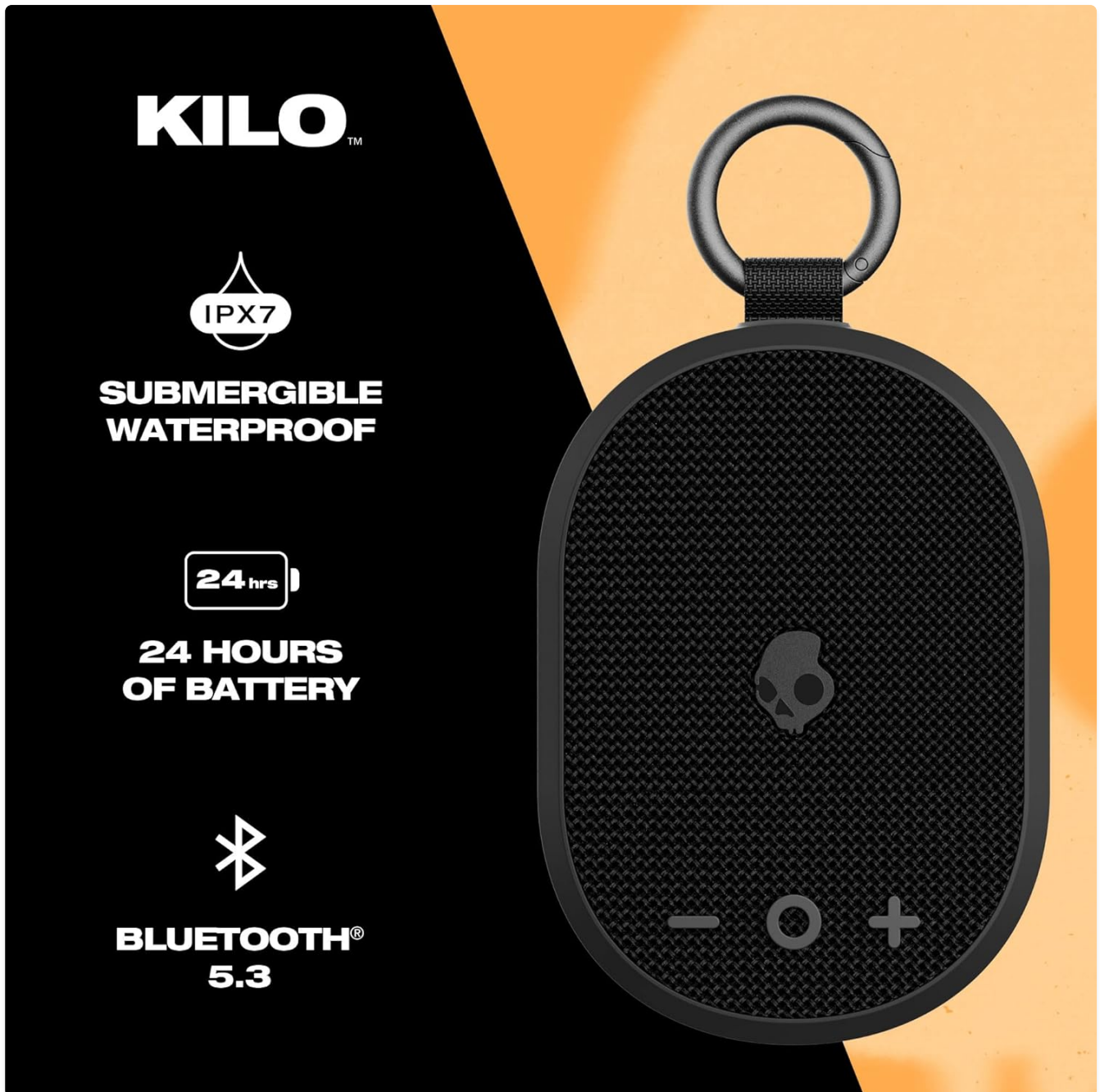
Image: Key features of the Skullcandy Kilo speaker, including IPX7 waterproofing, 24-hour battery, and Bluetooth 5.3 connectivity.