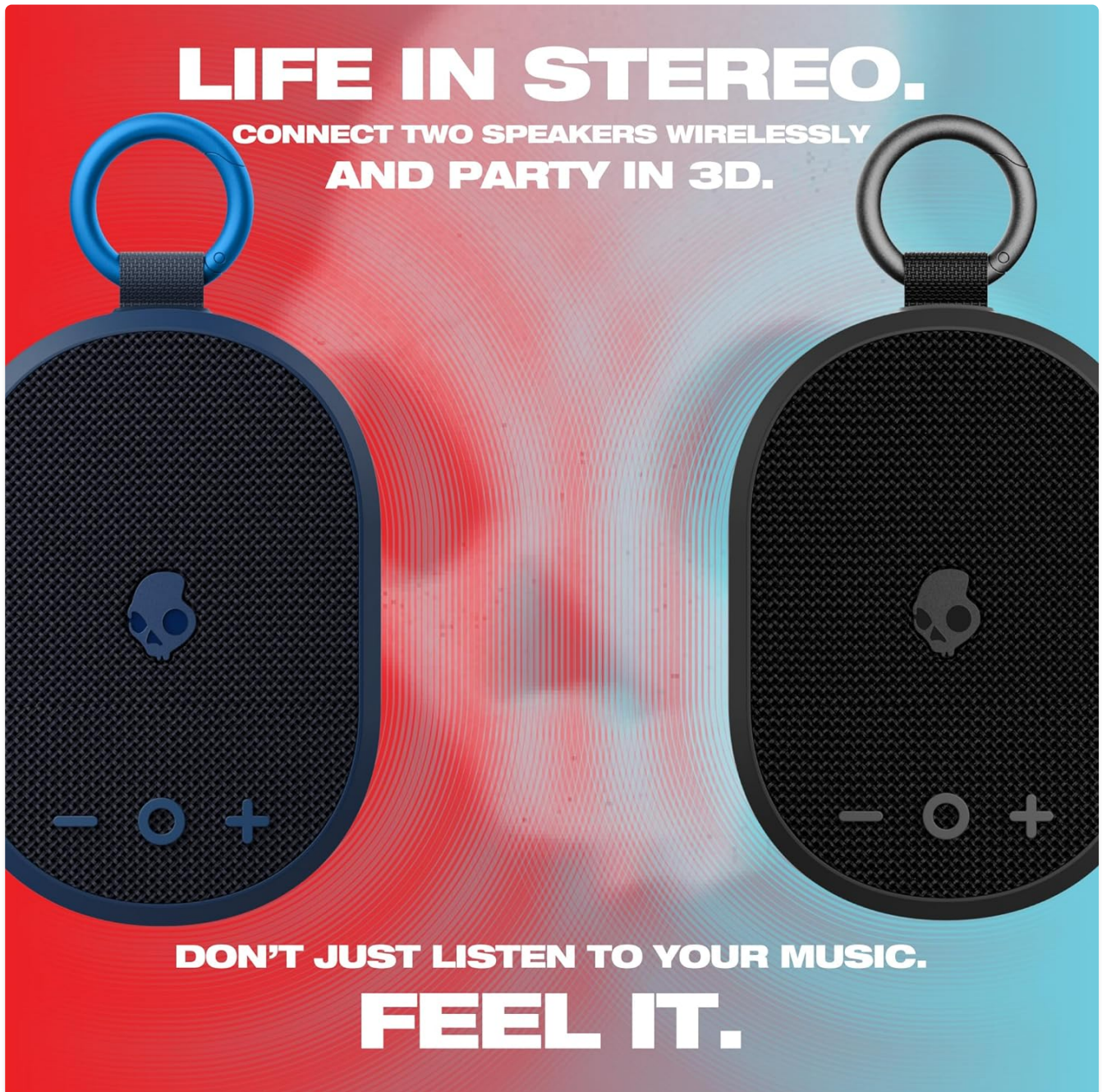
Image: Two Skullcandy Kilo speakers shown side-by-side, illustrating the True Wireless Stereo pairing feature.