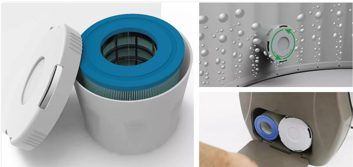
Image: Detailed view of the spa's filtration system, showing the filter cartridge inside its housing and how it integrates with the pump unit.

Image: Illustration of the spa's EcoPlus construction layers, including Anti-UV Coating, Imitation Leather, Heat Insulation Foam, and Heavy Duty Laminated Reinforced PVC layer.