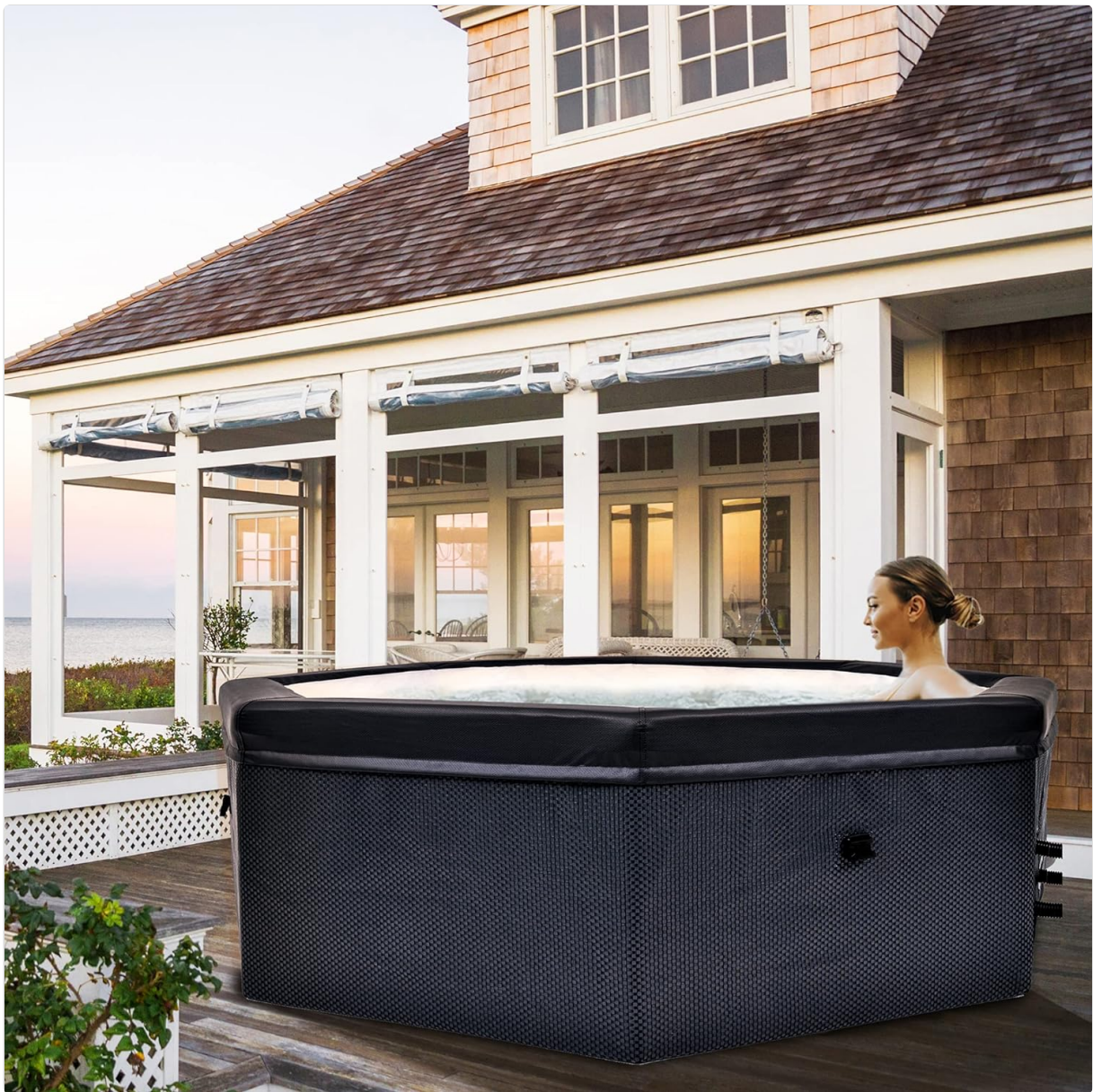
Image: A woman relaxing in the Pool Central hot tub spa on an outdoor deck, illustrating the spa in use after setup.