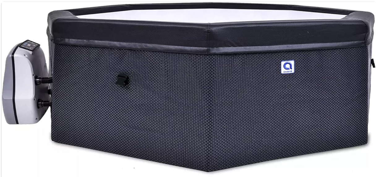
Image: The Pool Central 6-Person Rigid Foam Wall Portable Hot Tub Spa, showing the octagonal spa unit with the external pump and control unit connected.