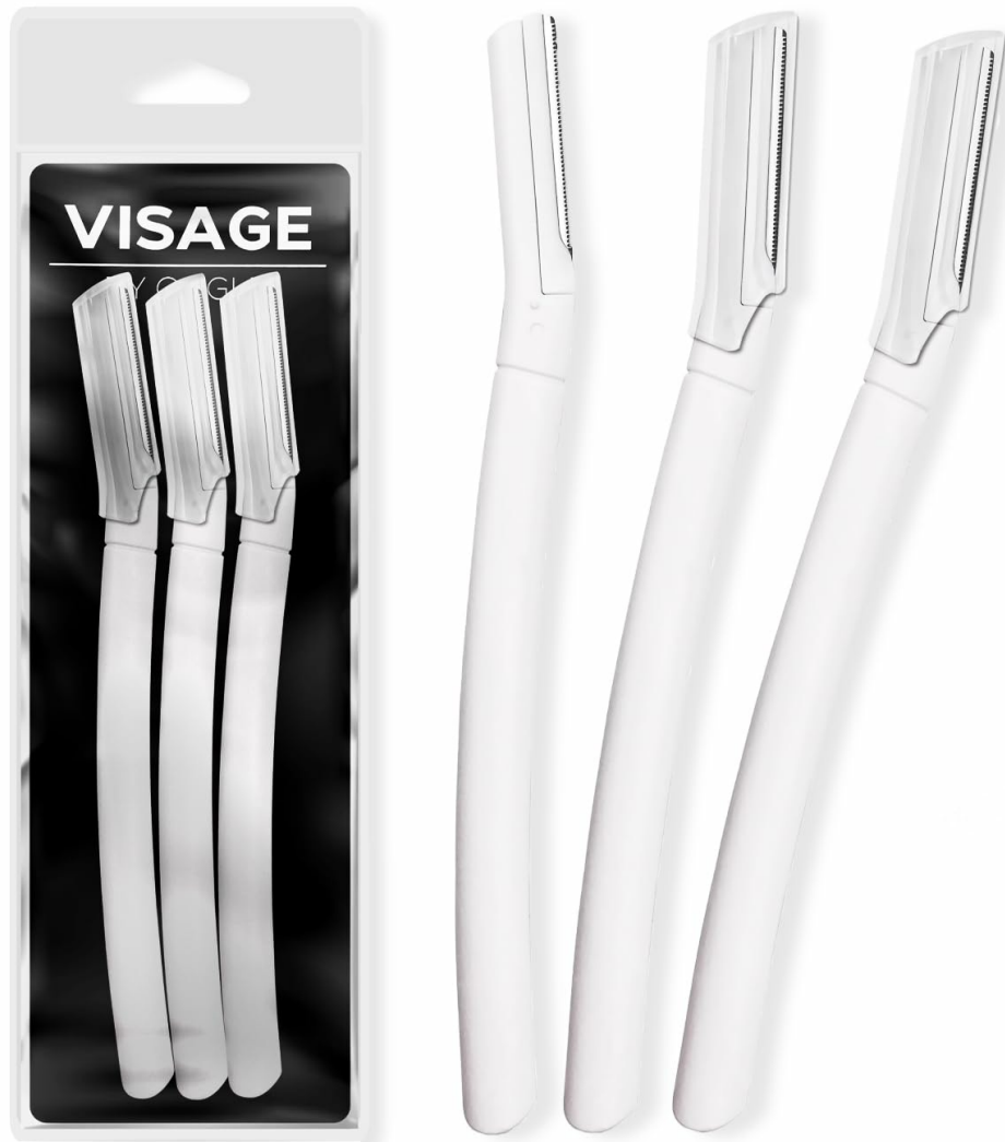
Image: Visage Precision Facial Razors in packaging and individually.