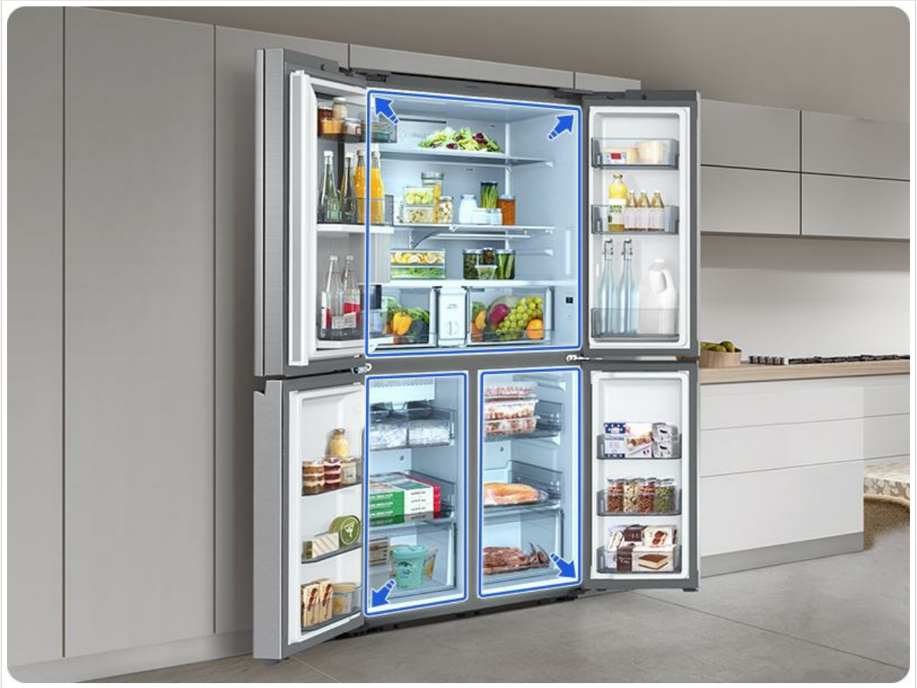
Image: Interior view of the refrigerator compartments, showing various food items.

Carefully remove all packaging materials. Ensure no parts are missing or damaged. Place the refrigerator on a flat, stable surface, away from direct sunlight and heat sources. Allow adequate space around the appliance for proper ventilation (at least 5 cm on sides and back, 10 cm on top).