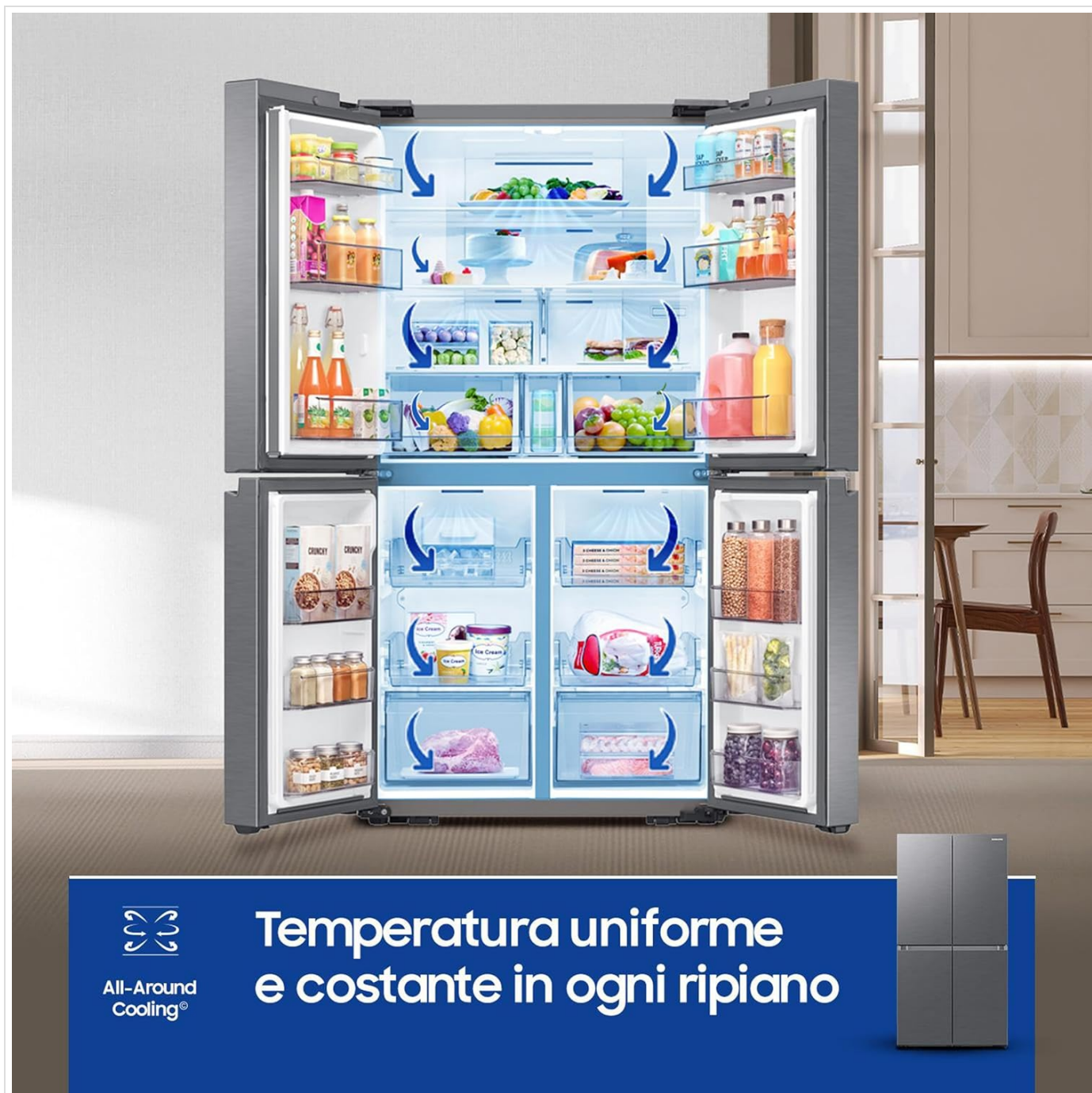
Image: Diagram illustrating the All Around Cooling system, showing cold air circulating evenly throughout the refrigerator compartments.