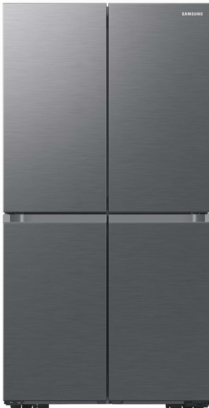
Image: Front view of the Samsung RF59C70TES9/ES Four-Door AI Refrigerator in Metal Inox finish.