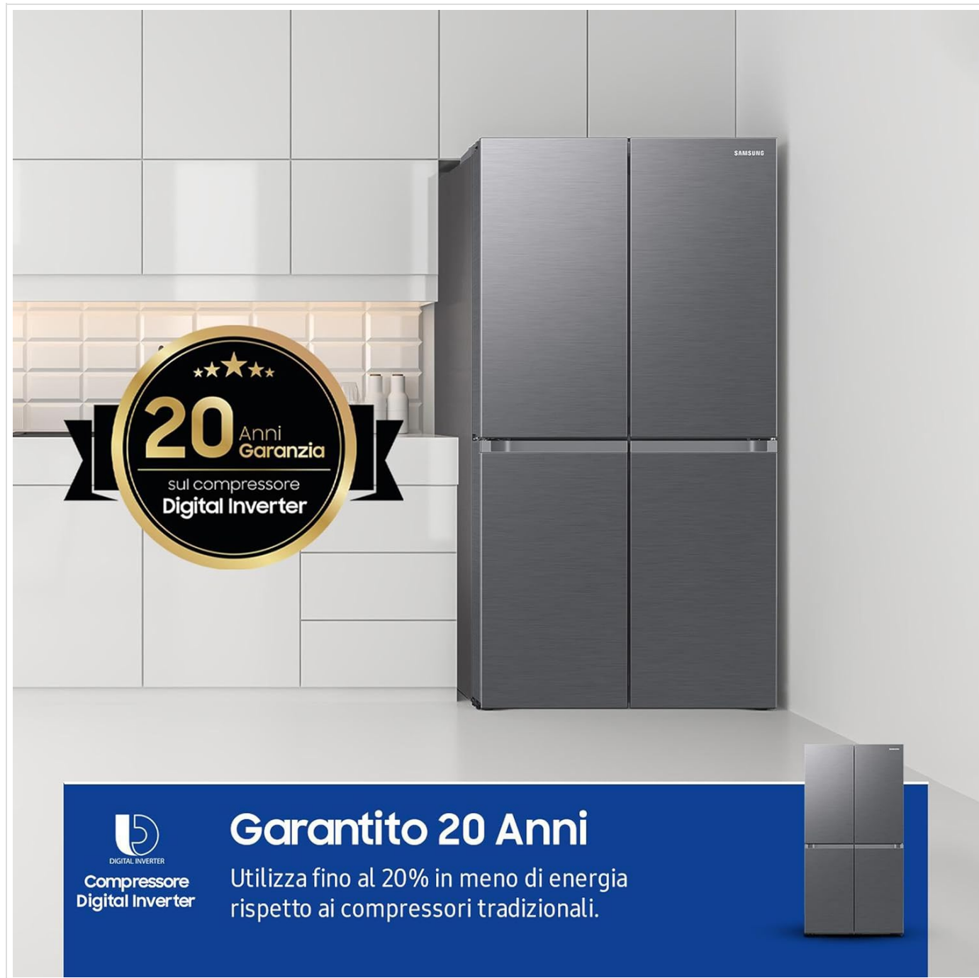
Image: A badge indicating a 20-year warranty on the Digital Inverter Compressor.

Your refrigerator is equipped with a Digital Inverter Compressor, designed for quiet operation, energy efficiency, and long-lasting performance. This compressor comes with a 20-year warranty, ensuring reliability.