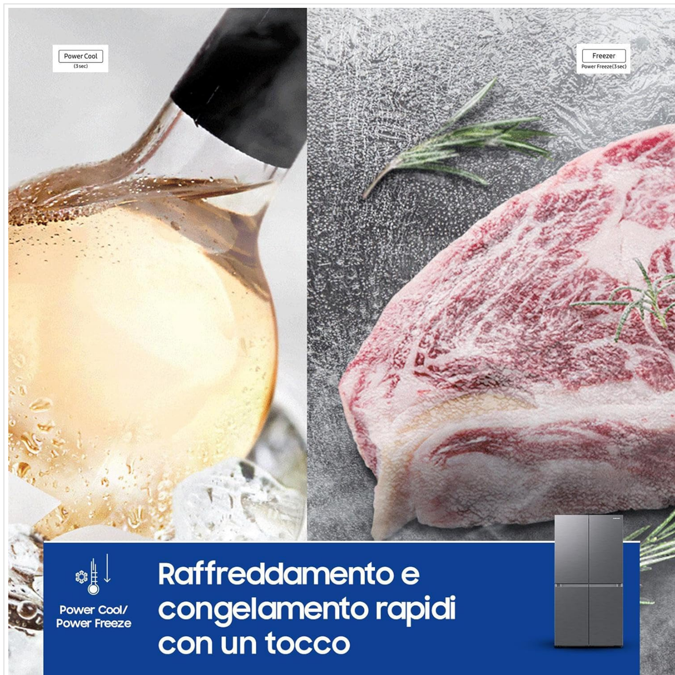
Image: Visual representation of Power Cool (chilling a drink) and Power Freeze (freezing meat) functions.