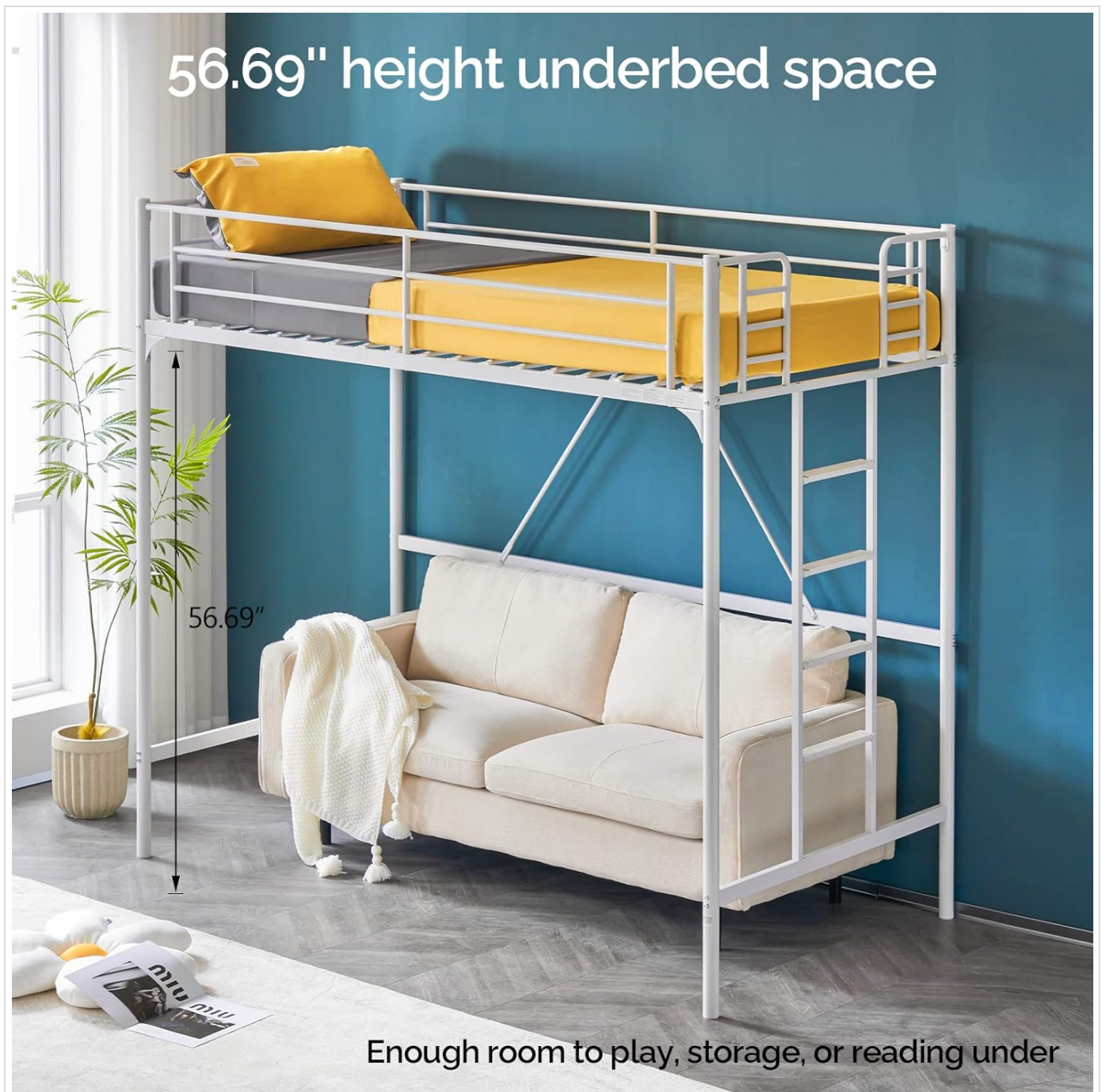
Figure 1.2: Guardrail Height. Ensure your mattress is positioned correctly relative to the guardrail for safety.