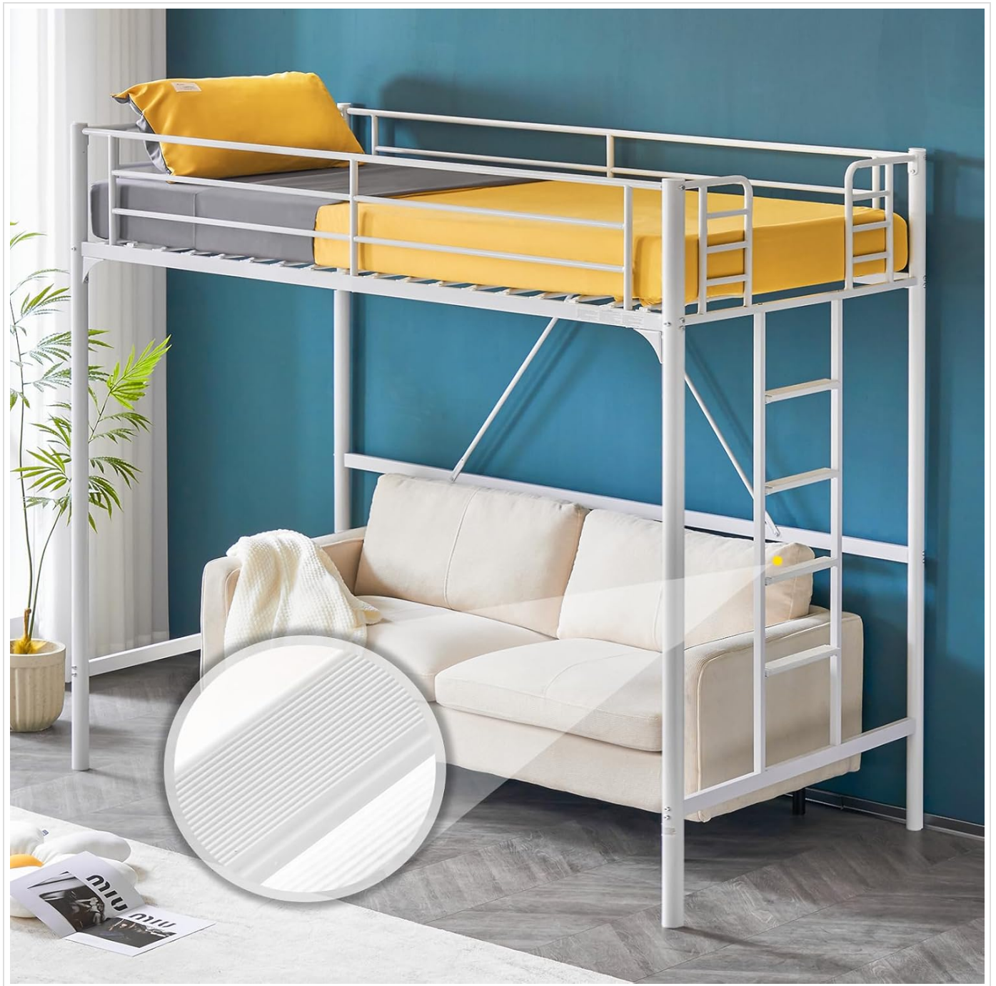
Figure 2.1: VINGLI Twin Loft Bed. Demonstrates the generous under-bed space for various uses.