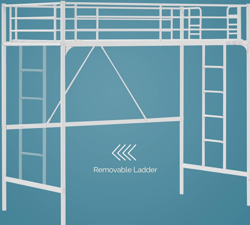
Figure 2.2: Removable Ladder. The ladder's flexible placement allows for customization to your room's design.