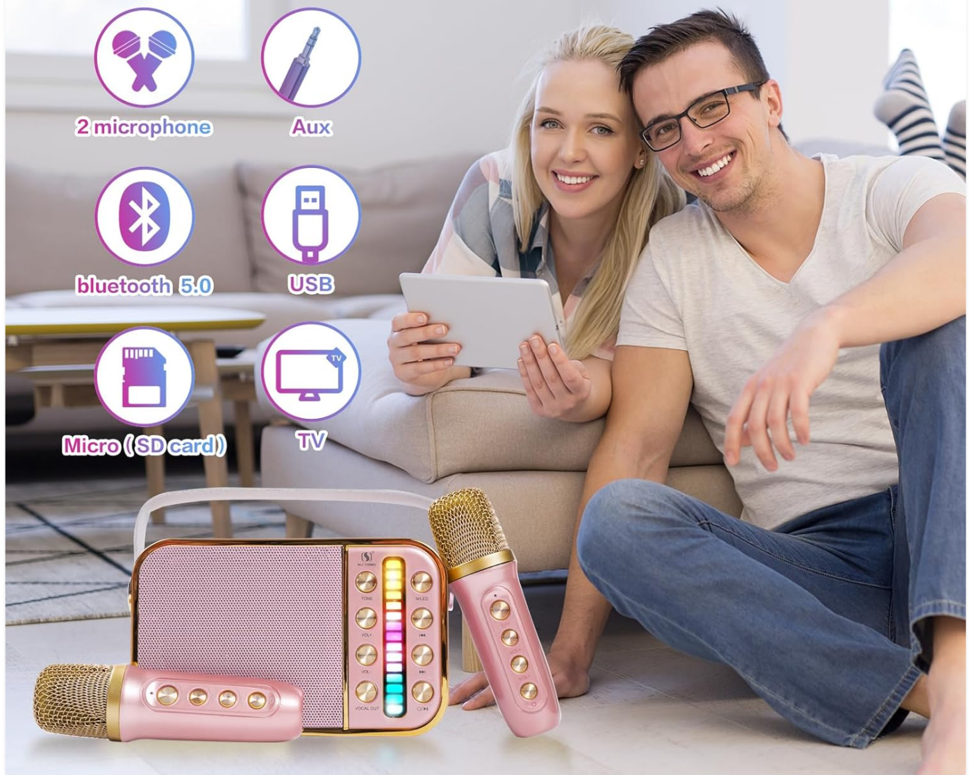
Image: Illustration of the multiple connectivity options available for the karaoke machine.