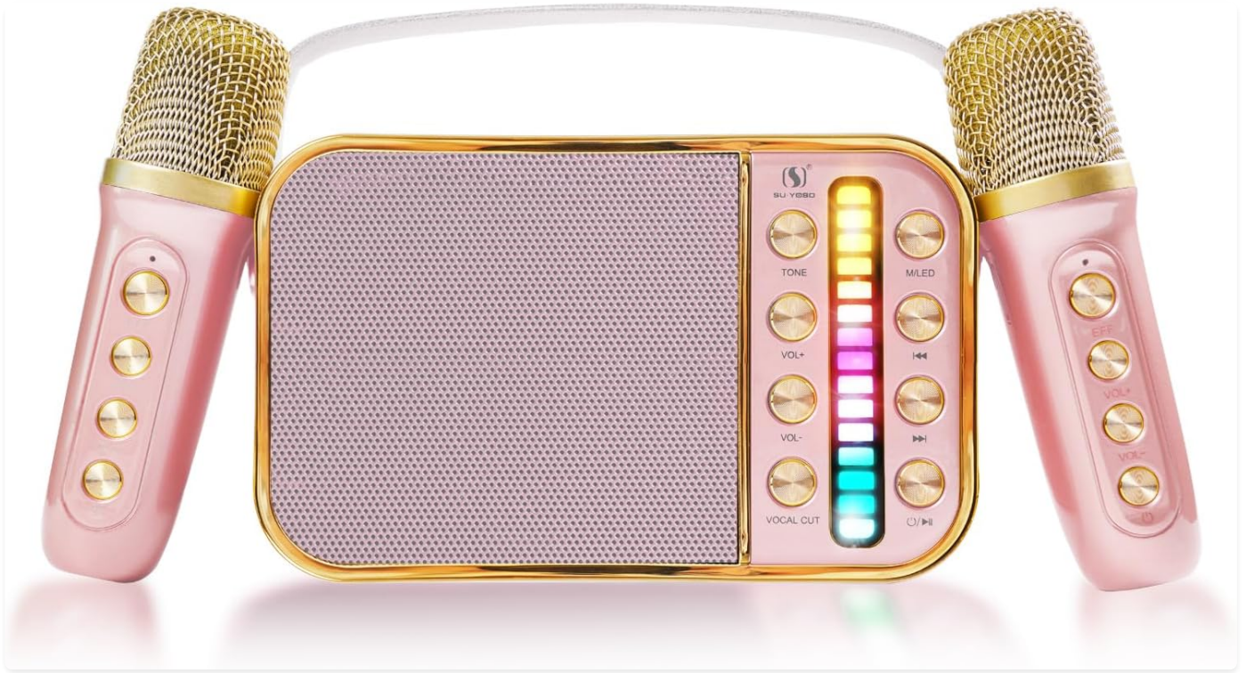
Image: The Aresrora Mini Karaoke Machine and its two wireless microphones.