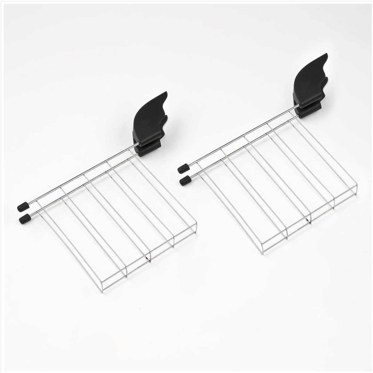
Figure 4: Two stainless steel sandwich tongs, designed to hold and toast sandwiches or smaller bread items securely within the toaster slots.