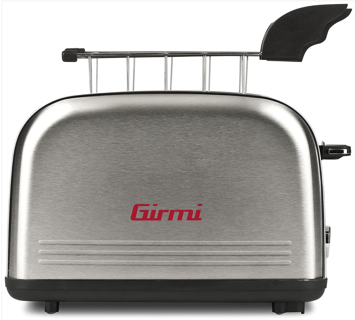
Figure 1: Front view of the Girmi TP57 Toaster, showcasing its brushed stainless steel finish and the Girmi brand logo.

Familiarize yourself with the components of your Girmi TP57 Toaster: