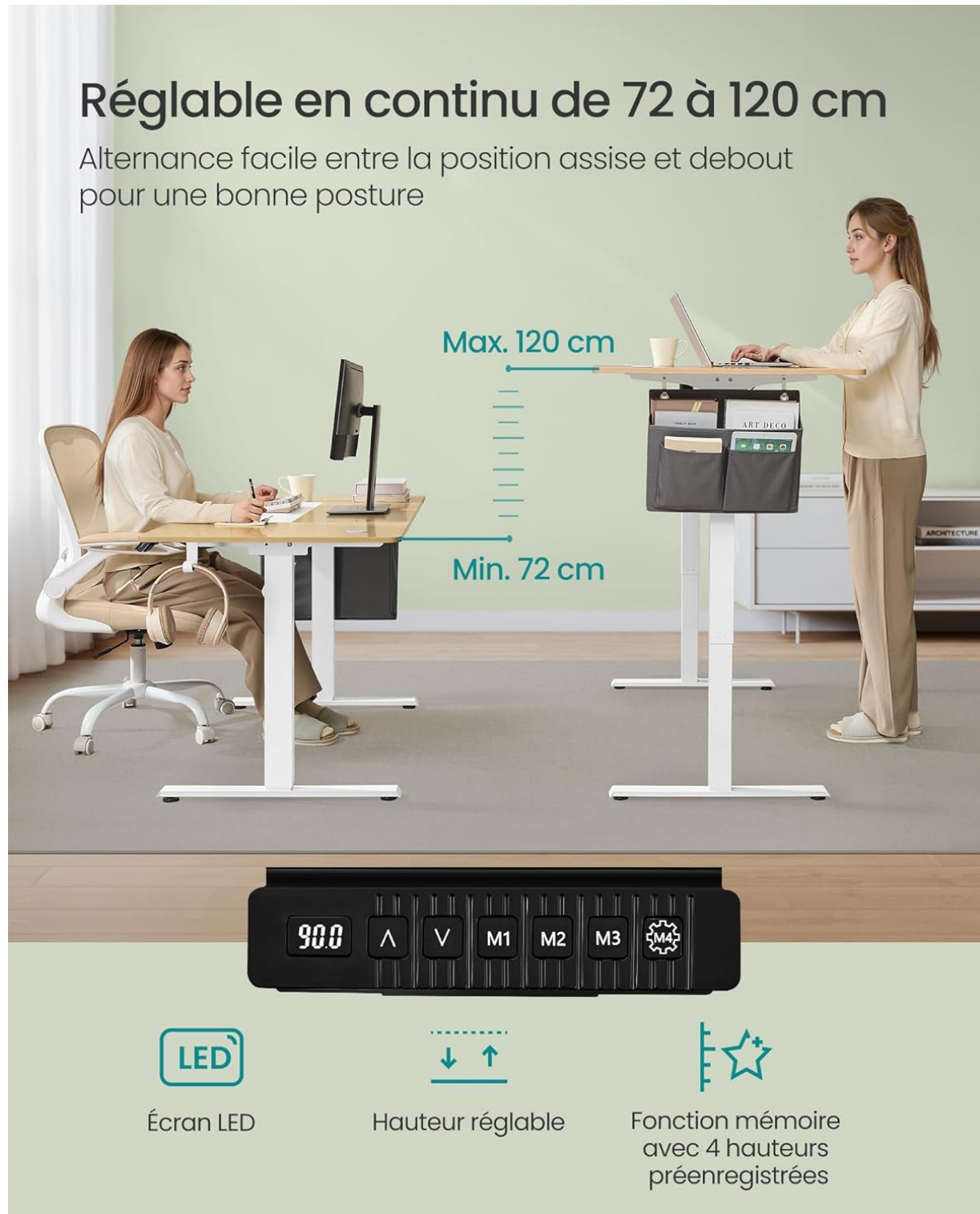
Image Description: A close-up of the desk's control panel, showing an LED display, up and down arrow buttons, and four memory preset buttons (M1, M2, M3, and a gear icon for a fourth preset).