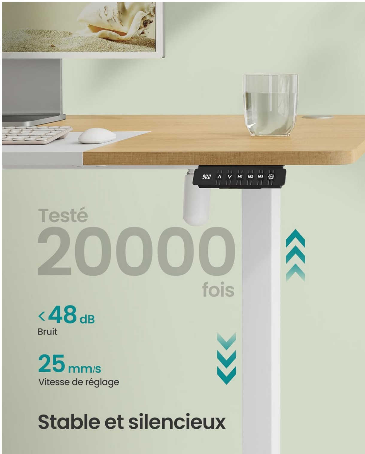
Image Description: An image highlighting the desk's quiet operation, stating a noise level of less than 48 dB and an adjustment speed of 25 mm/s. The control panel is visible.