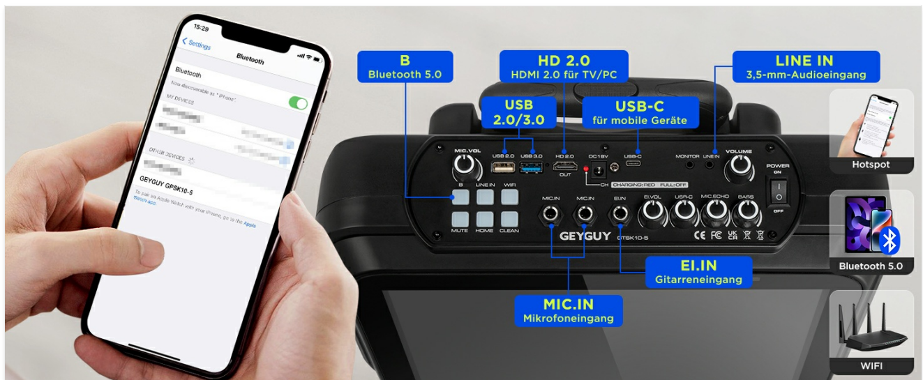
Image 6.2: Illustration showing various devices that can be connected to the GEYGUY GTSK10-5, including smartphones, tablets, laptops via USB-C, and external displays like TVs or projectors via HDMI.