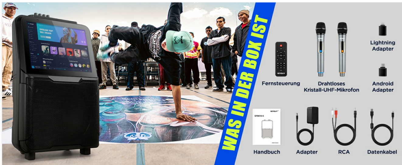
Image 3.1: Illustration of the GEYGUY GTSK10-5 karaoke machine and its included accessories, such as microphones, remote control, and various cables.