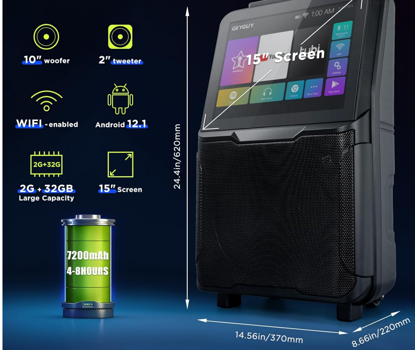
Image 4.2: Diagram illustrating the dimensions of the GEYGUY GTSK10-5, highlighting its 10-inch woofer, 2-inch tweeter, 15-inch screen, WiFi capability, Android 12.1 system, 2G+32G memory, and 7200mAh battery.