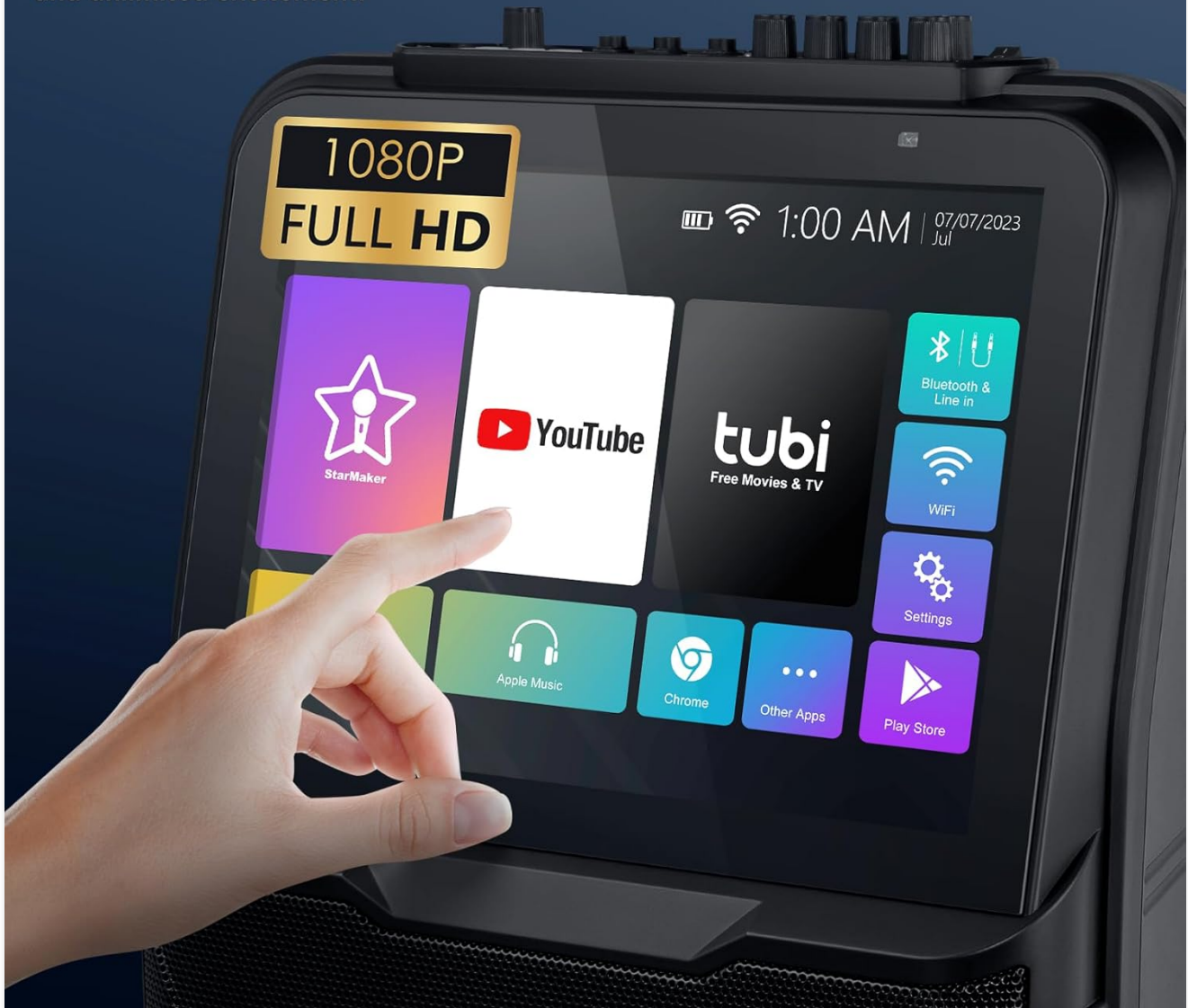
Image 4.3: Close-up of the GEYGUY GTSK10-5's intelligent LED touchscreen, showing various app icons like YouTube, Spotify, and settings, with a hand interacting with the display.

Support playing 1080P HD video , adjustable brightness, quick response, and unlimited excitement.