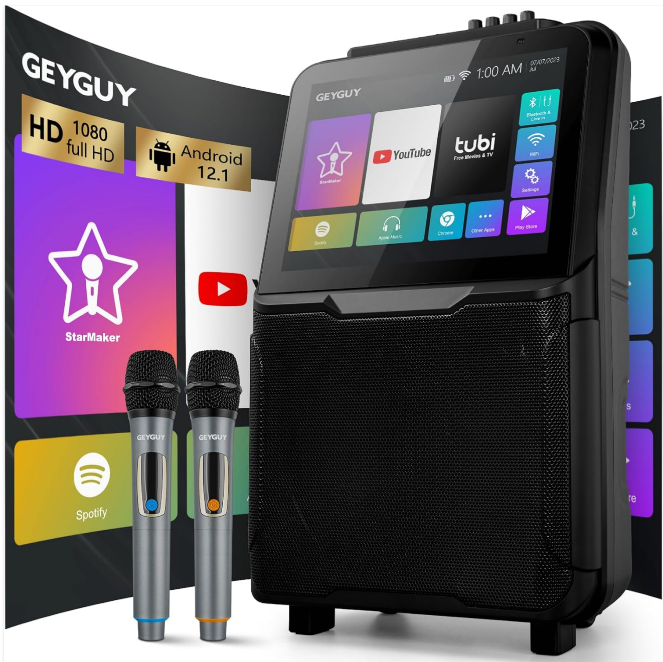
Image 4.1: Front view of the GEYGUY GTSK10-5 karaoke machine, showcasing its large touchscreen display and speaker grille, along with two wireless microphones.