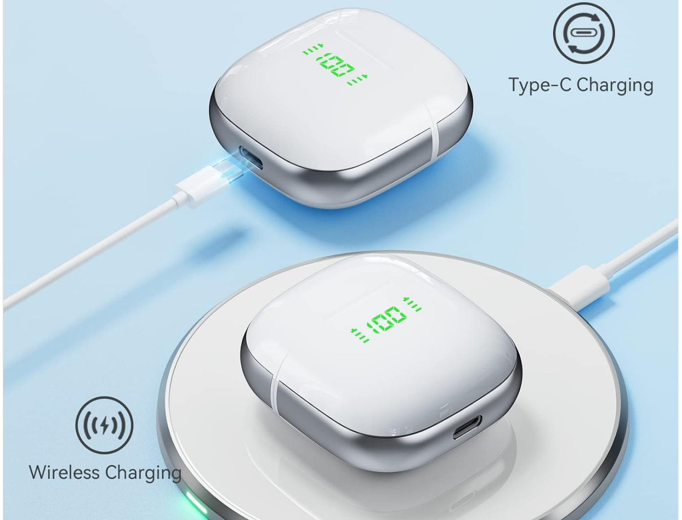
Image: The PocBuds K6 charging case being charged via a USB-C cable and wirelessly on a charging pad. This illustrates the two available charging methods.

Two charging methods make your life more convenient