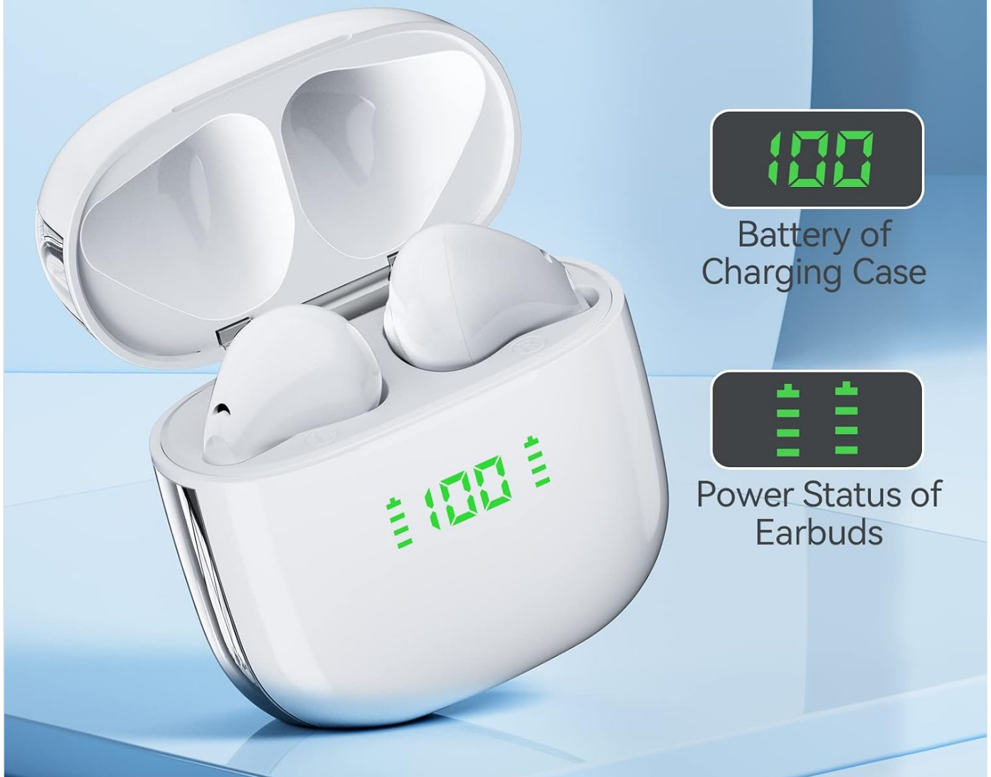
Image: PocBuds K6 Wireless Earbuds inside their charging case. This image shows the overall design of the earbuds and the charging case.

Show the battery level of the charging case and earbuds separately