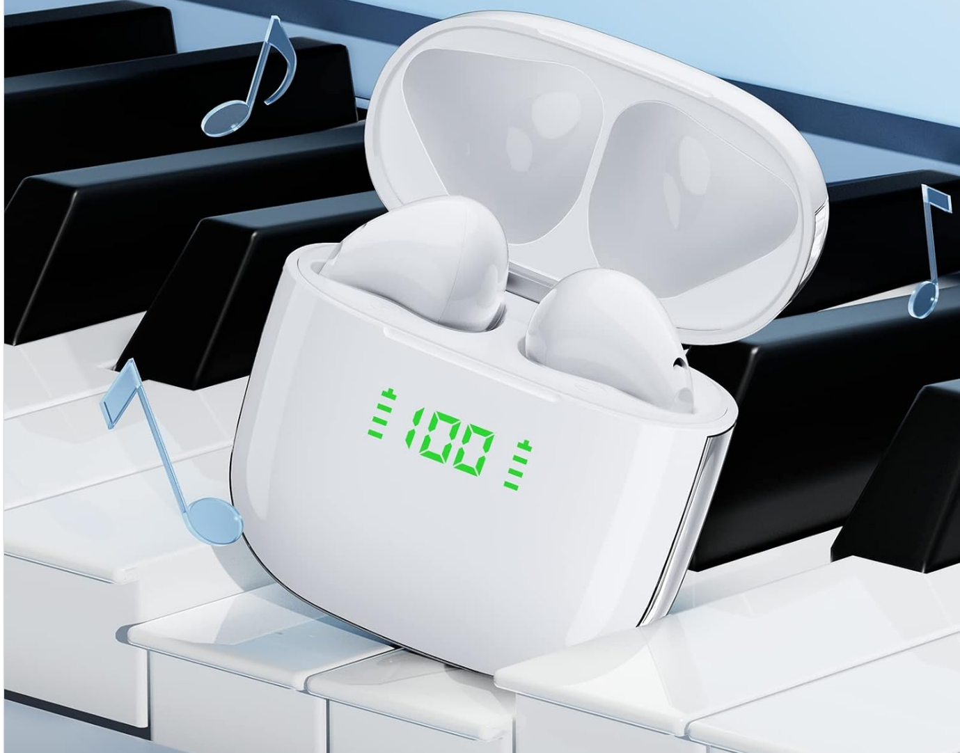
Image: The PocBuds K6 earbuds in their open charging case, set against a piano keyboard, highlighting the "Hi-Fi Stereo Sound" and "12mm speakers". This image illustrates a key audio feature.

The PocBuds K6 headphones are equipped with 12mm speakers, designed to deliver clear stereo sound.