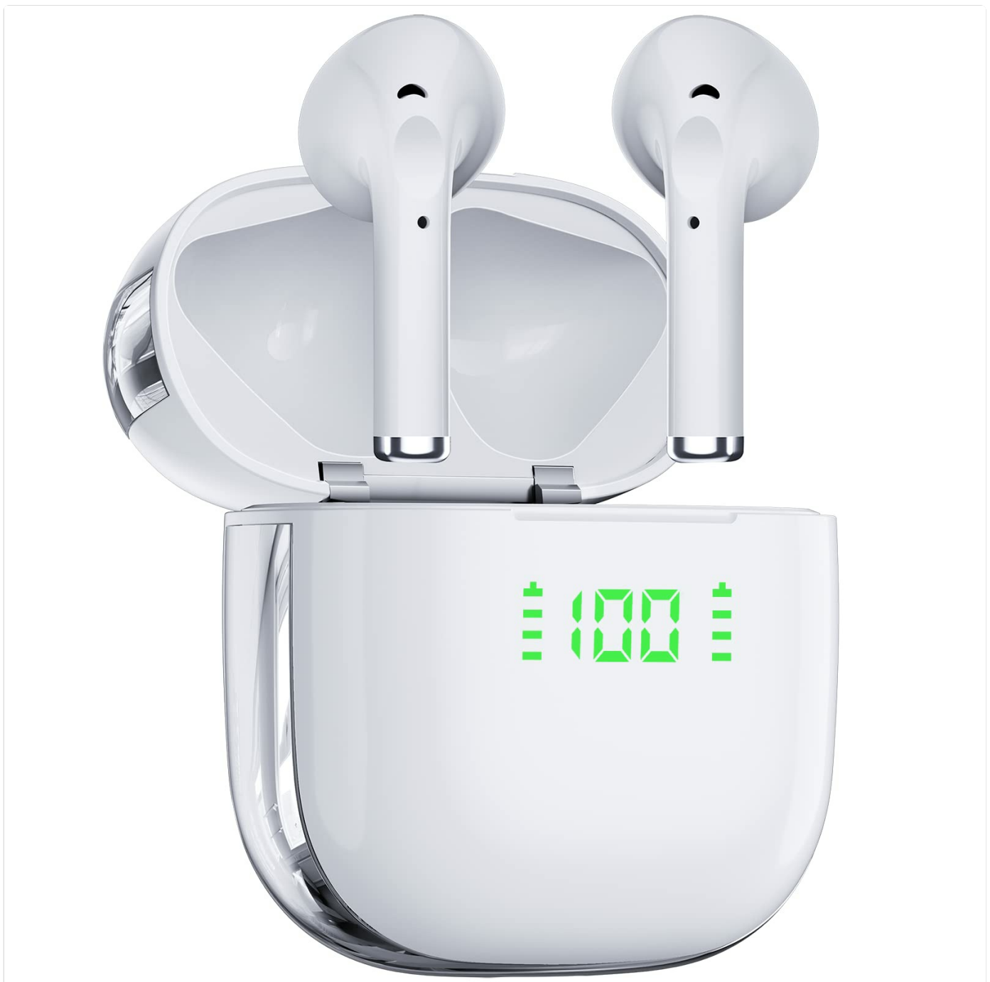
Image: The PocBuds K6 charging case with its lid open, showing the digital display indicating battery levels for the charging case and individual earbuds. The display shows "100" for the case and full bars for the earbuds.

The digital display on the charging case will show the battery percentage of the case and the charging status of each earbud. A full charge provides approximately 50 hours of total playtime with the charging case.