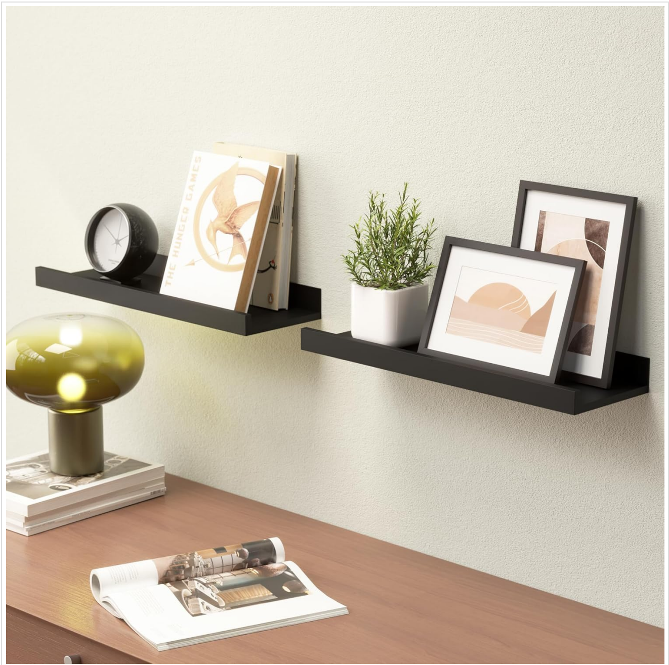
Image 3: Shelves in a Living Space. This image demonstrates the practical use of the floating shelves for displaying various decorative and functional items in a living room or office environment.