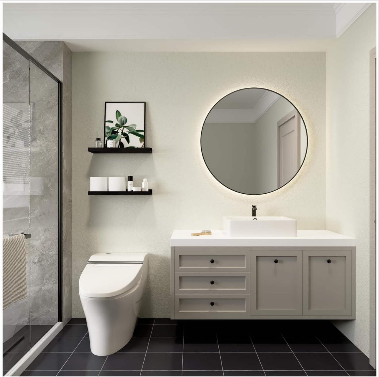
Image 4: Shelves in a Bathroom. This image illustrates the versatility of the shelves, showing them used for organizing and decorating a modern bathroom space.