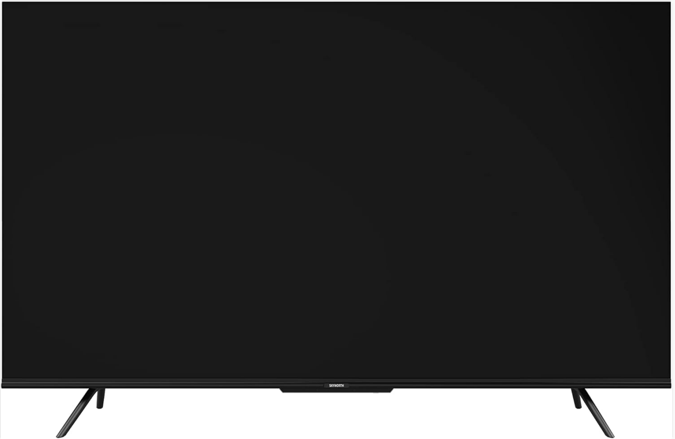
Image: Front view of the SKYWORTH 50SUE9350F Google Smart LED UHD 4K TV, showcasing its slim bezels and stand.