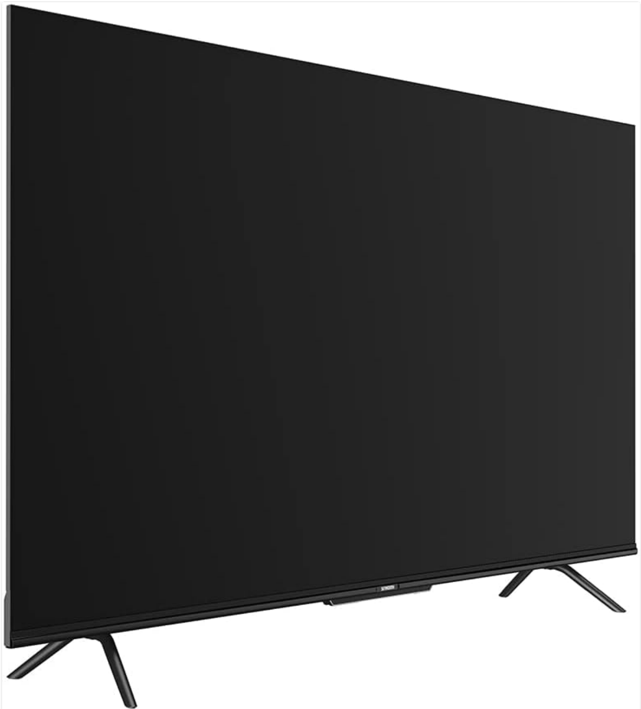
Image: Side view of the SKYWORTH 50SUE9350F TV, illustrating the attached stand and slim profile.