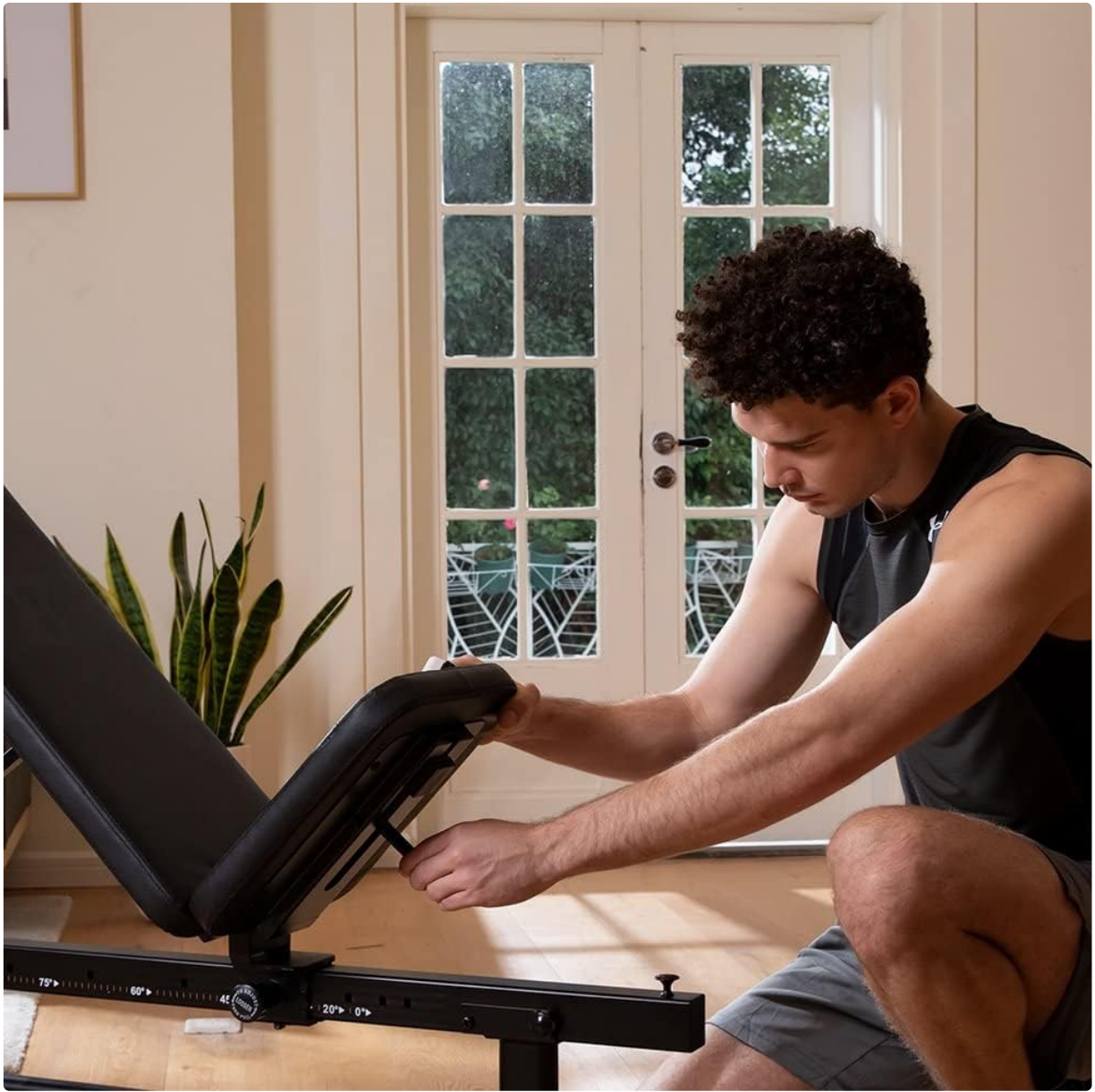
Figure 5.2: A user demonstrating the adjustment of the backrest to a desired incline.