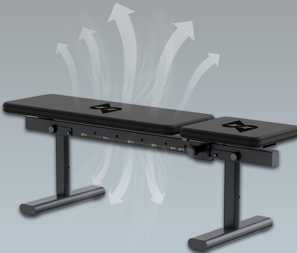
Figure 5.4: Detail of the high-grade breathable leather upholstery, ensuring comfort during workouts.