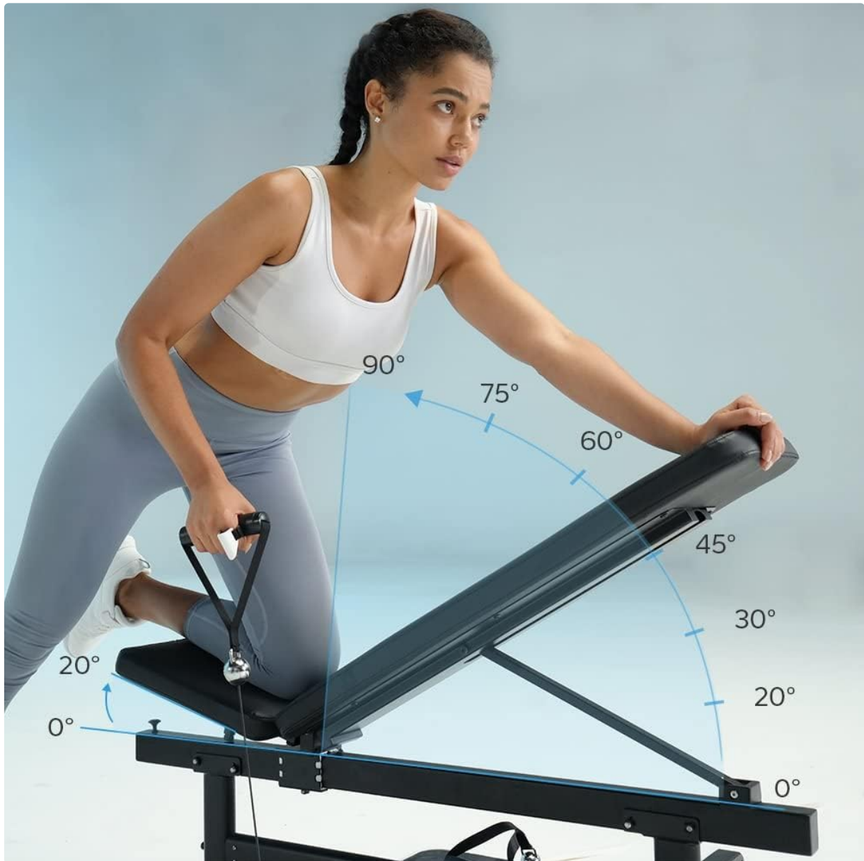
Figure 5.1: Visual representation of the adjustable backrest and seat angles, showing a user in an inclined position.