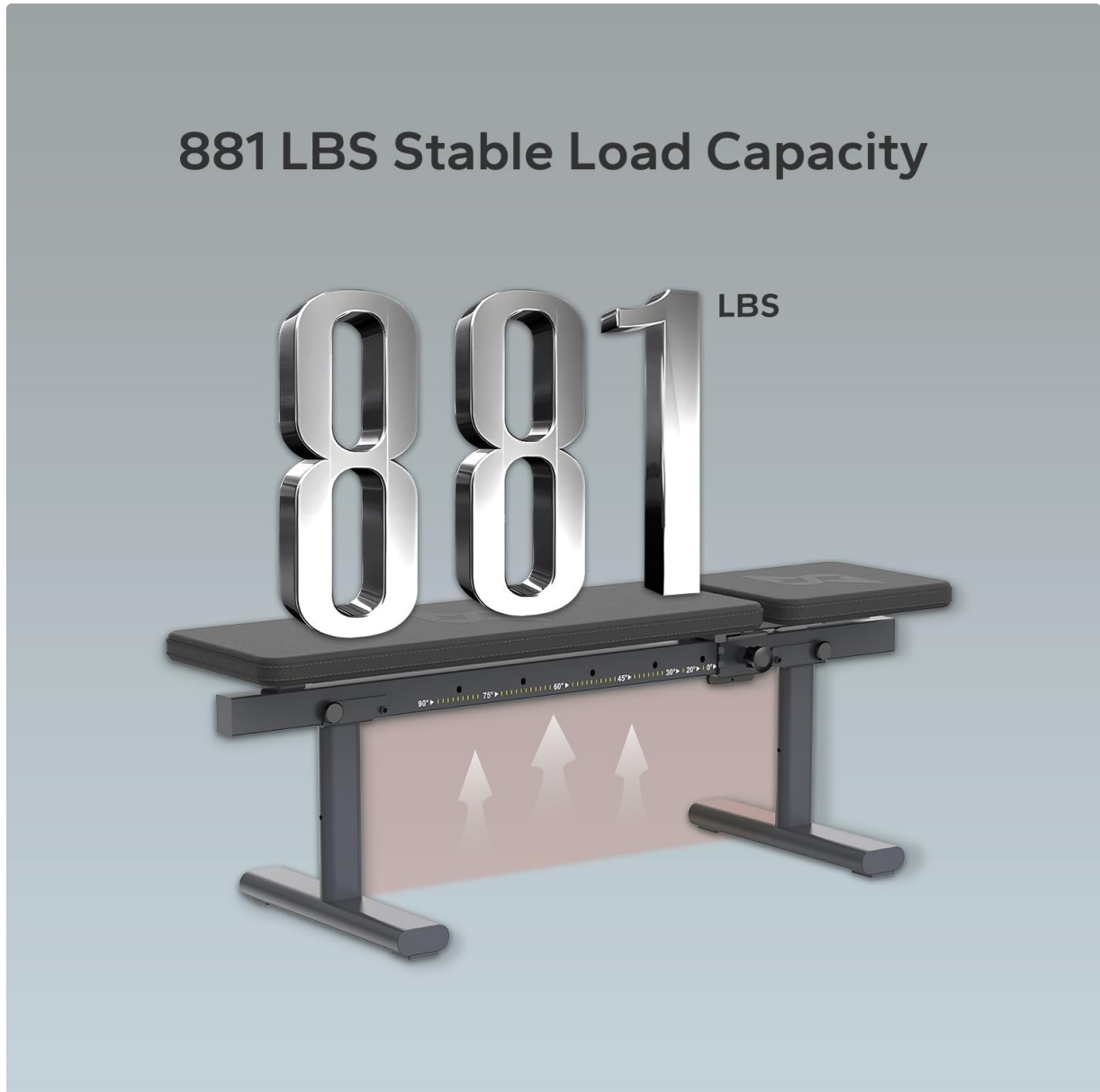
Figure 4.1: The Speediance Adjustable Weight Bench highlighting its 881 LBS stable load capacity.