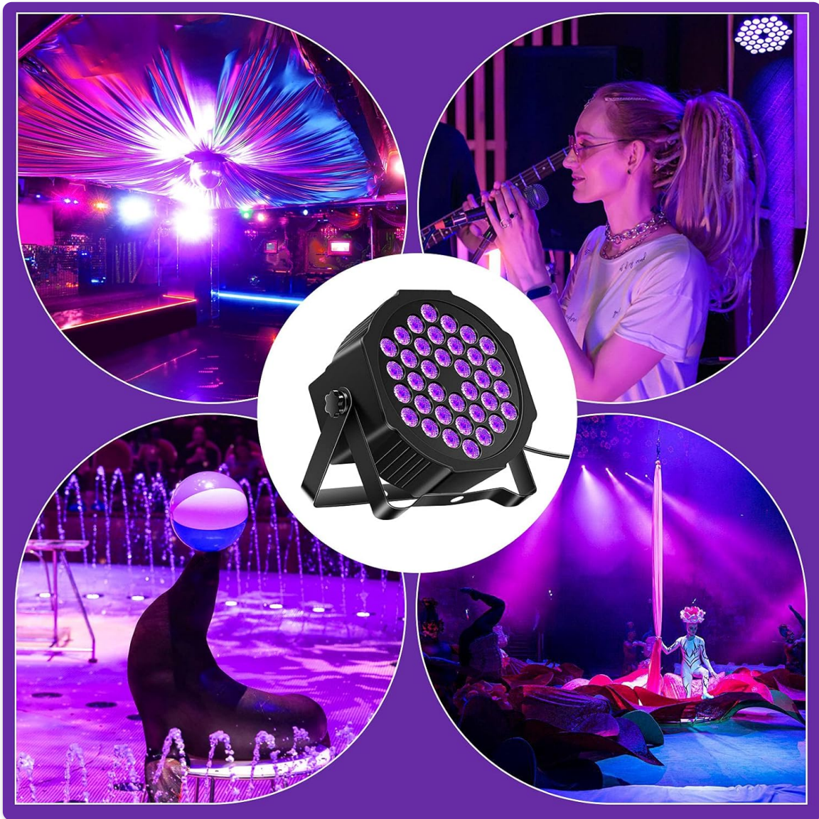
Image 5.1: Examples of the U'King UV Black Light in use at different events, showcasing its versatility for stage lighting, DJ setups, and glow parties.