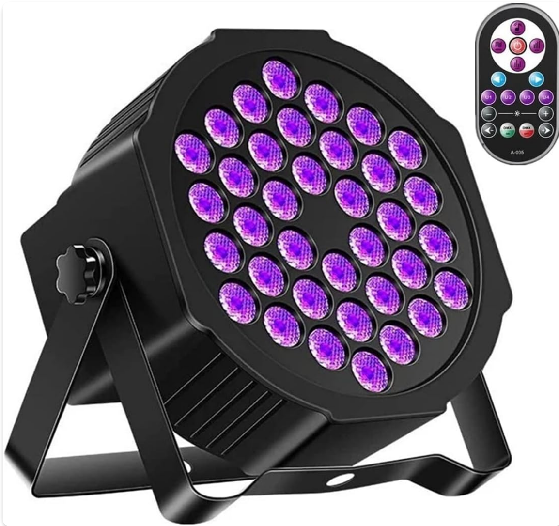
Image 1.1: The U'King ZQ01087 72W UV Black Light with its included remote control.