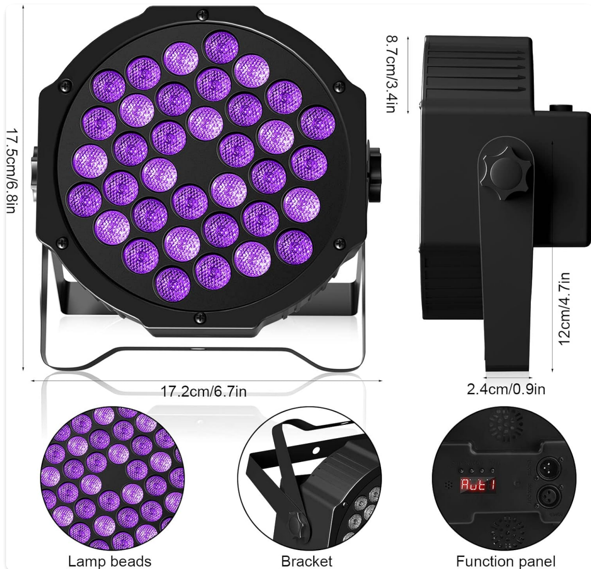
Image 4.1: Product dimensions and key components. The light measures approximately 17.5cm (6.8in) in height, 17.2cm (6.7in) in width, and 8.7cm (3.4in) in depth. It features 36 lamp beads, an adjustable bracket, and a rear function panel with a digital display.

The U`King ZQ01087 is a 72W UV black light equipped with 36 LEDs, designed for various lighting applications. It features a durable aluminum housing and a versatile mounting bracket.