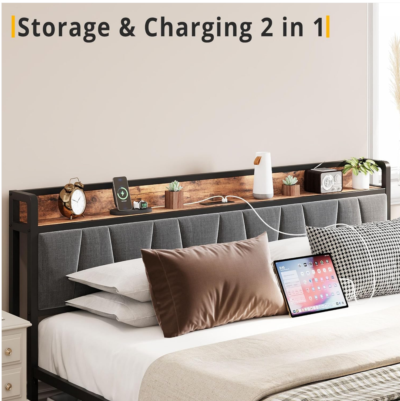
Image: The headboard shelf with various items and devices plugged into the integrated charging station, demonstrating its "Storage & Charging 2 in 1" functionality.