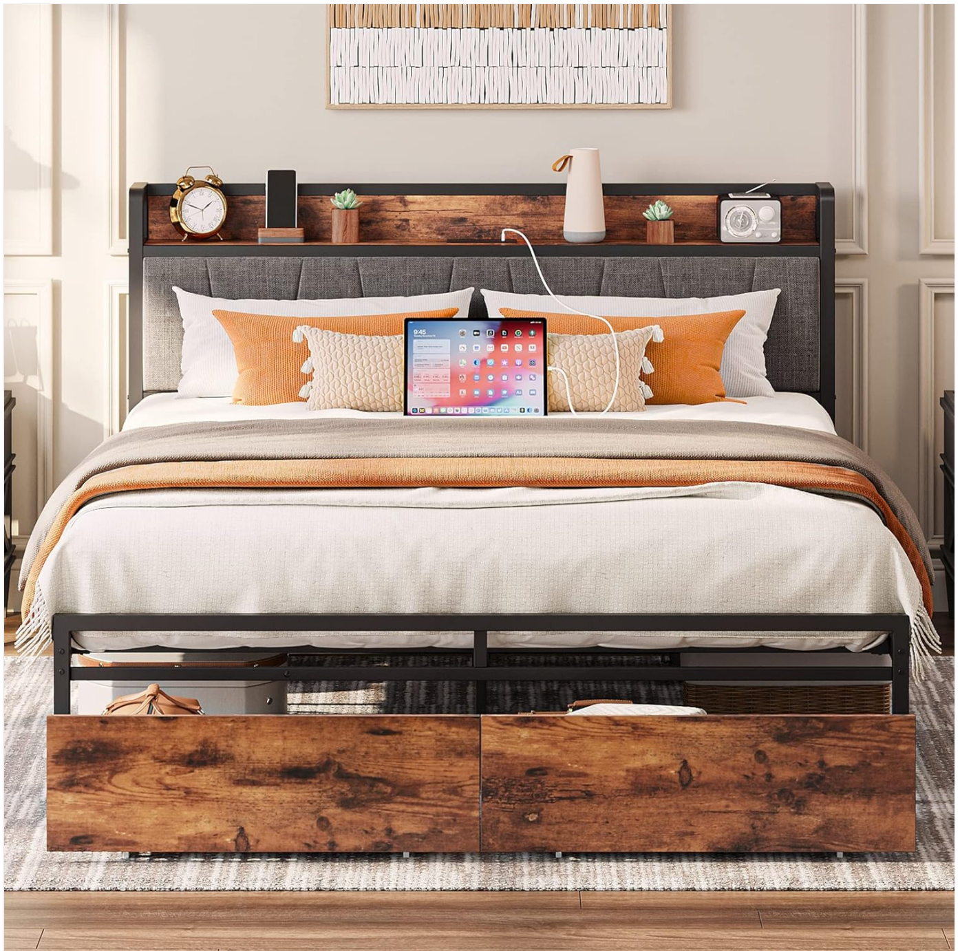
Image: The LIKIMIO Queen Bed Frame, showcasing its vintage brown and gray design, storage headboard with charging station, and two under-bed drawers.