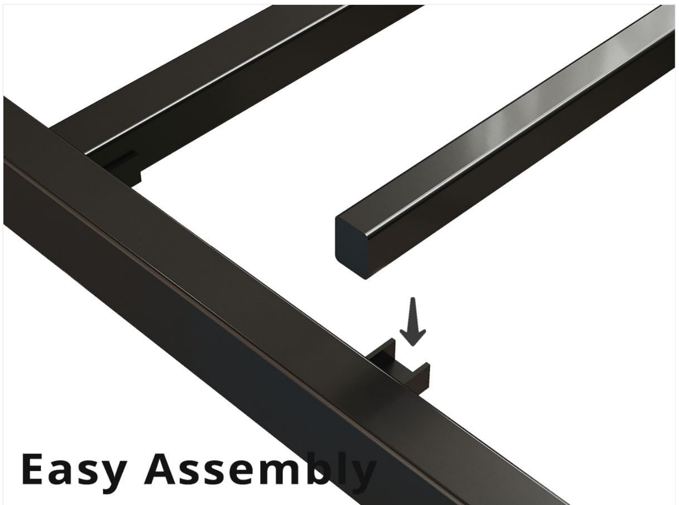
Image: A close-up illustration demonstrating the simple interlocking mechanism for easy assembly of the bed frame components.

Once assembled, double-check all bolts and screws to ensure they are securely tightened. Place your mattress on the frame.