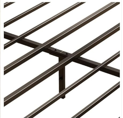
Solid & Stable