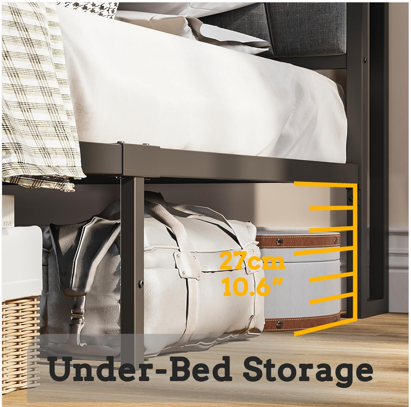
Image: An illustration of the available under-bed storage space, indicating a height of 10.6 inches, suitable for luggage and storage boxes.