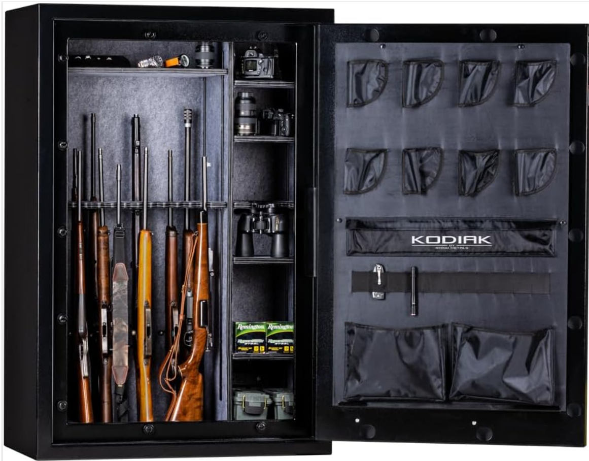
Image: Detailed view of the door organizer.