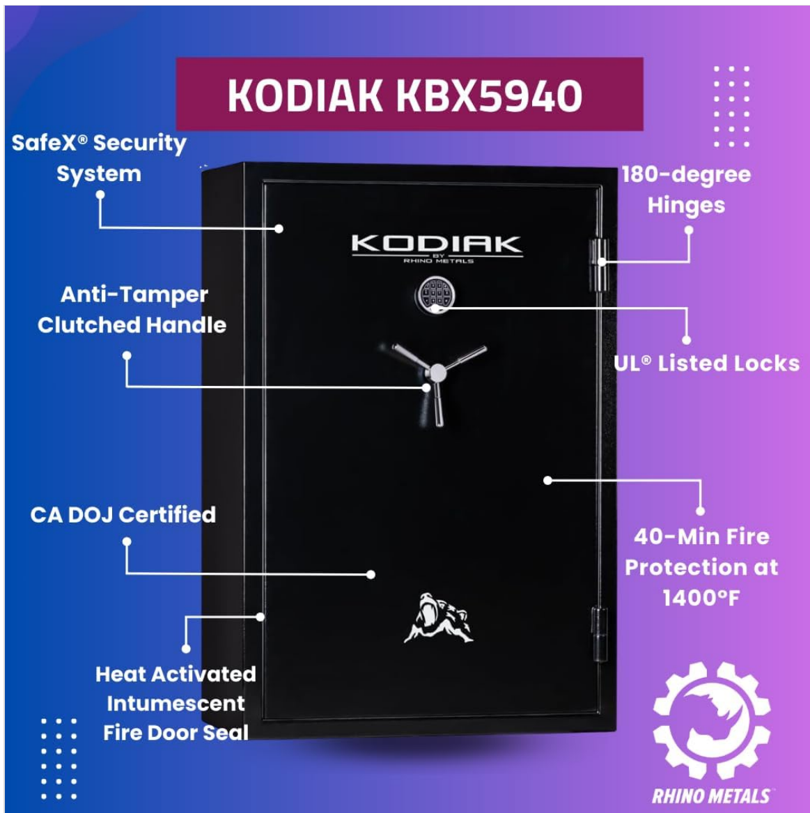
Image: Key features of the Kodiak KBX5940 Gun Safe.

Your browser does not support the video tag.