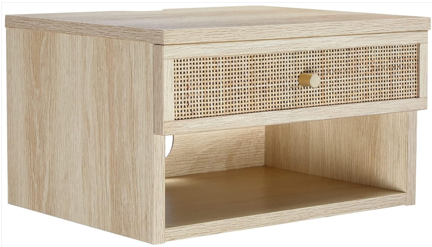
Front view of the Nathan James Jackson floating nightstand, emphasizing the light oak finish and woven rattan drawer.