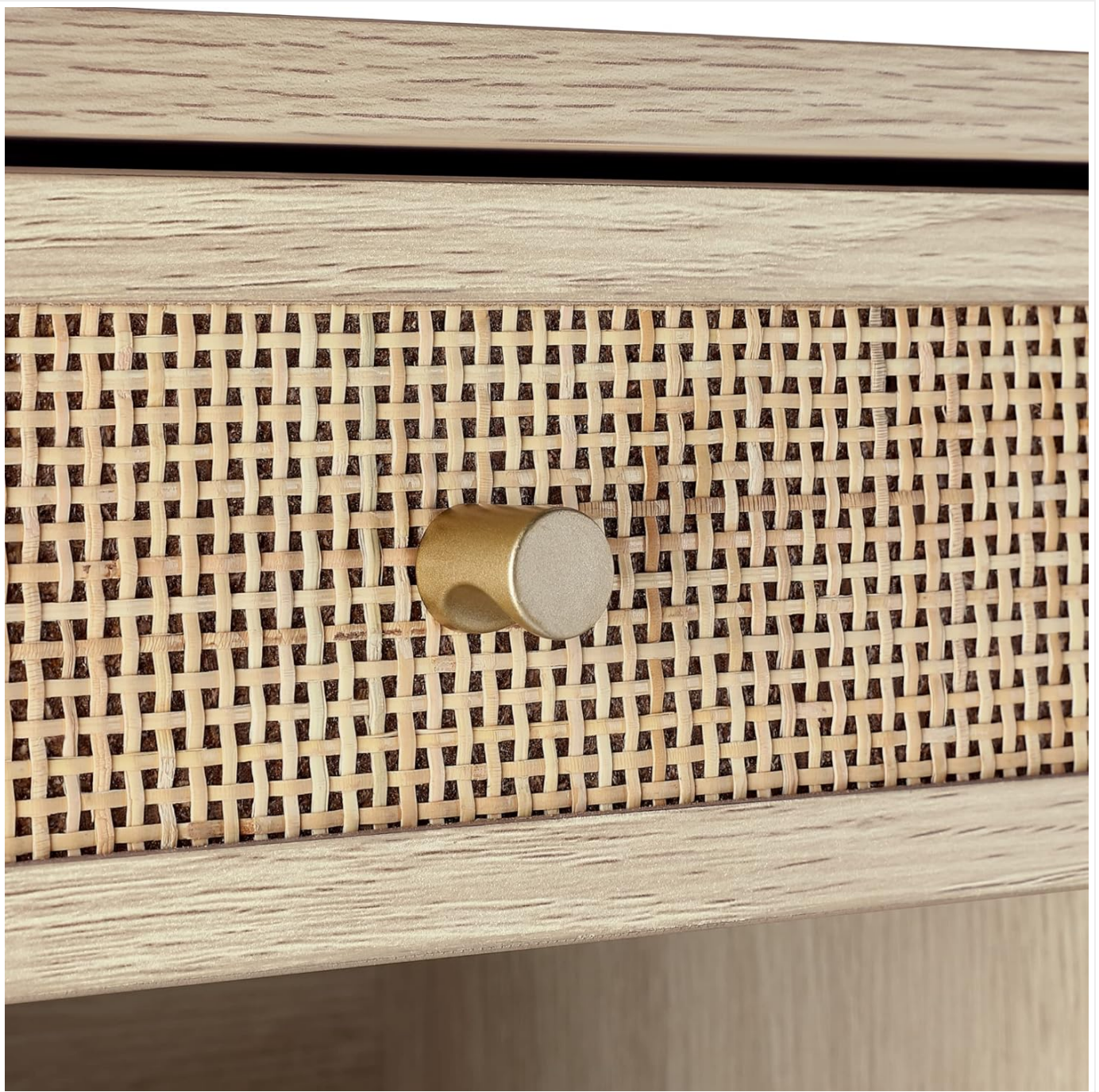
Close-up view of the natural rattan with square webbing on the drawer front and the round brass knob of the Jackson nightstand.