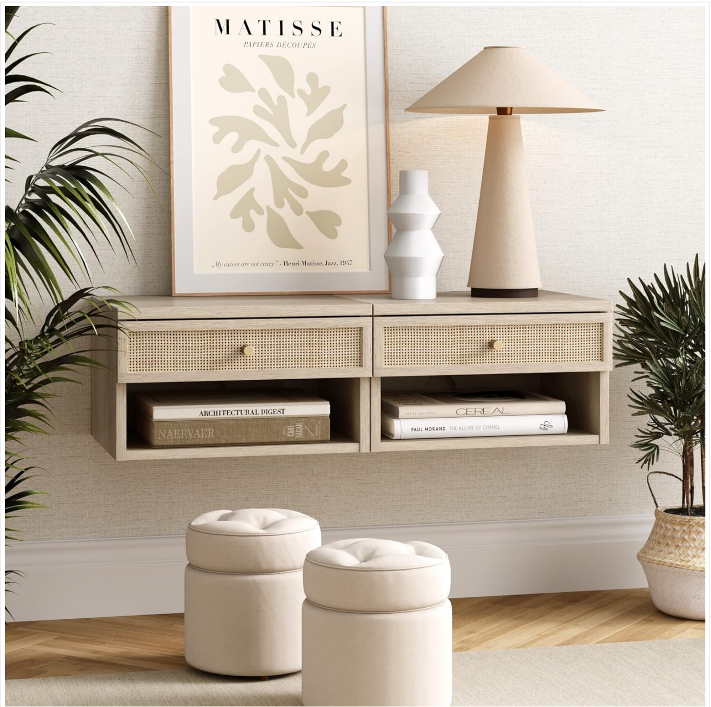
Image of the Nathan James Jackson floating nightstand in a bedroom setting, showcasing its light oak finish and rattan drawer front.