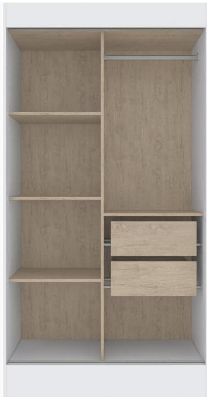
Image 4.1: Internal view of the Doripel Lyon Single Wardrobe, showing the layout of shelves, hanging space, and two internal drawers. The interior finish is a light wood grain.