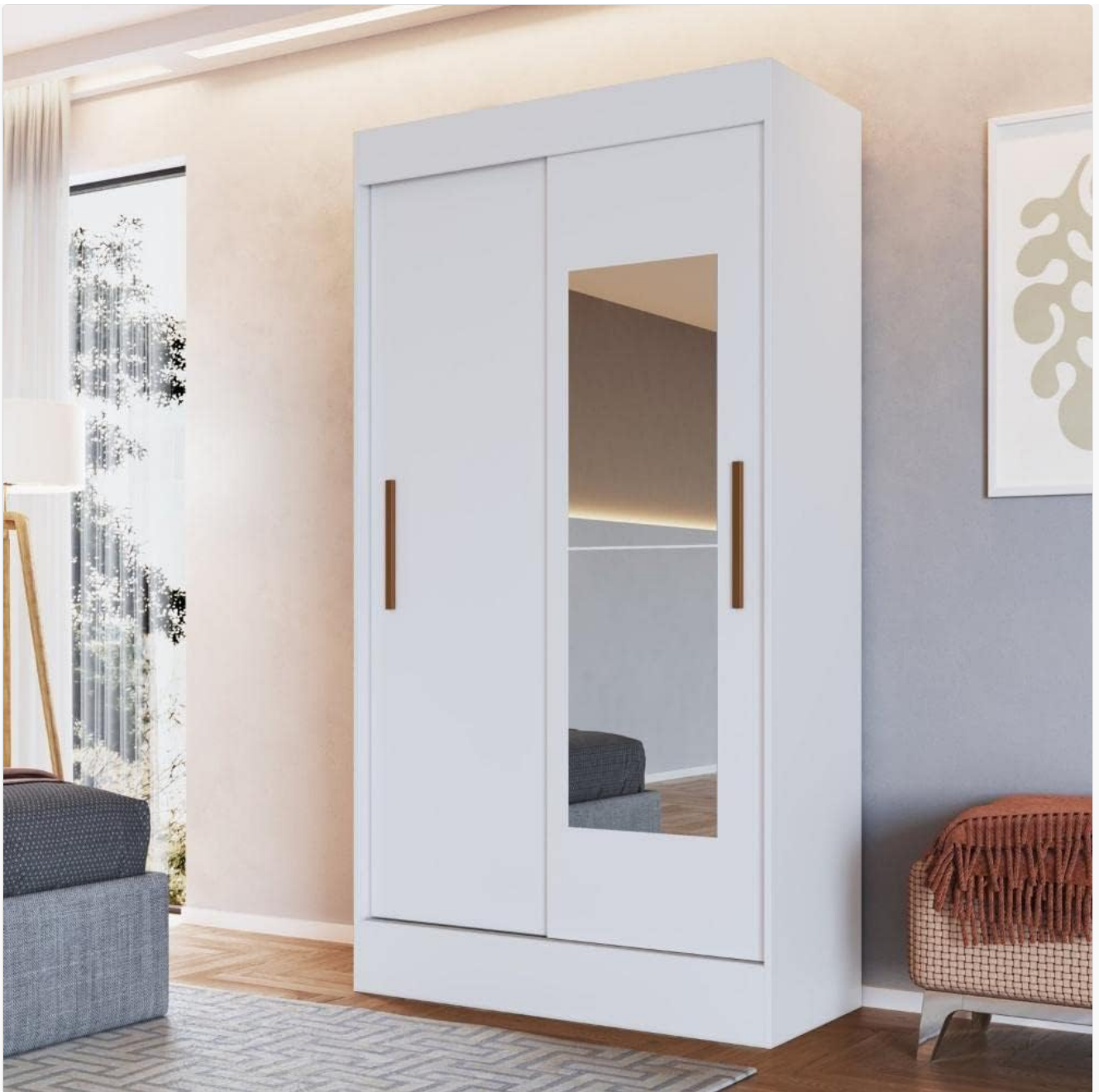
Image 1.1: Front view of the Doripel Lyon Single Wardrobe. The wardrobe is white with two sliding doors, one of which features a full-length mirror. Brown handles are visible on both doors.