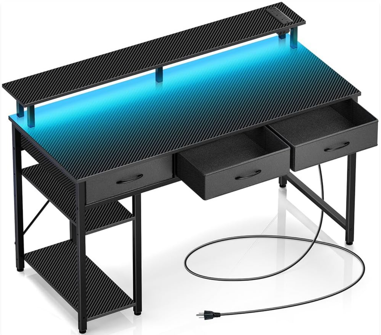
The Rolanstar Computer Desk, featuring integrated LED lighting and convenient storage solutions.