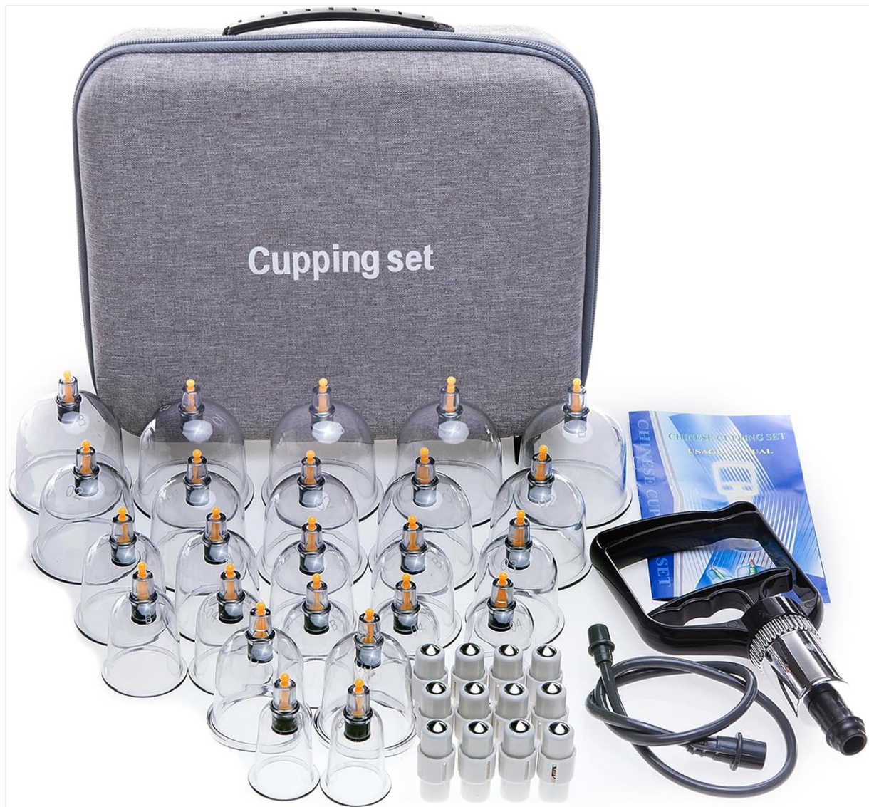
Image 2.1: Overview of the lianjindun 24-Piece Cupping Set components.

The cups are constructed from high-quality polycarbonate (PC) material, designed for durability and ease of cleaning.