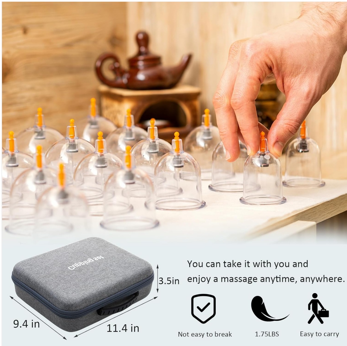
Image 2.3: The portable carrying case for convenient storage and transport.