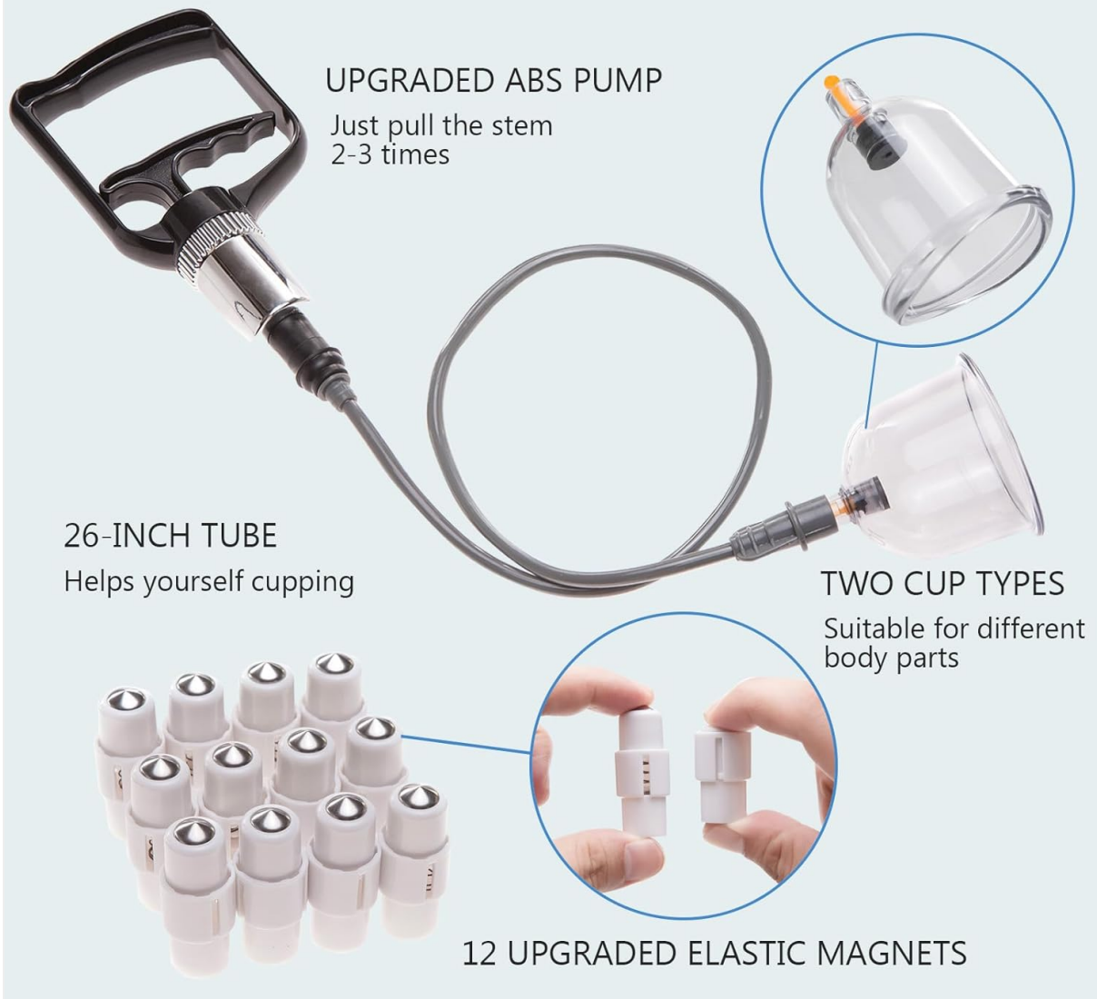
Image 4.2: Components for self-service cupping, including the extension tube.