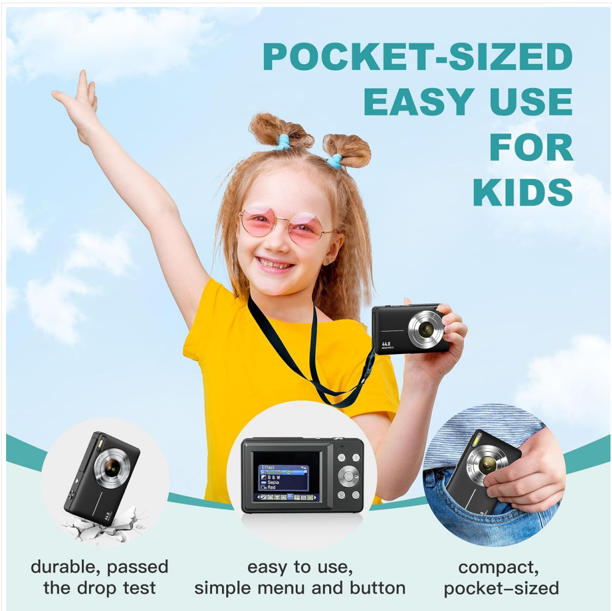
Image 1.1: The CAMKORY DC403 camera is designed to be pocket-sized and easy to use, making it ideal for children and beginners. It has passed drop tests for durability.