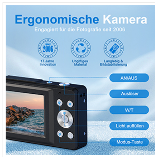
Image 2.2: Detailed view of the camera's side controls, including the ON/OFF button, Shutter, W/T (Zoom), Fill Light, and Mode button.