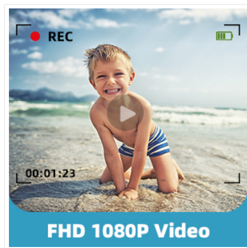
Image 4.2: The camera supports 1080p Full HD video recording, allowing users to capture moments with clarity.