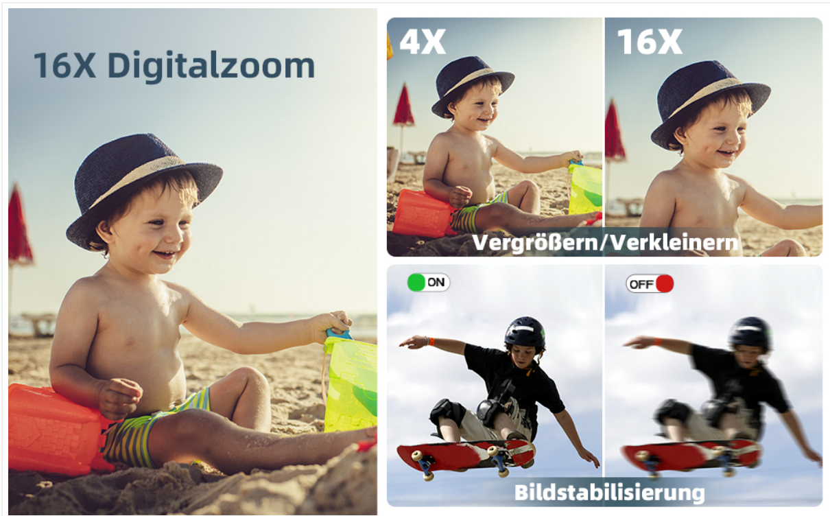
Image 4.3: Demonstrations of 16x digital zoom and image stabilization. The zoom feature allows for closer shots, while stabilization helps maintain clarity during movement.