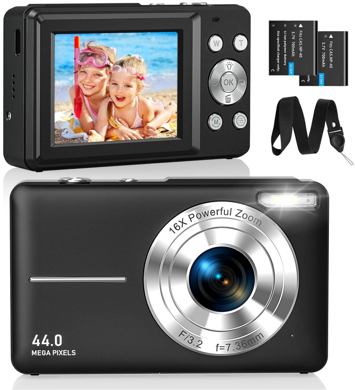
Image 2.1: Front and rear views of the CAMKORY DC403 Digital Camera, illustrating the lens, flash, LCD display, and various control buttons. Two rechargeable batteries are also shown.

The camera features an intuitive layout with ergonomically placed buttons suitable for small hands. Key controls include the power button, shutter button, zoom (W/T) buttons, mode button, and an OK button for menu navigation.