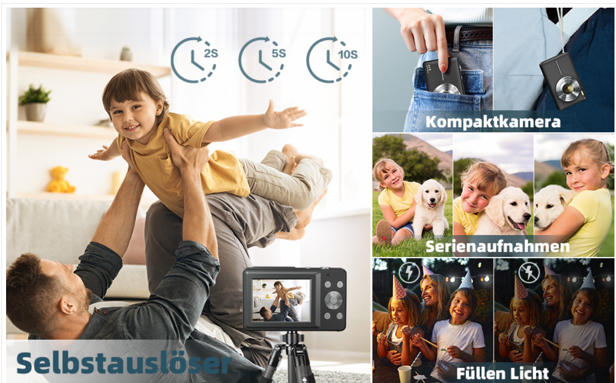
Image 4.4: Examples of self-timer, continuous shooting, and fill light functions. These features enhance photographic flexibility and quality in various scenarios.