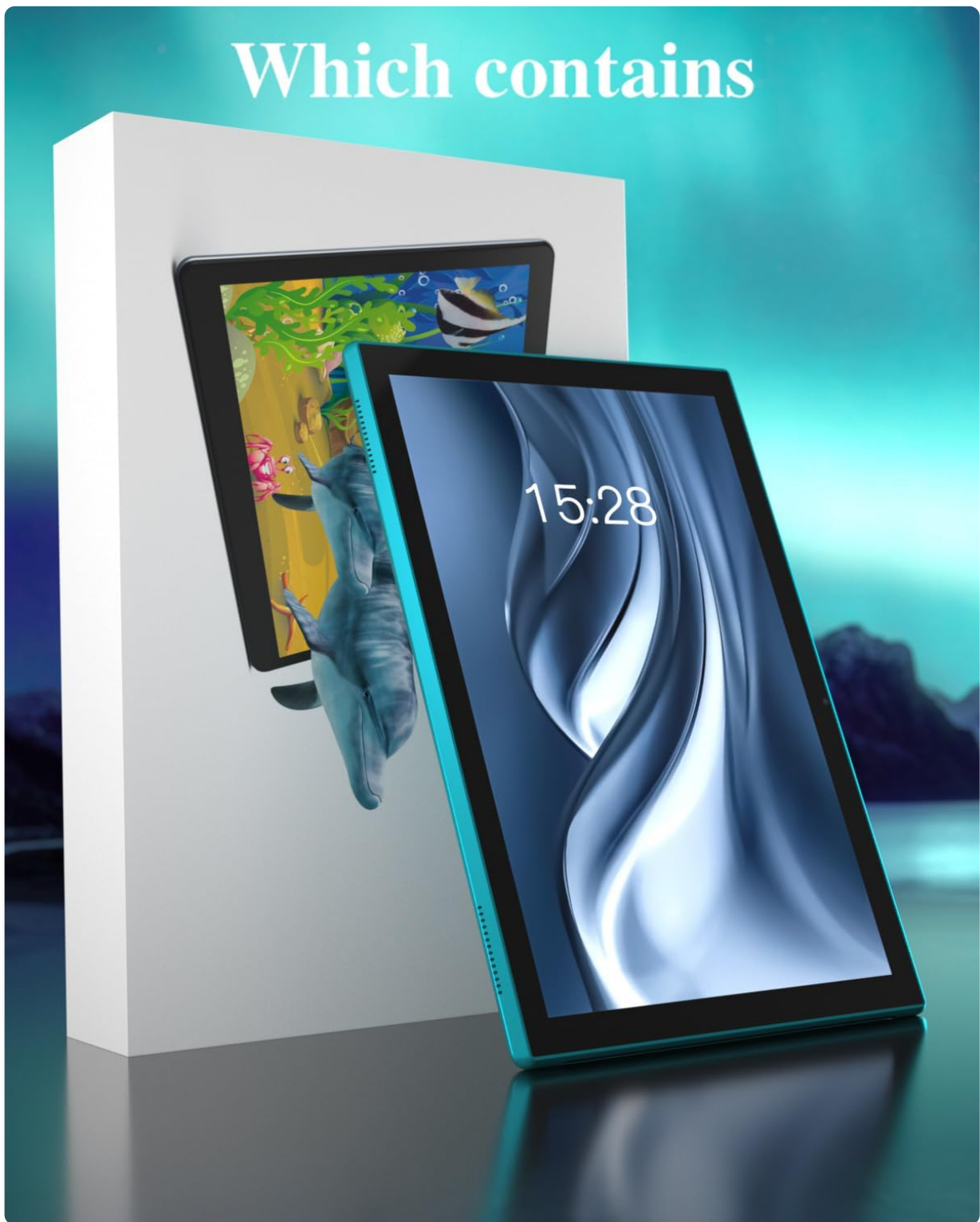
Figure 2: The ZZB ZB10 Tablet and its packaging.