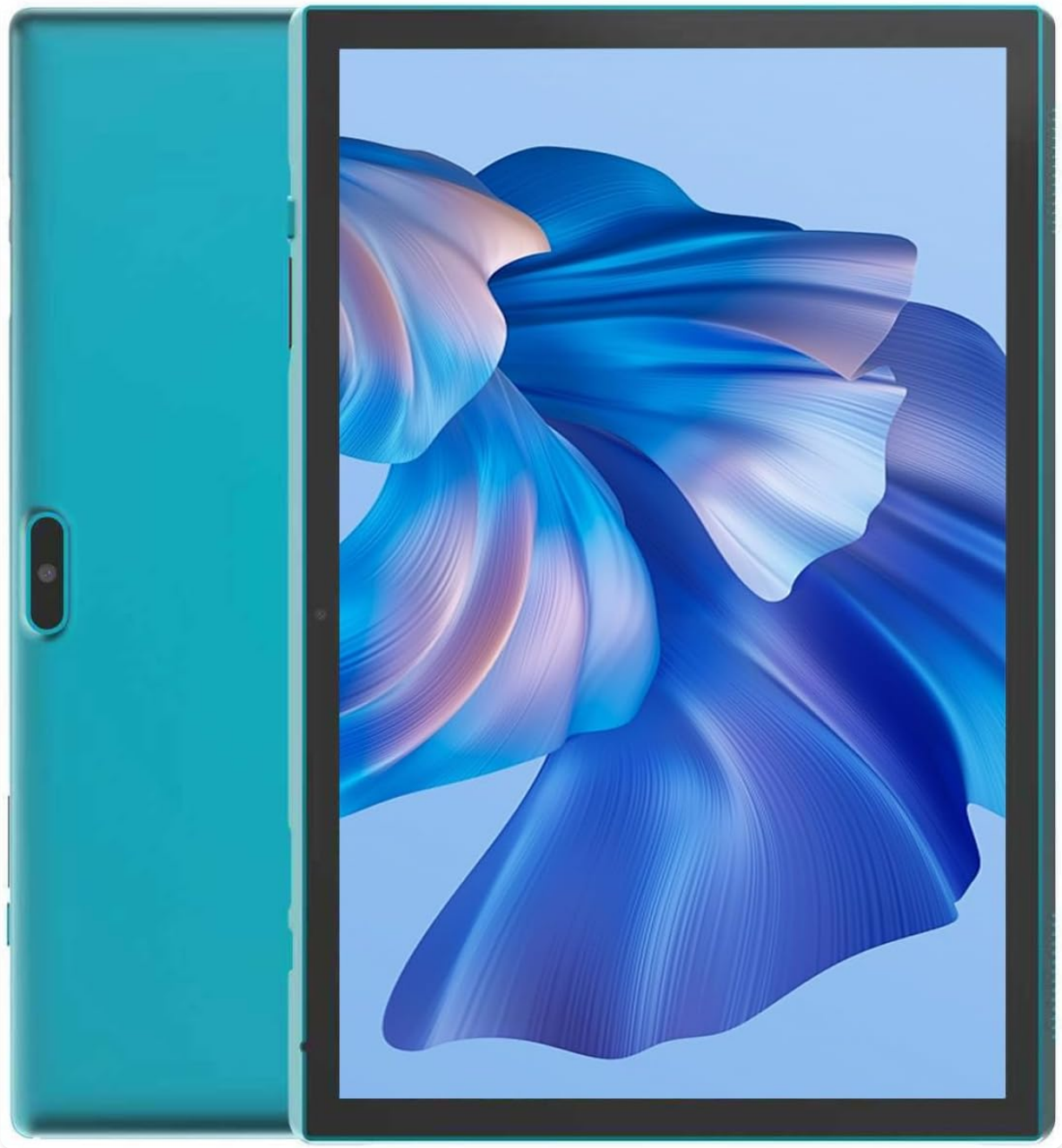
Figure 1: Front view of the ZZB ZB10 Tablet.