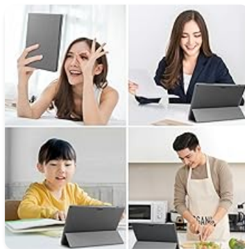
Figure 4: Using the tablet's camera for photos or video calls.