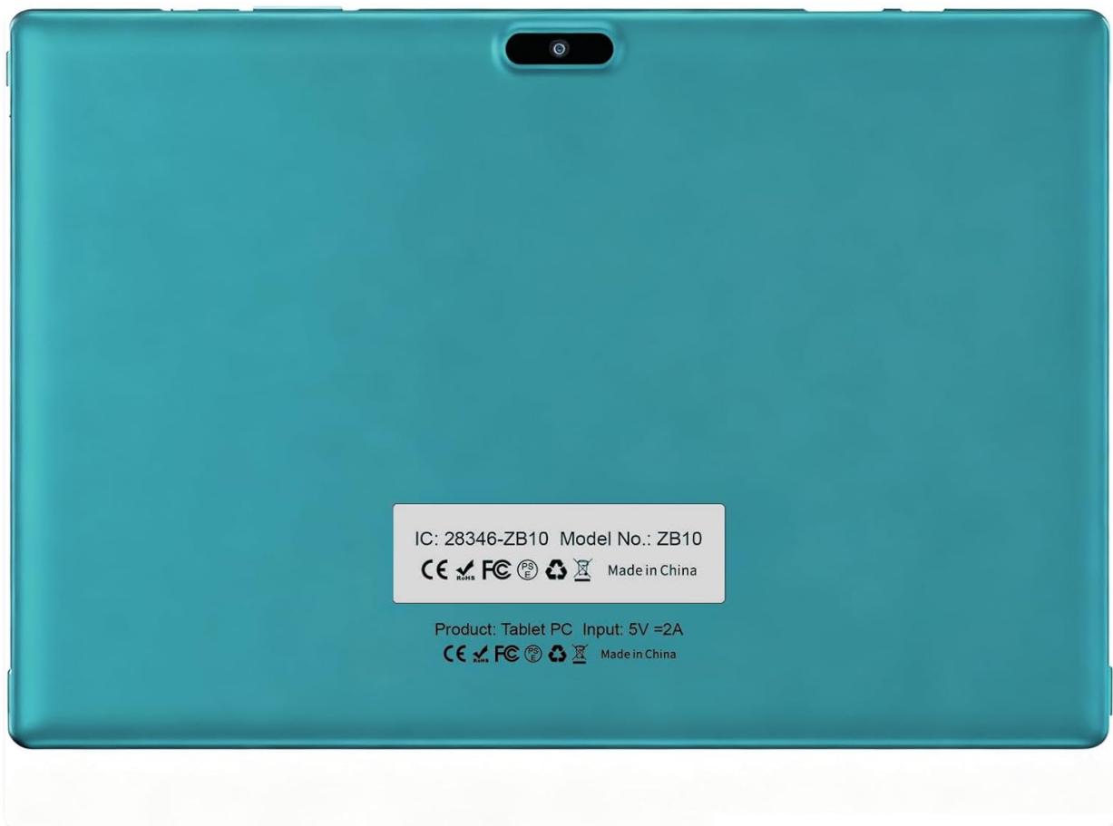
Figure 3: Rear view of the ZZB ZB10 Tablet, highlighting the camera and model information.