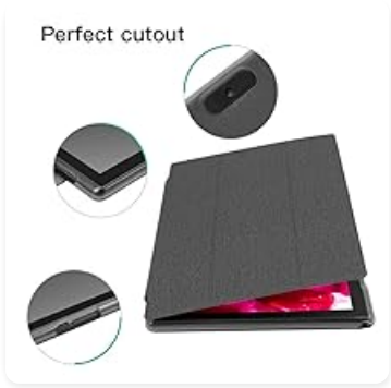
Figure 7: The tablet's 10.1-inch IPS display.