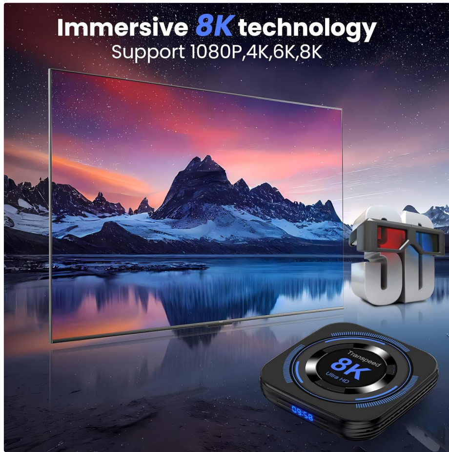
Figure 4.1: The TV box supports immersive 8K technology, offering support for 1080P, 4K, 6K, and 8K resolutions.