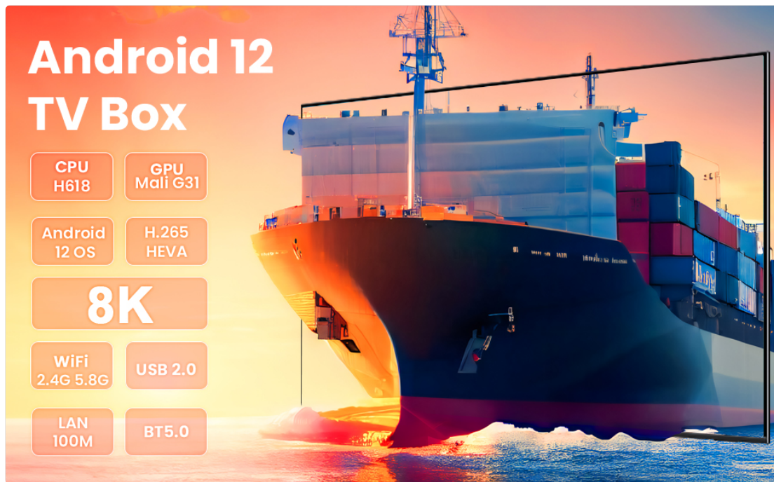
Figure 7.2: A comprehensive overview of the Android 12 TV Box's key features and specifications.