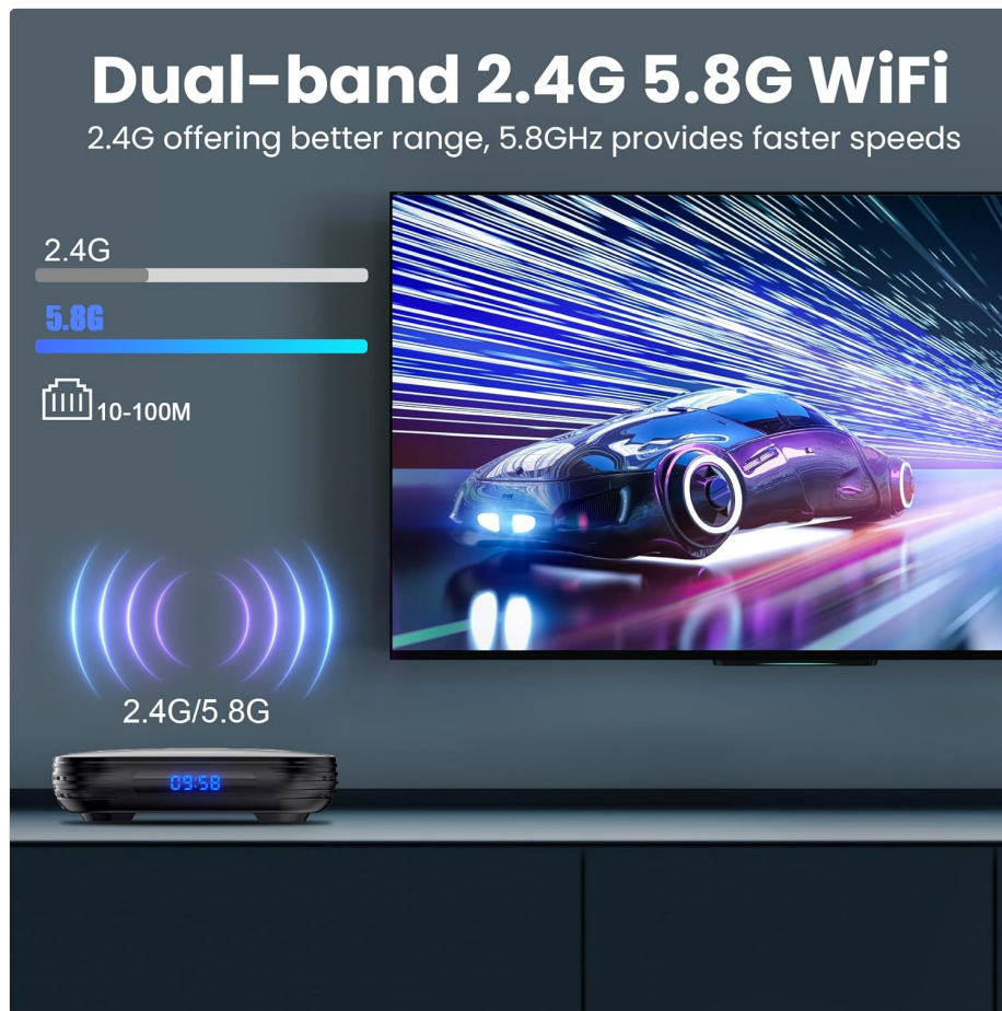
Figure 4.5: Dual-band 2.4G and 5.8G Wi-Fi provides better range and faster speeds for a smooth streaming experience.