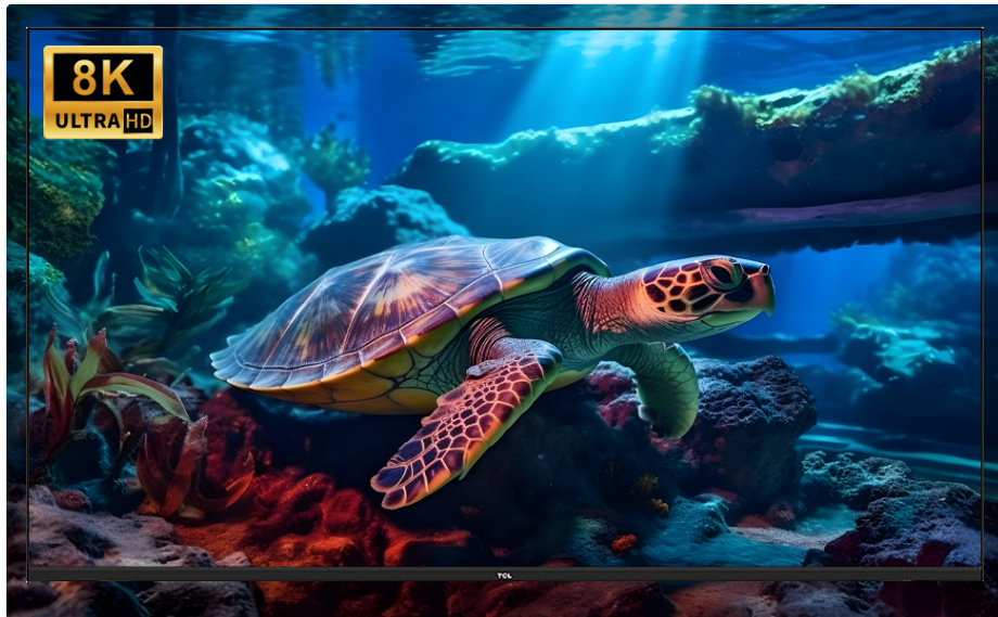
Figure 4.2: Enjoy stunning visual fidelity with 8K Ultra HD support, bringing scenes to life with incredible detail.