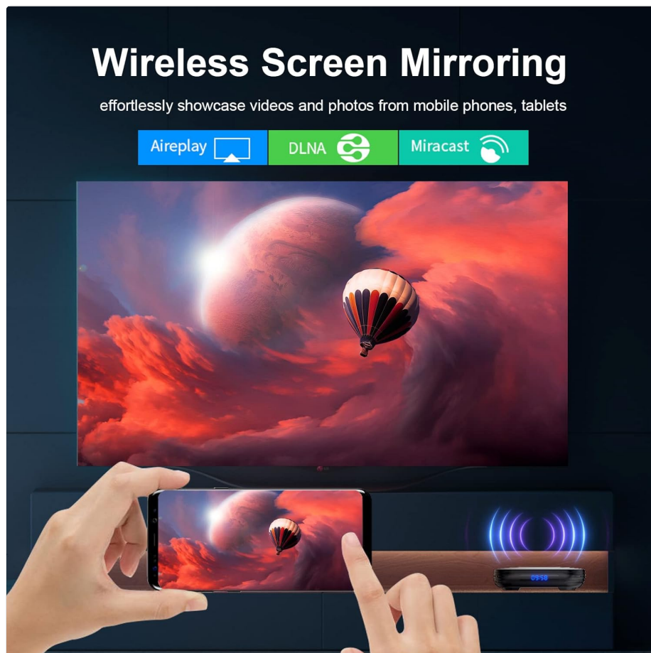
Figure 4.6: Wireless screen mirroring allows you to effortlessly showcase videos and photos from mobile phones and tablets.