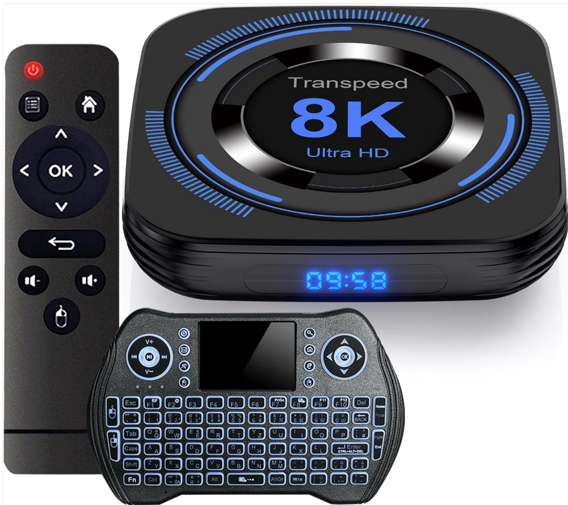
Figure 2.1: Contents of the Transpeed Android TV Box package, including the main unit, remote control, and mini keyboard.