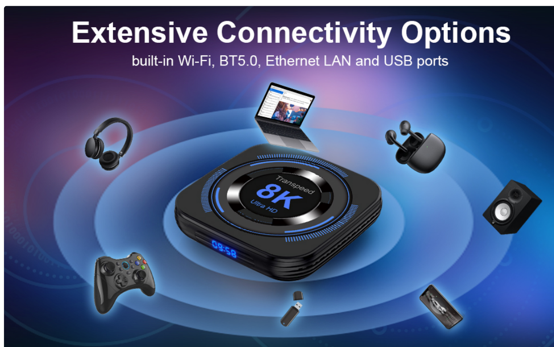
Figure 3.1: The TV box offers extensive connectivity options, including built-in Wi-Fi, BT5.0, Ethernet LAN, and USB ports for various peripherals.