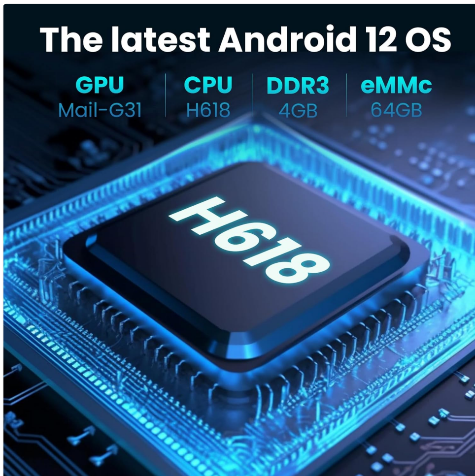
Figure 7.1: Core specifications of the Android TV Box, highlighting its H618 CPU, Mali G31 GPU, 4GB RAM, and 64GB eMMC storage.