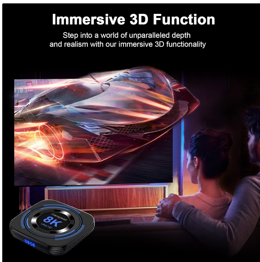
Figure 4.4: Step into a world of unparalleled depth and realism with the immersive 3D functionality.