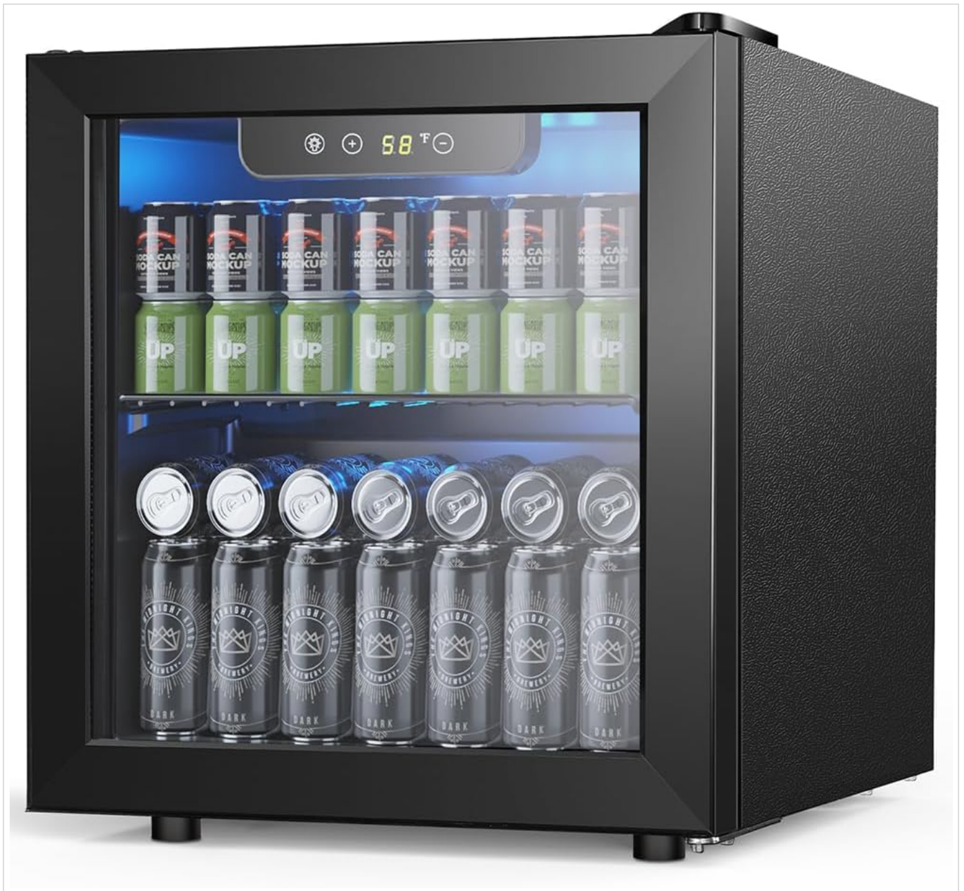
Image: The Joy Pebble Beverage Refrigerator Cooler, showcasing its compact black design and glass door filled with various beverages.