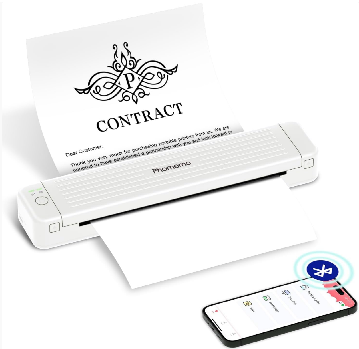
Image: The Phomemo P831 Portable Printer in white, shown printing a document from a smartphone via Bluetooth connection.