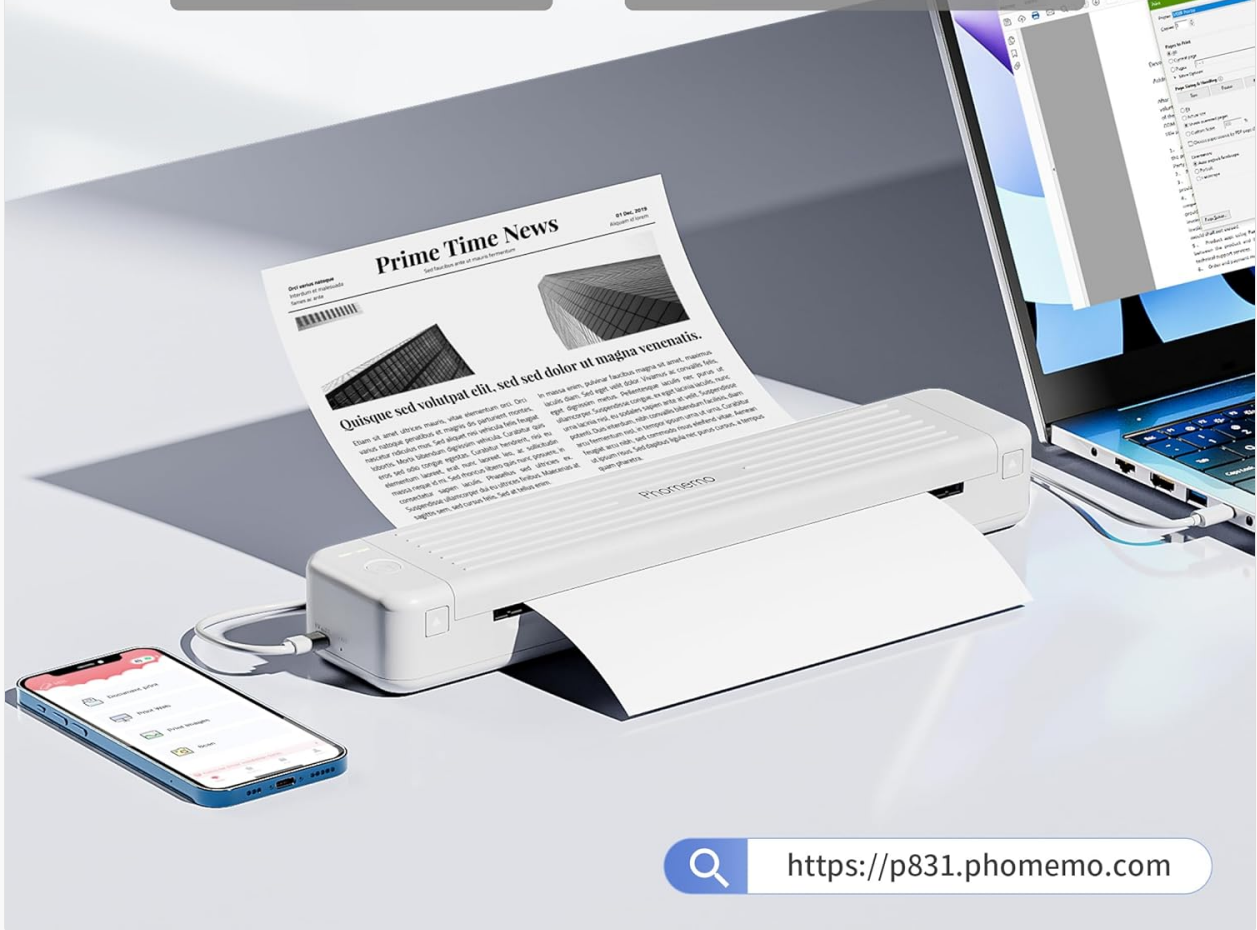
Image: The Phomemo P831 printer highlighting its Bluetooth connectivity for Android, iOS, and iPad, and USB connection for Mac, Windows, Chrome OS, and Linux.