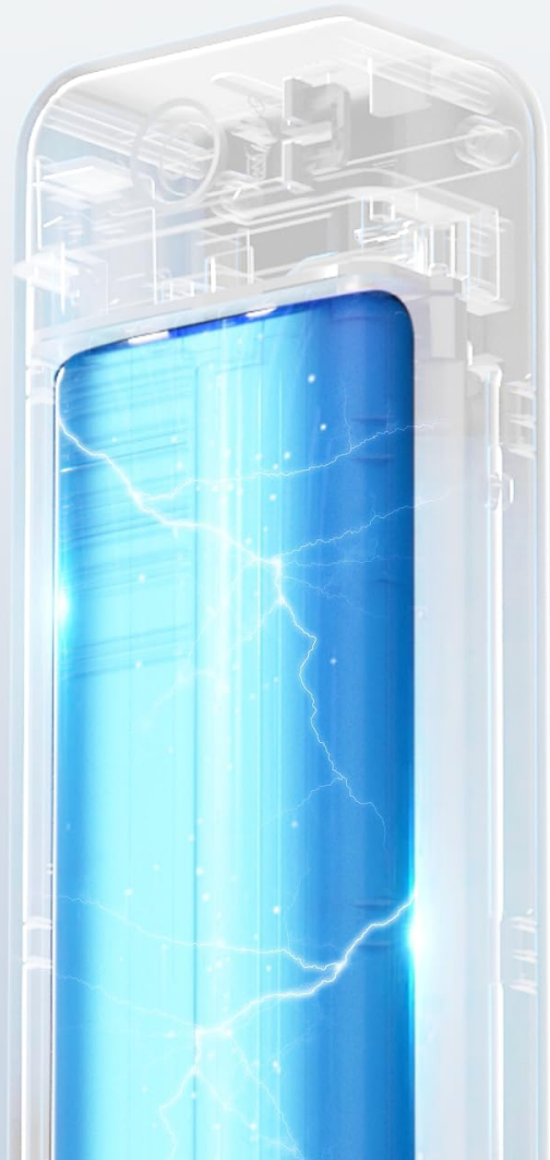
Image: Detailed specifications of the Phomemo P831's large capacity battery, including its 2000 mAh capacity, 48 hours long standby time, ability to print 160 sheets on a full charge, and 45 sheets per ribbon.