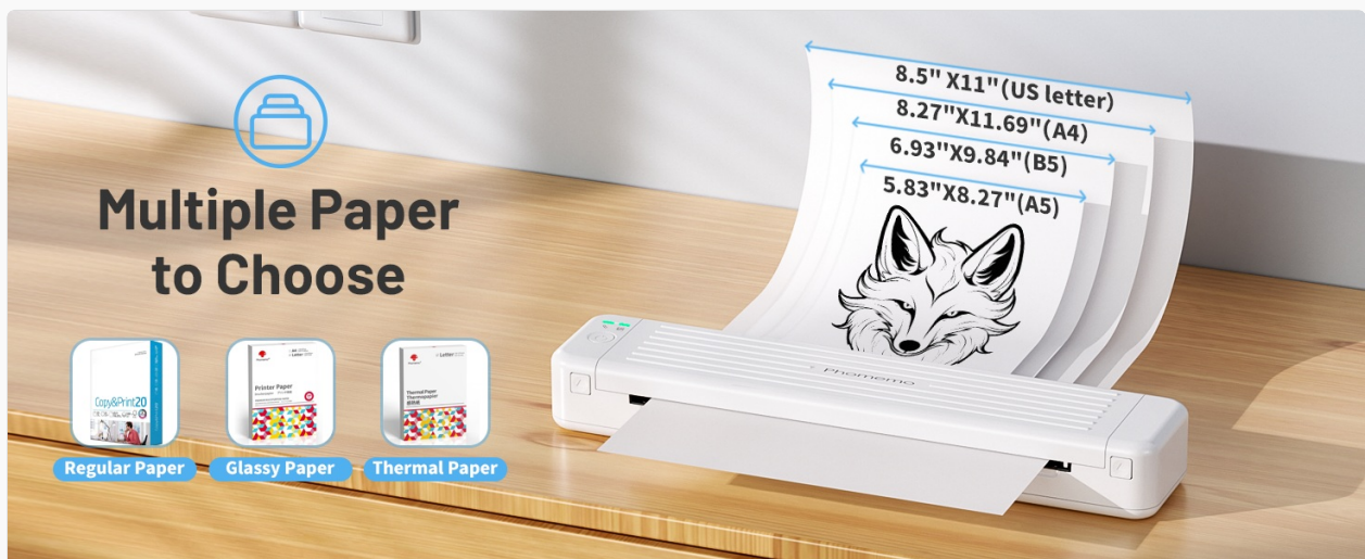
Image: The Phomemo P831 printer demonstrating compatibility with various paper sizes including US Letter, A4, B5, and A5.

Ensure the printer is powered on. Gently insert the paper into the paper input slot at the front of the printer. The printer will automatically feed the paper into position when it detects it. Ensure the paper is aligned correctly to prevent jams or crooked prints.