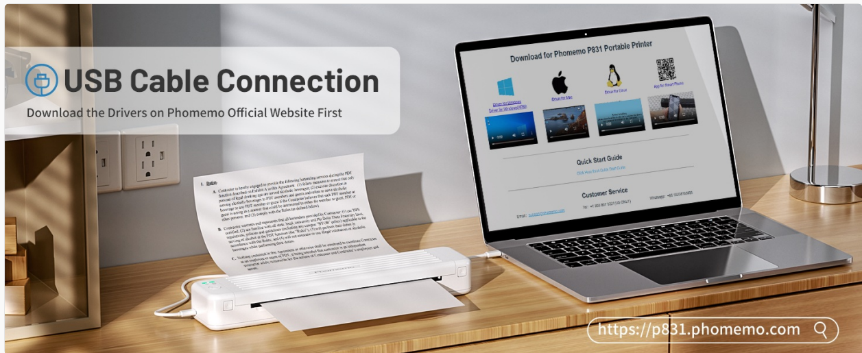
Image: The Phomemo P831 printer connected to a laptop, illustrating the USB connection for printing.

After installing the necessary drivers (see Setup Guide), connect the Phomemo P831 printer to your computer using the provided USB-C cable. Once connected, the printer will be recognized by your system. You can then print documents as you would with any standard printer, selecting "Phomemo P831" from your printer options.