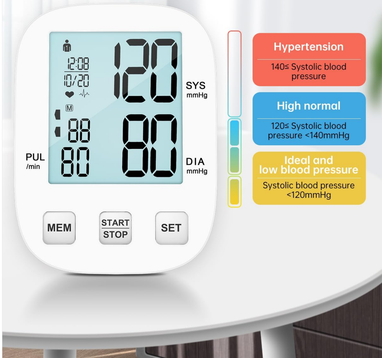
Image: The blood pressure monitor display showing the grading system for blood pressure levels, from ideal to hypertension.