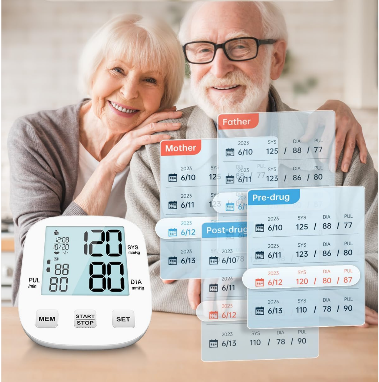
Image: The blood pressure monitor displaying its 2*99 data storage capacity, allowing two users to track their blood pressure readings over time, including average values and comparisons by time or status.