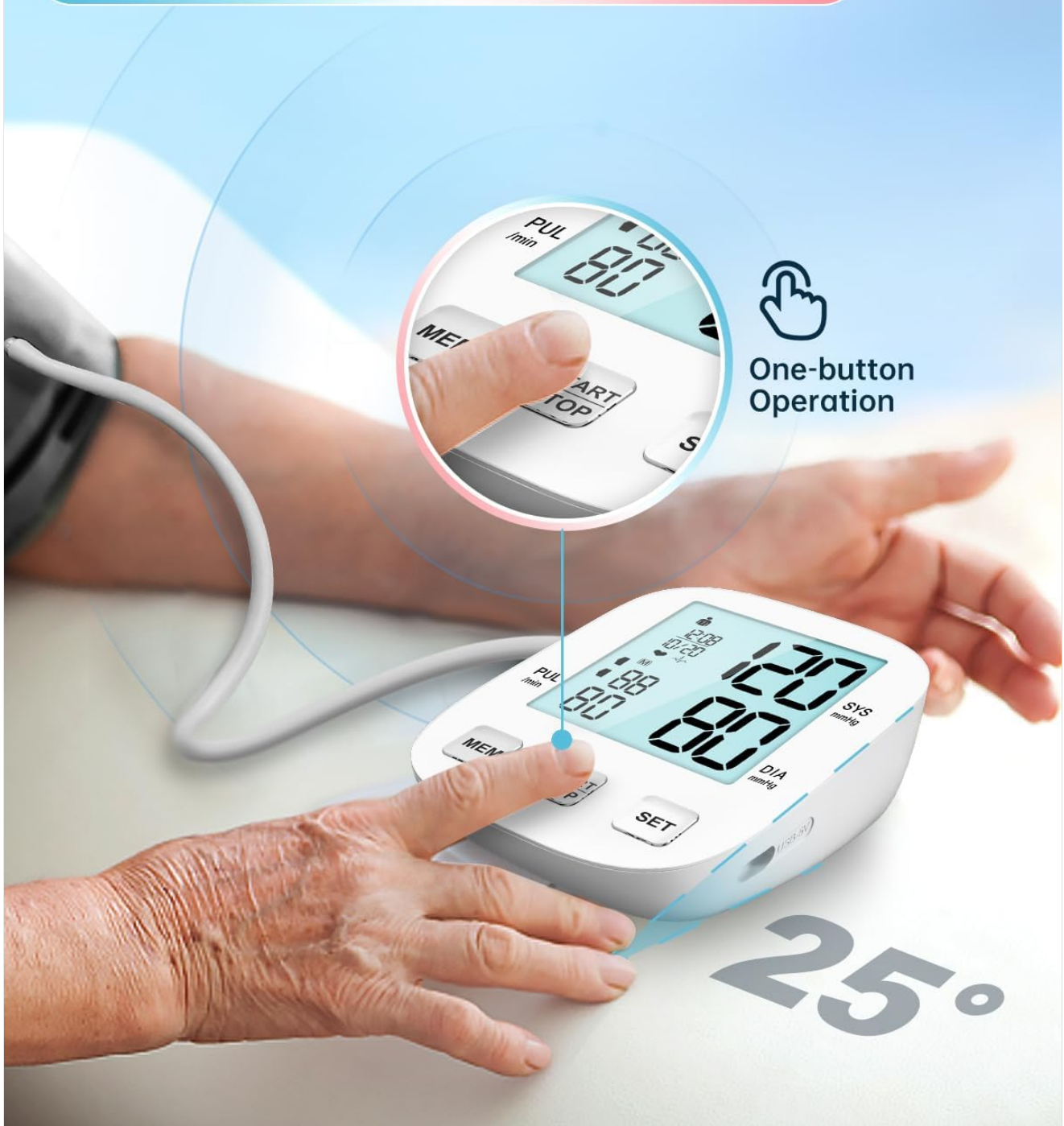
Image: The blood pressure monitor display showing a measurement in progress, highlighting the simplicity of one-button operation.

Your browser does not support the video tag.