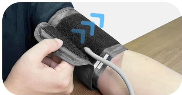
Image: Visual guide on how to operate the blood pressure monitor with one hand, emphasizing proper cuff adjustment and smart pressurization.