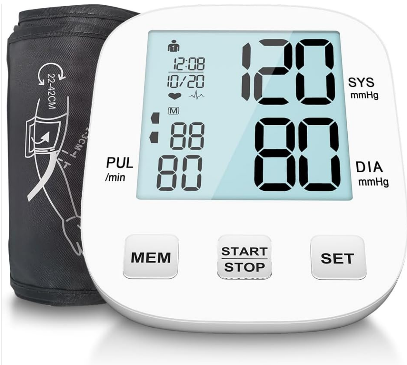
Image: The HOLFENRY Blood Pressure Monitor U80B, showing the main unit and the attached arm cuff.