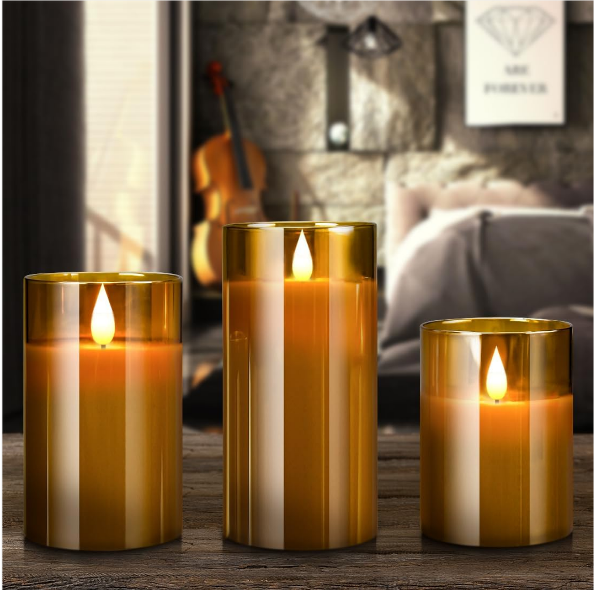
Image: The three flameless candles in varying heights, ready for placement.

Place the flameless candles on a stable, flat surface. Avoid direct sunlight or extreme temperatures, as this may affect the wax material.