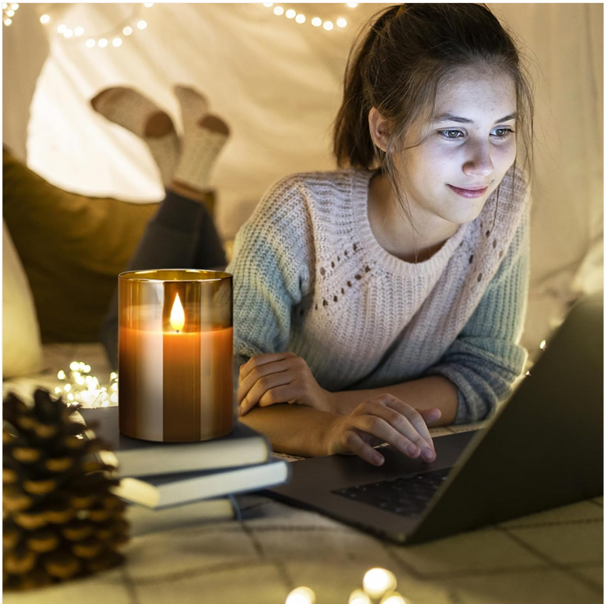
Image: Flameless candle providing ambient light in a home setting.