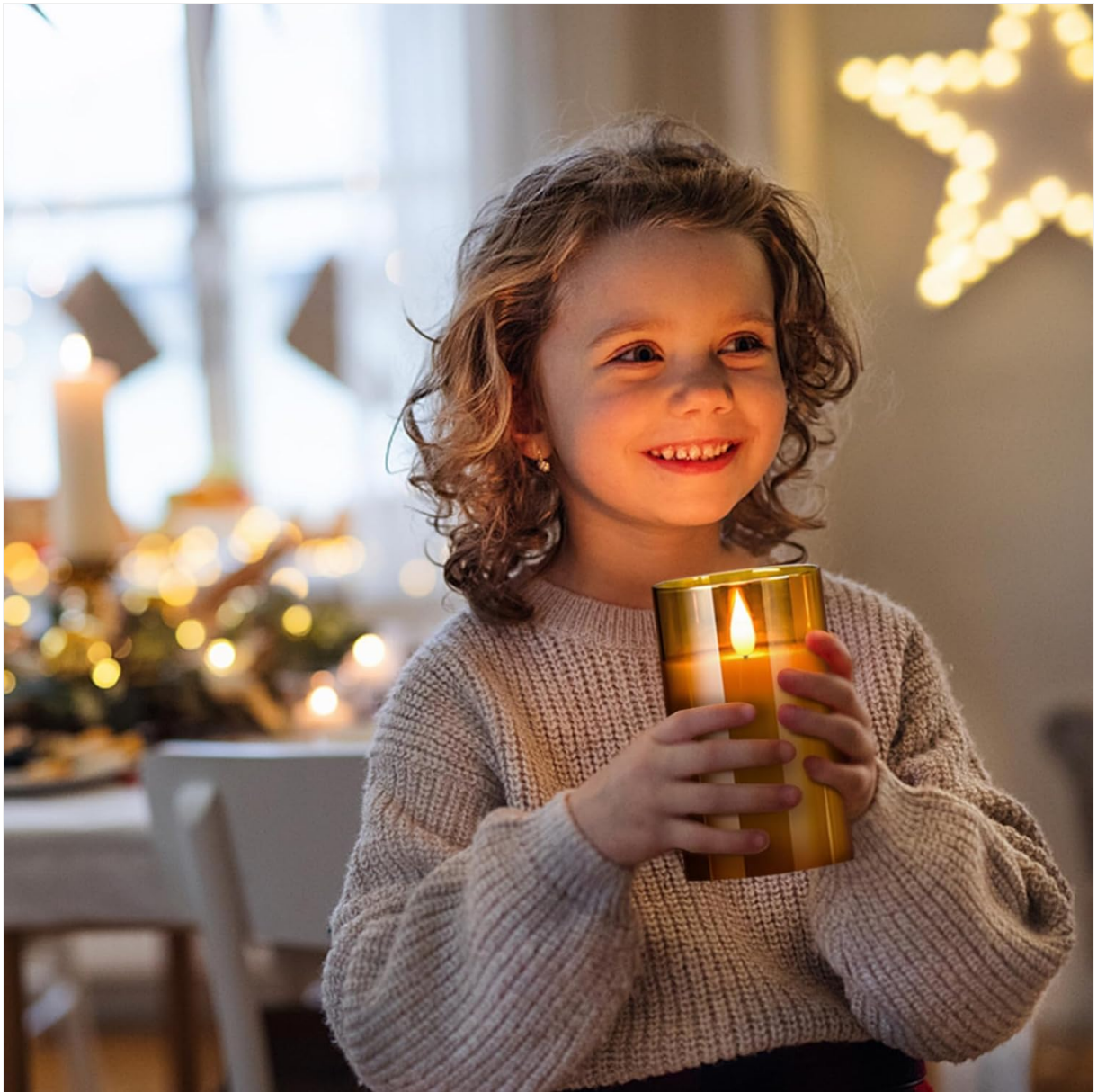
Image: A child safely holding a flameless candle, highlighting its safety features.