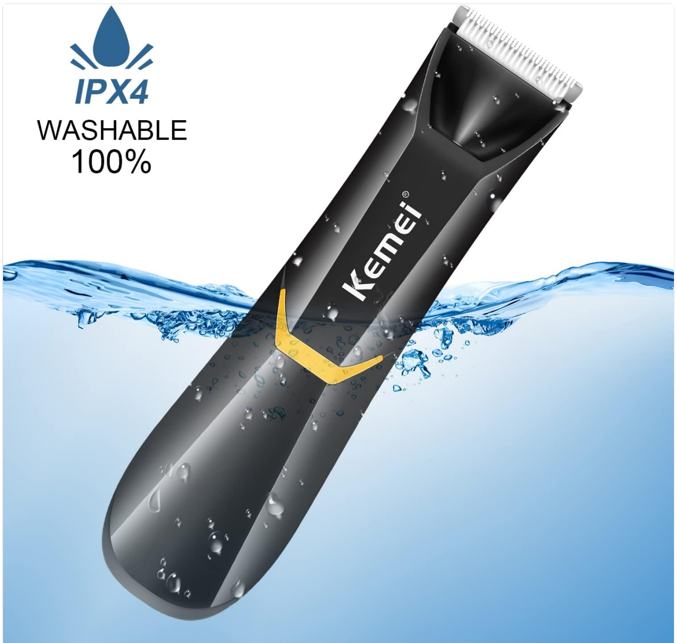
Image: The KEMEI trimmer partially submerged in water, illustrating its IPX4 waterproof rating and washability.