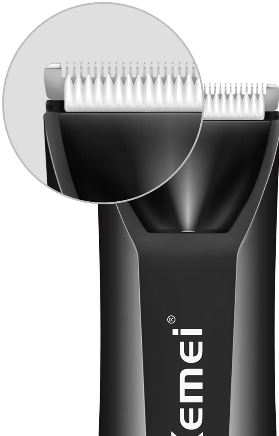
Image: A detailed view of the trimmer's stainless steel cutter head, highlighting the precision blades.