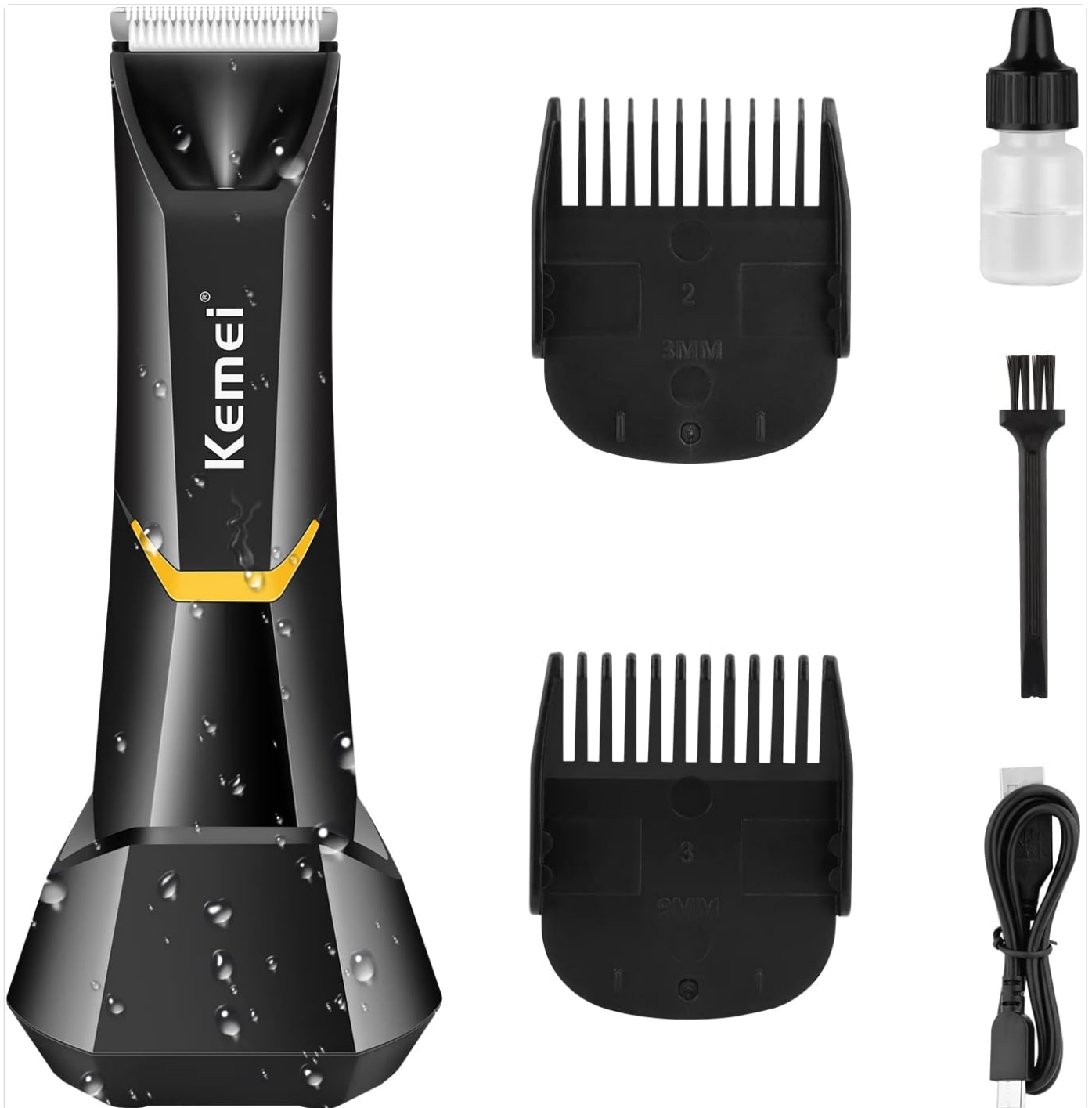
Image: The KEMEI km-3208 Electric Body Trimmer shown with its complete set of accessories, including guide combs, USB charging cable, charging base, cleaning brush, and lubricating oil.