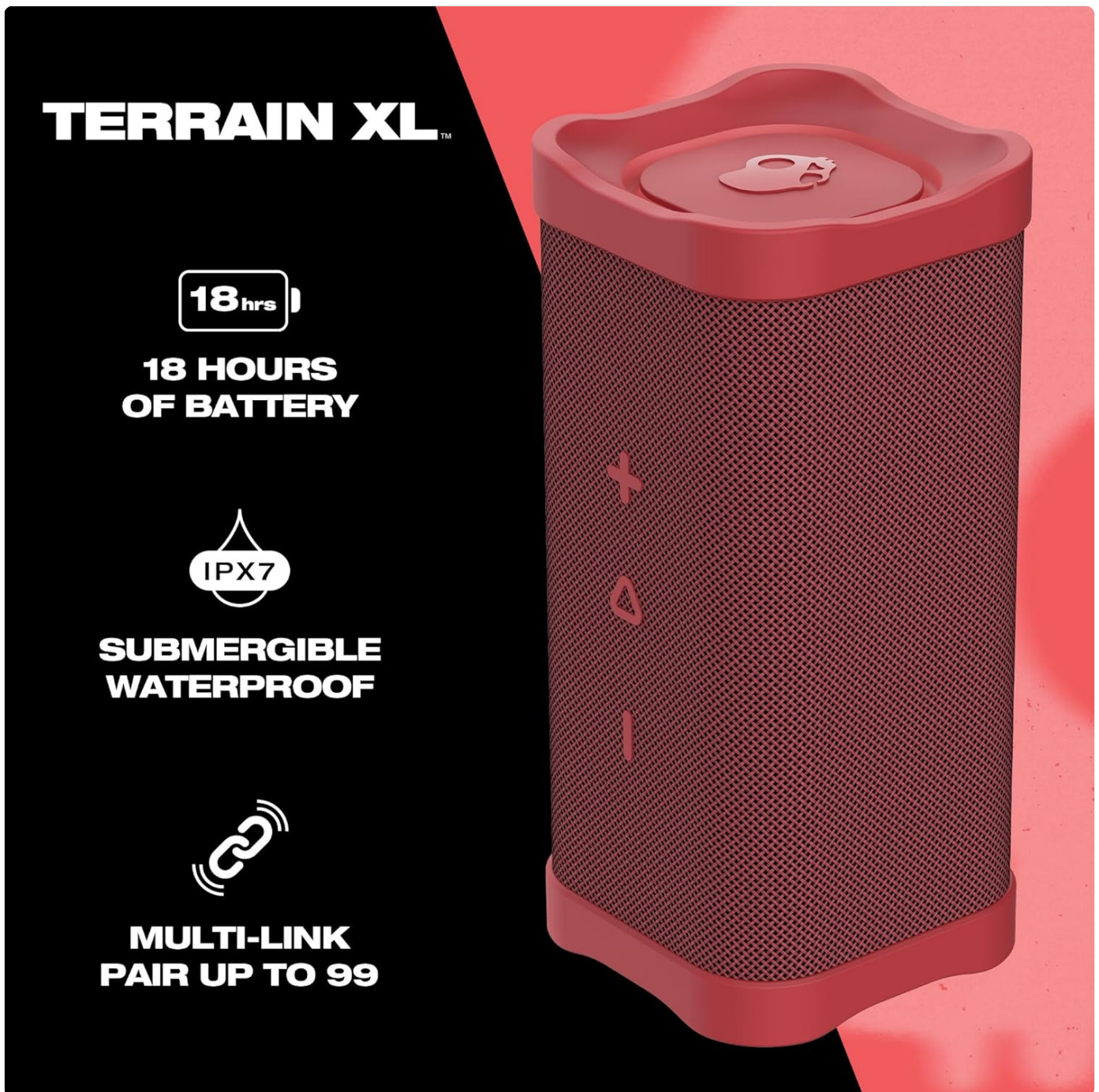
Figure 2: Visual representation of key features including battery life, waterproof rating, and Multi-Link capability.