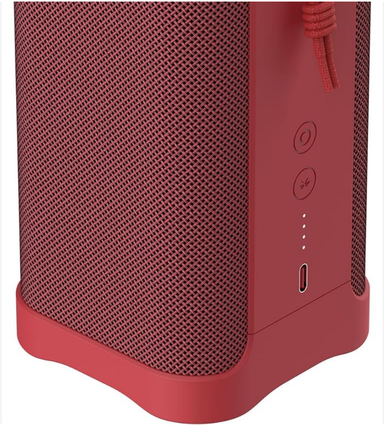
Figure 1: The Skullcandy Terrain XL Wireless Bluetooth Speaker, showcasing its compact and rugged design.