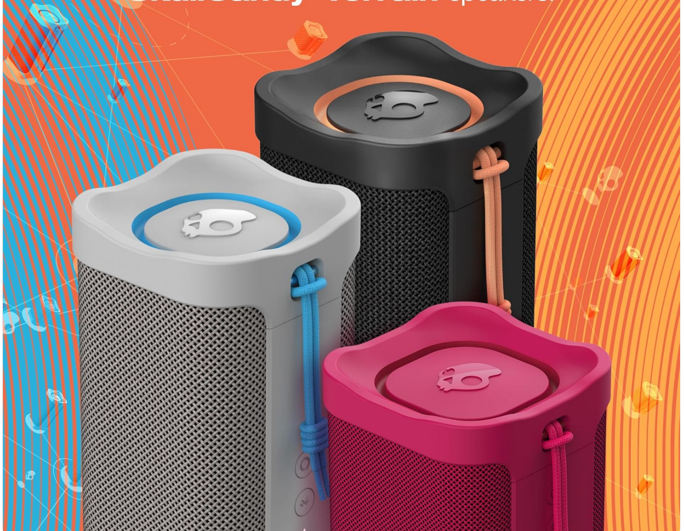
Figure 4: The Skullcandy Multi-Link feature allows multiple speakers to play together.

Synchronize your music with up to 99 other SkullCandy® Terrain speakers.