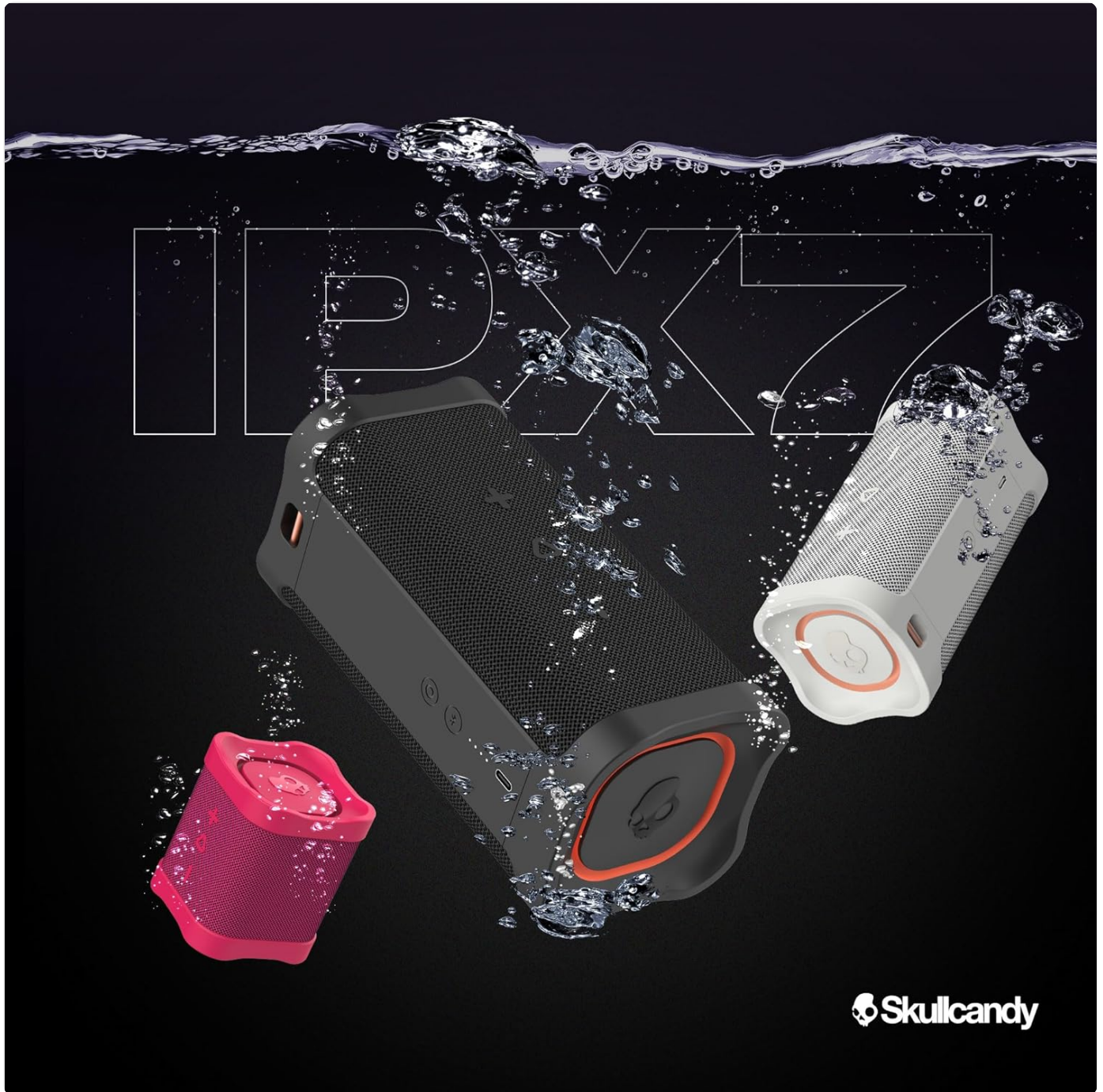
Figure 5: The Skullcandy Terrain XL is built to withstand water exposure.

The Terrain XL is designed to be highly water-resistant. It can be submerged in water up to 1 meter (3 feet) for up to 30 minutes. Ensure the charging port cover is securely closed before exposing the speaker to water.