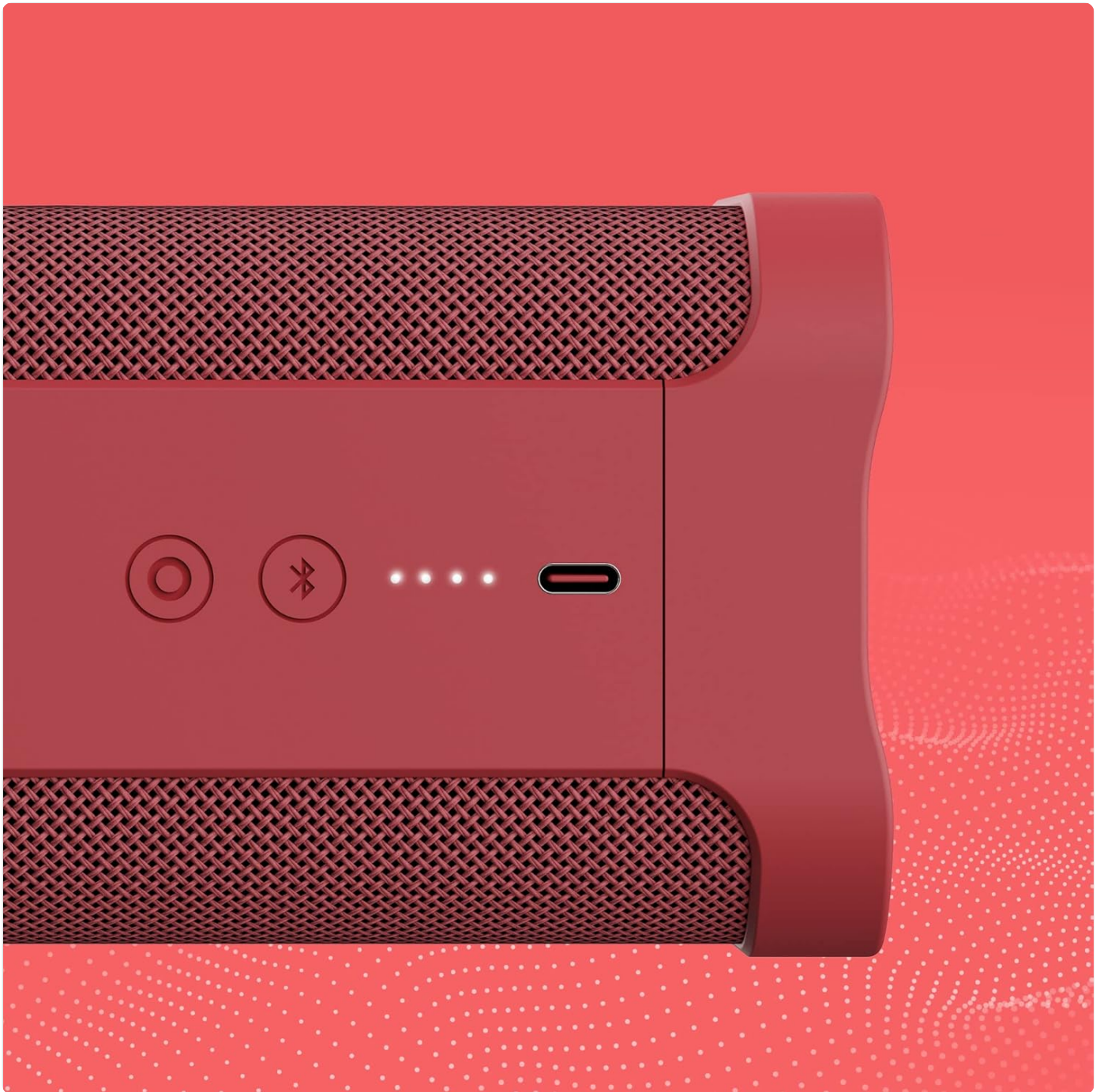
Figure 3: The charging port and battery indicator lights on the side of the speaker.