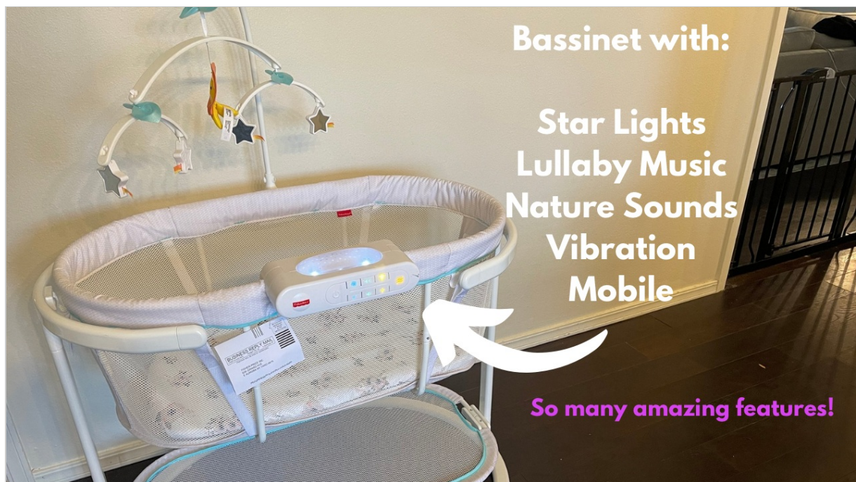
Image: The electronic control unit showing illuminated buttons for various soothing functions.