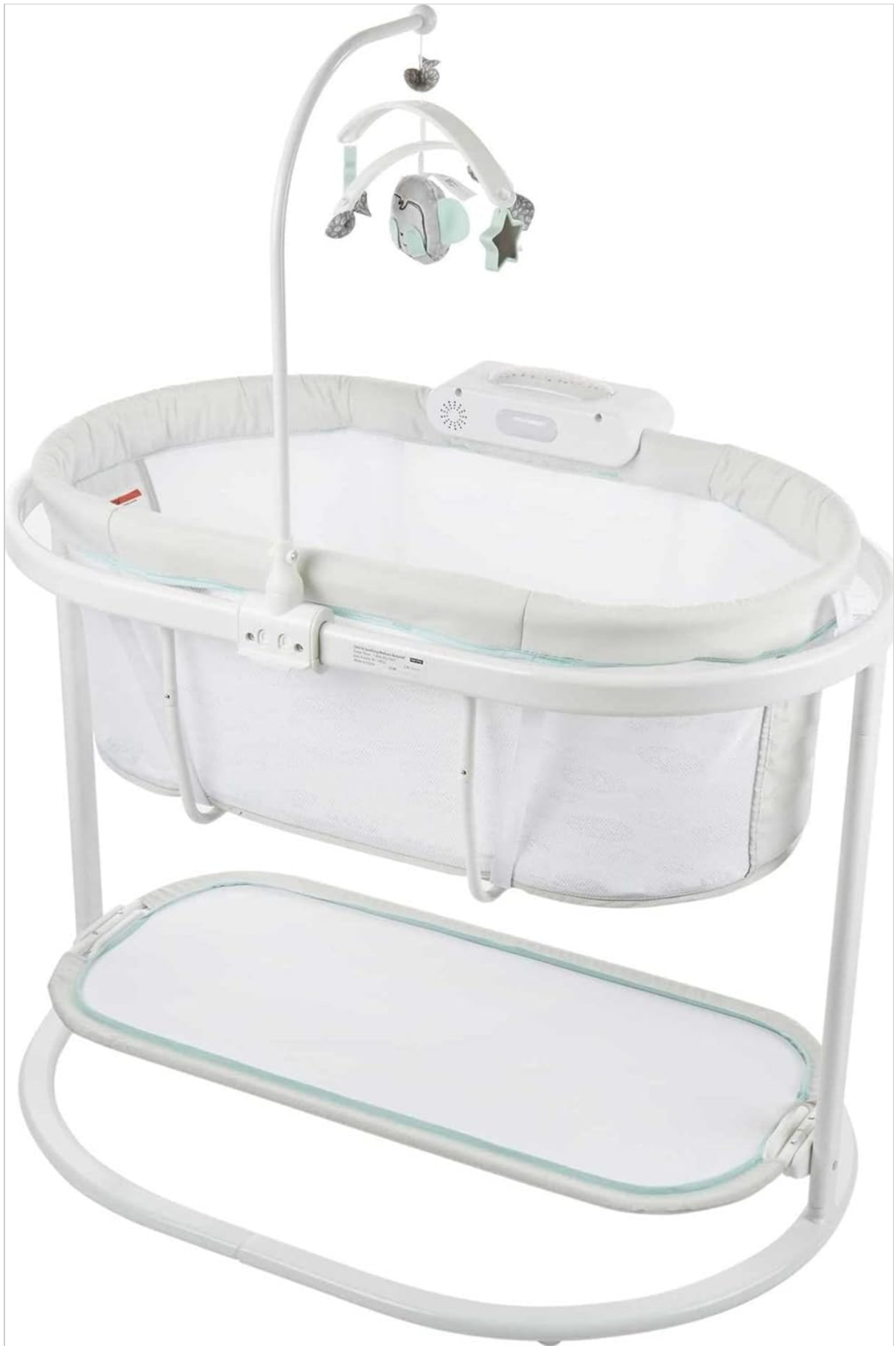
Image: The Fisher-Price Soothing Motions Bassinet, fully assembled with its mobile and control unit.