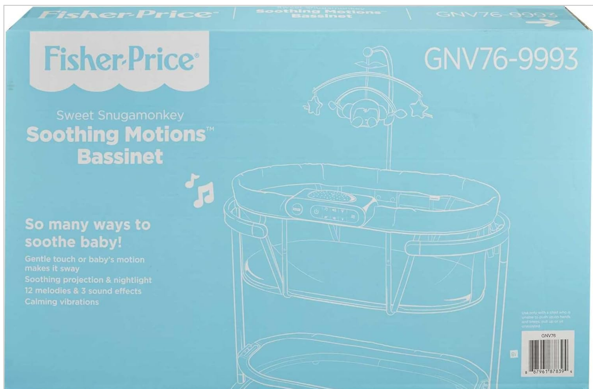
Image: The Fisher-Price Soothing Motions Bassinet, fully assembled, showcasing its structure and storage shelf.

The bassinet features a snap-in design for easy assembly and disassembly. Follow the manufacturer's instructions provided in the box for detailed steps. Ensure all connections click into place securely.