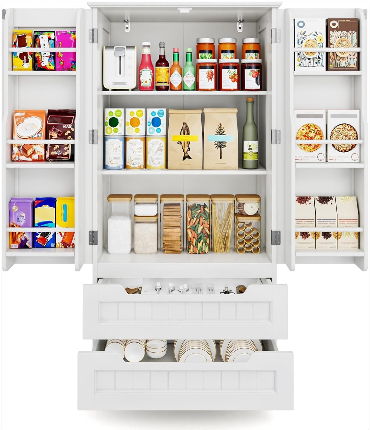
Image: The cabinet fully open, demonstrating its extensive storage capabilities for pantry items.