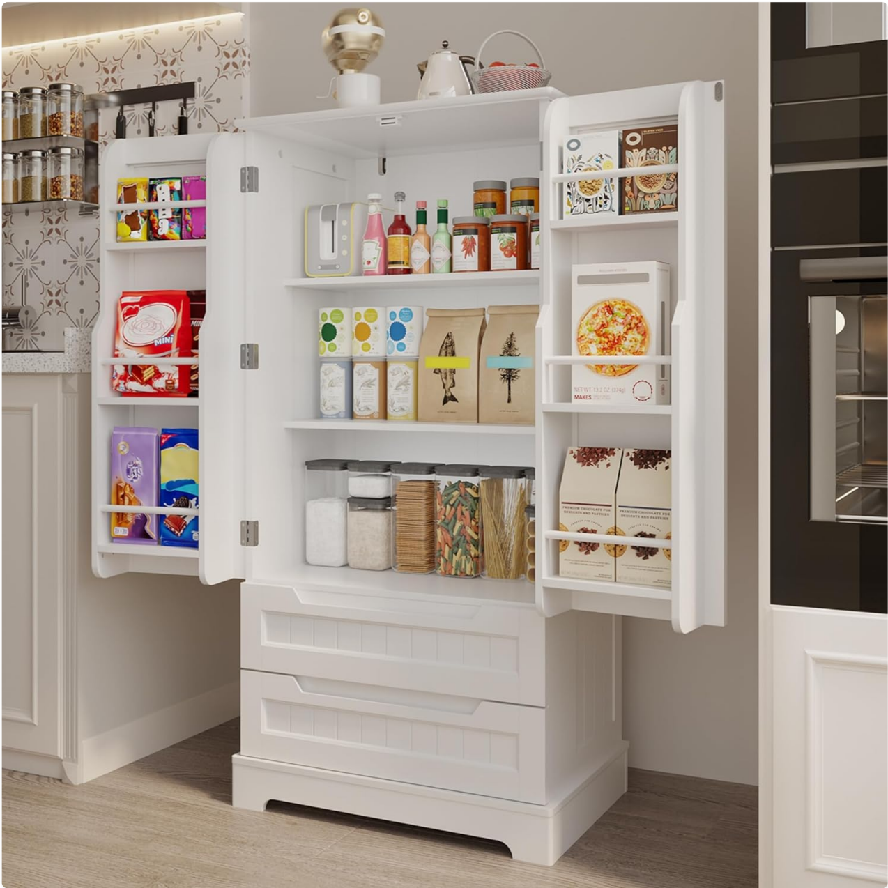
Image: Detailed dimensions and internal structure of the cabinet, crucial for assembly and placement.