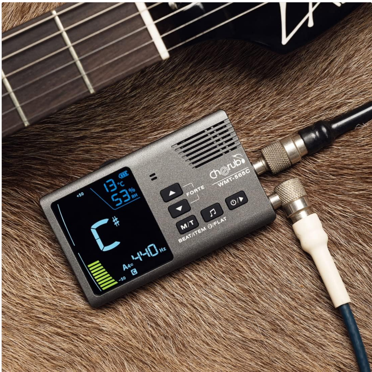
Figure 4: WMT-565C in Tuner Mode with Guitar Connection