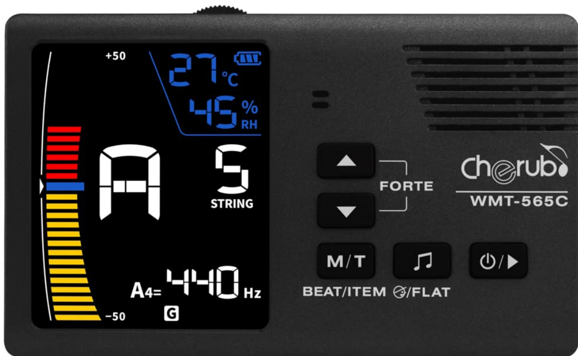
Figure 1: Cherub WMT-565C Multi-Function Device