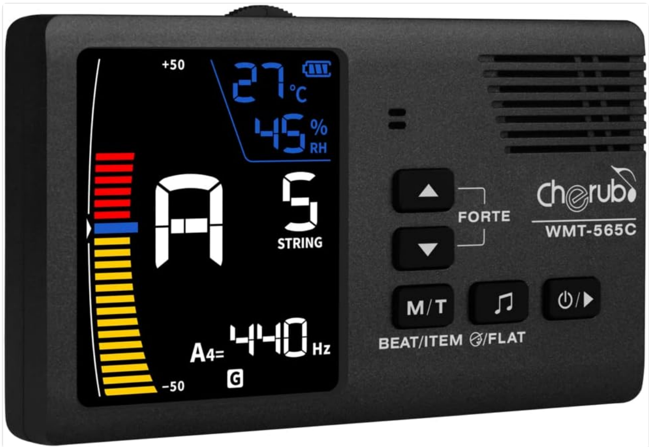
Figure 5: Tuner Mode with Environmental Data

This information is shown on the upper right corner of the LCD screen, allowing musicians to protect their instruments from adverse environmental conditions.