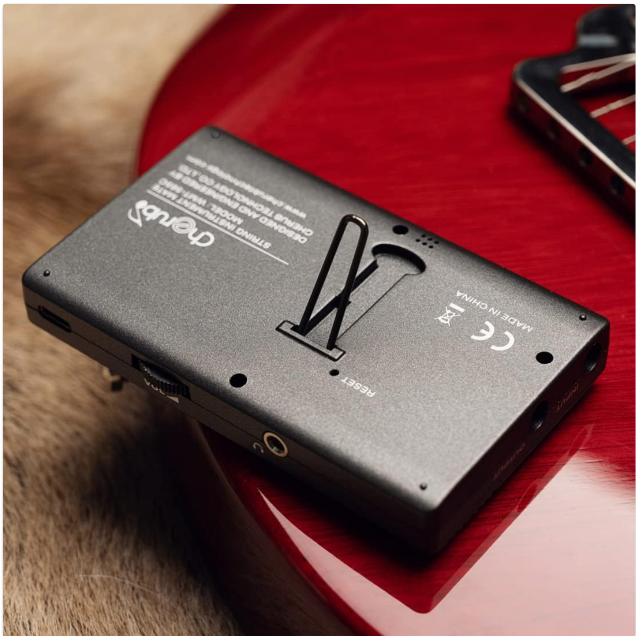
Figure 3: Device with Kickstand Extended