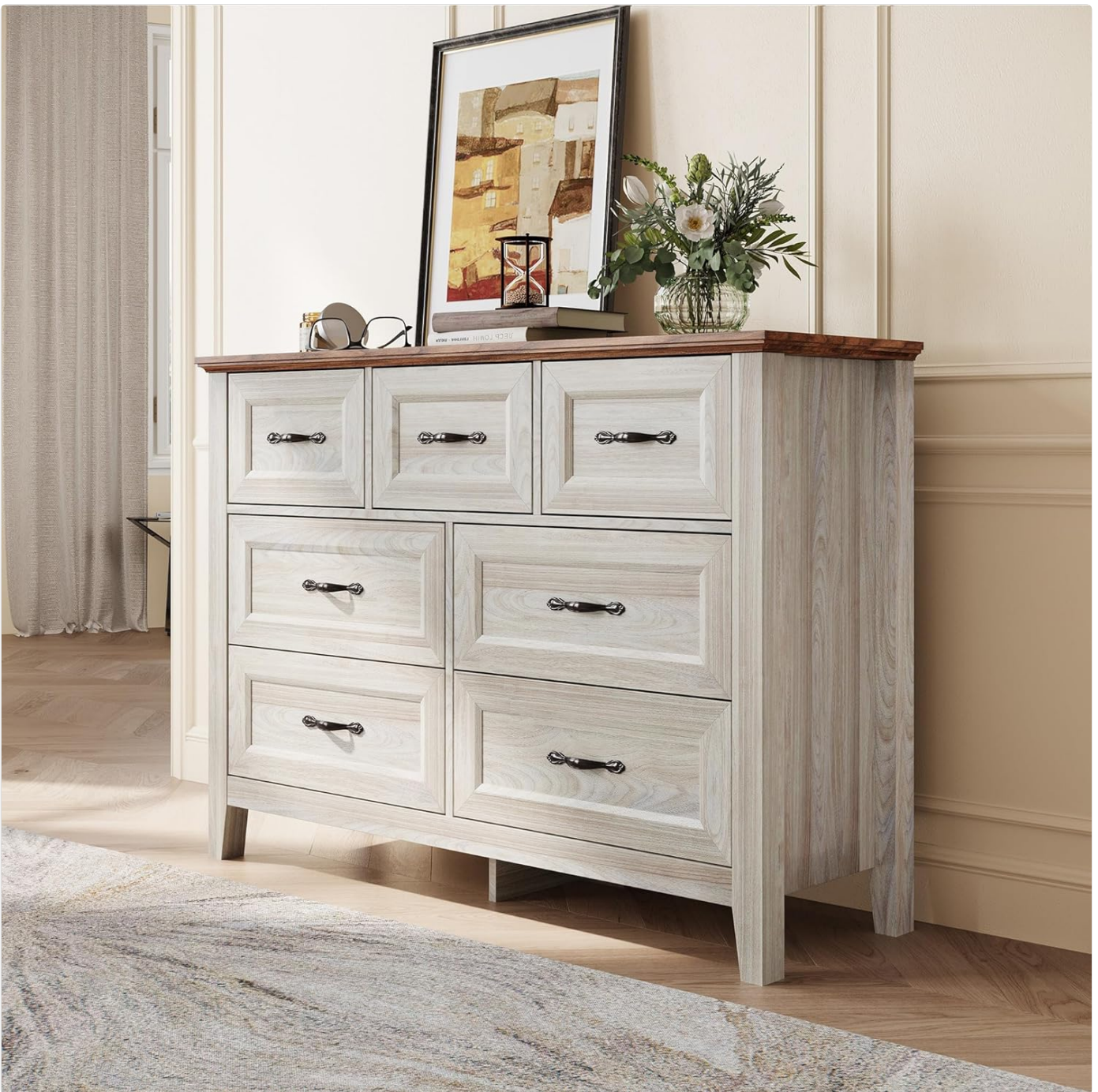
Image: The LINSY HOME 7-Drawer Dresser, a white beige dresser with a brown top and black metal handles, positioned in a well-lit room with a picture frame and vase on top.