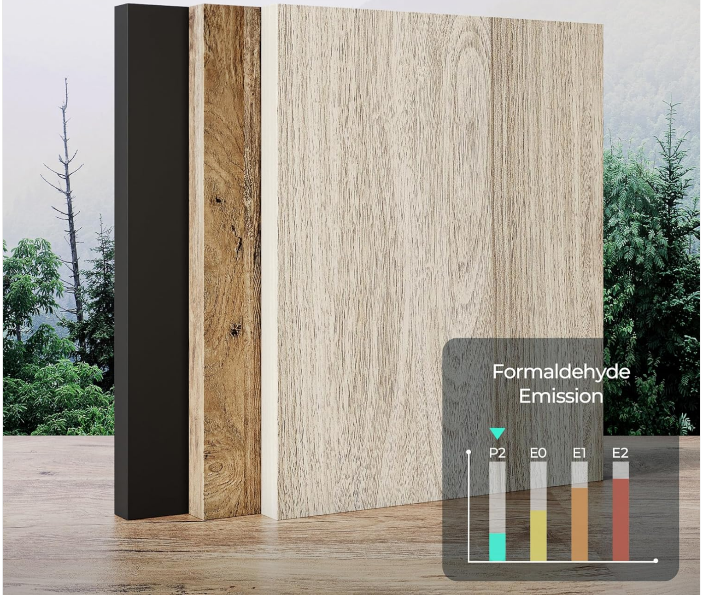
Image: A visual representation of P2 Grade Plate material, showing different layers of wood and a graph indicating low formaldehyde emission levels, highlighting its eco-friendly nature.