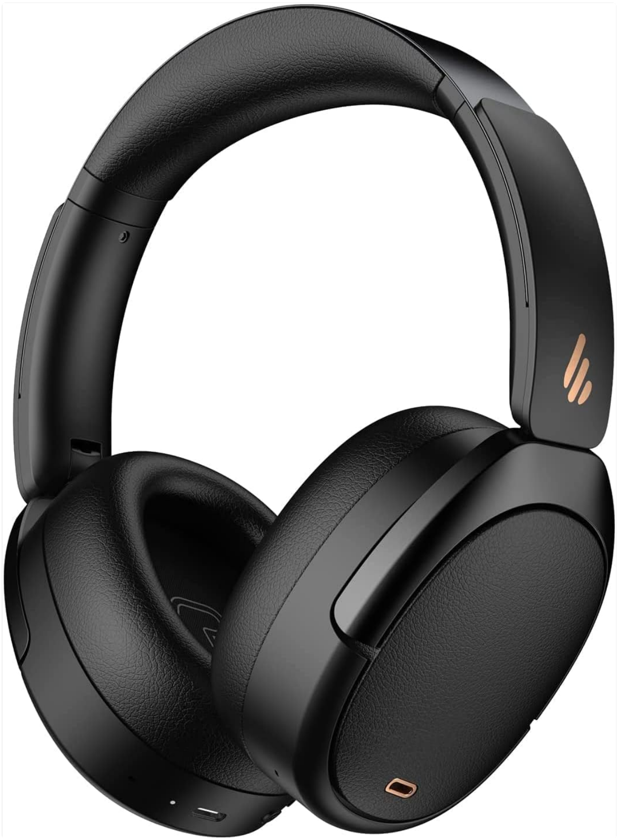
Figure 1: A pair of black Edifier WH950NB over-ear wireless headphones, showcasing their sleek design.