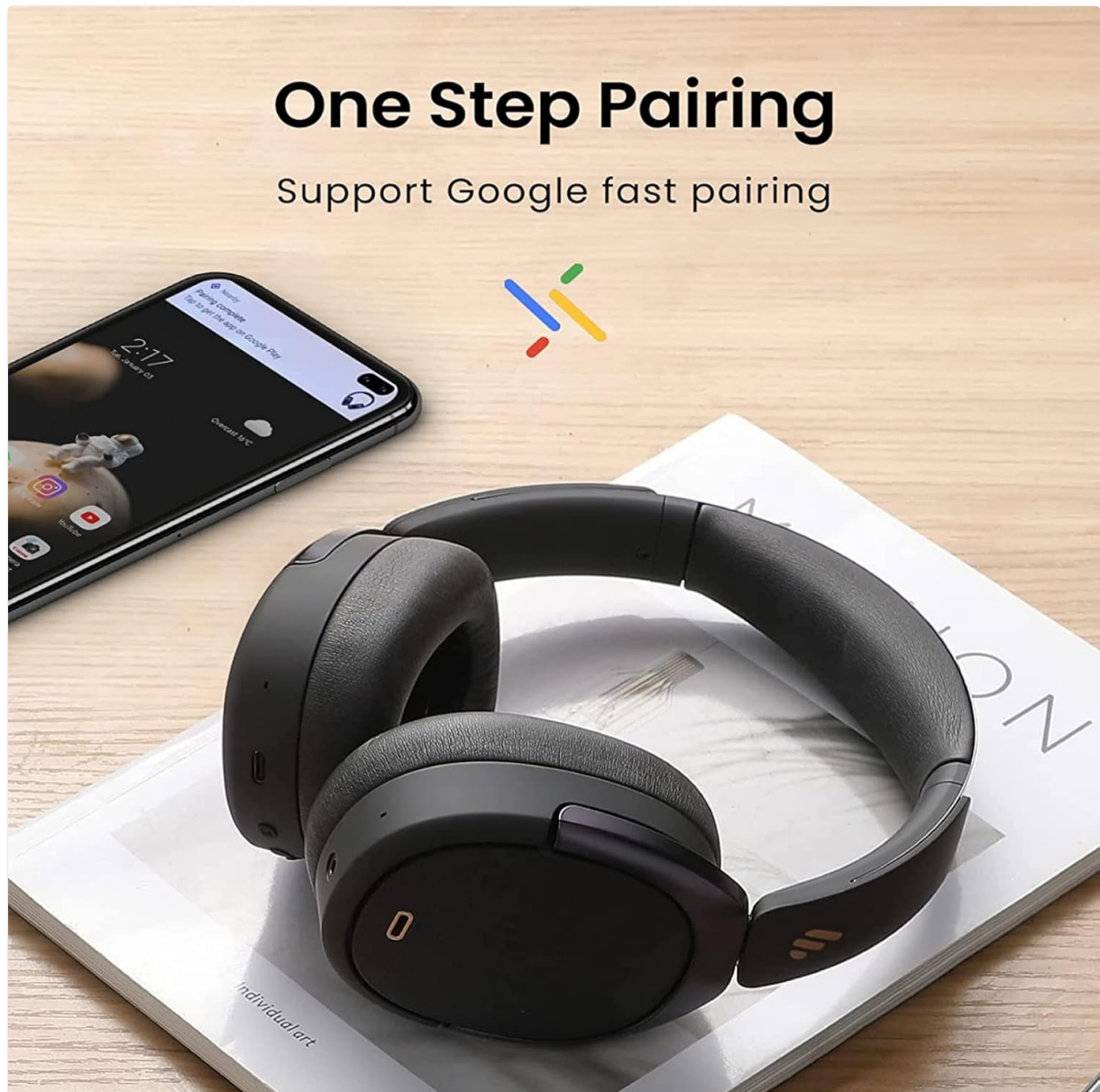
Figure 3: The headphones are shown alongside a smartphone, indicating the Google Fast Pairing feature for quick and effortless Bluetooth connection with Android devices.

For Android devices, the WH950NB supports Google Fast Pairing. Simply turn on the headphones near your Android device, and a pairing notification will appear on your screen for quick connection.