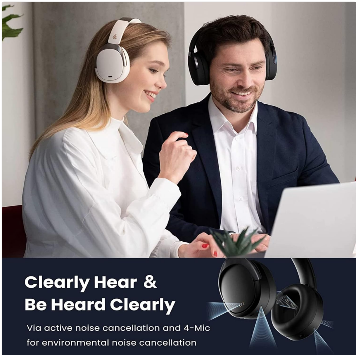
Figure 4: This image demonstrates the active noise cancellation feature and the 4-microphone system designed for clear voice calls, effectively reducing environmental noise for both listening and speaking.