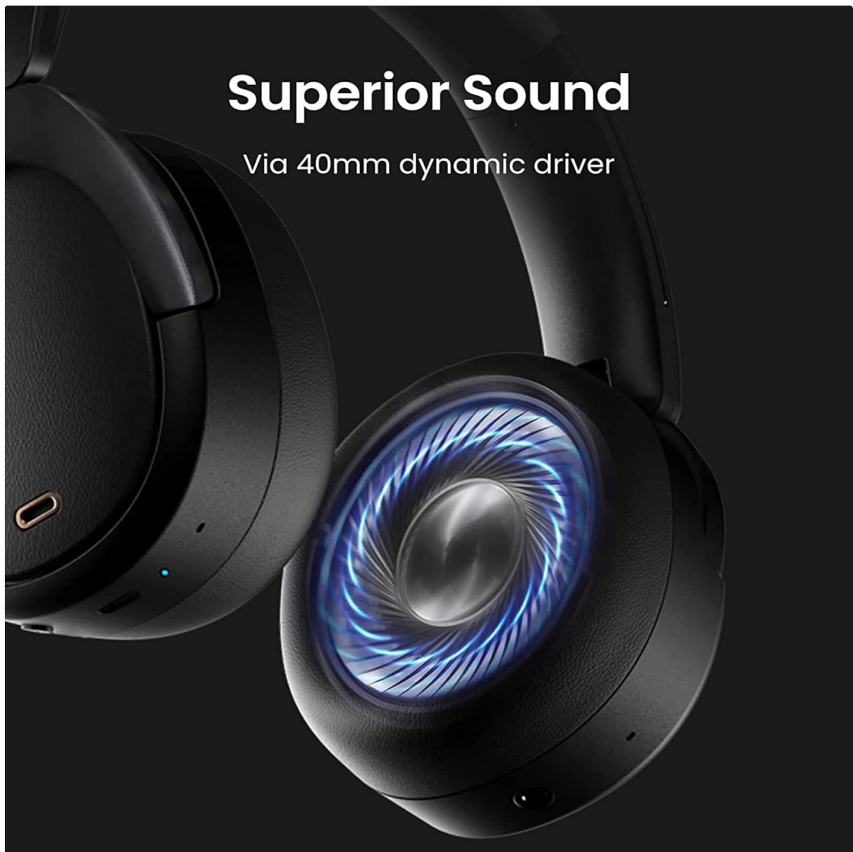
Figure 6: A close-up view of the headphone's ear cup, highlighting the 40mm composite titanium film dynamic driver responsible for delivering exceptional and balanced audio across all music genres.