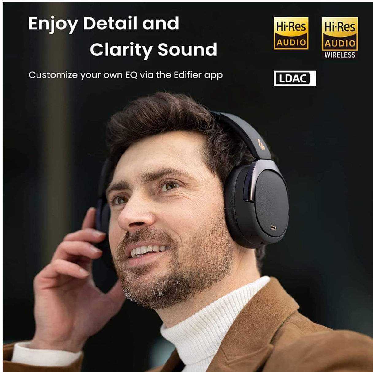
Figure 5: This image illustrates the headphones' support for Hi-Res Audio Wireless with LDAC certification, allowing for detailed and clear sound. Users can customize their audio experience via the Edifier app.