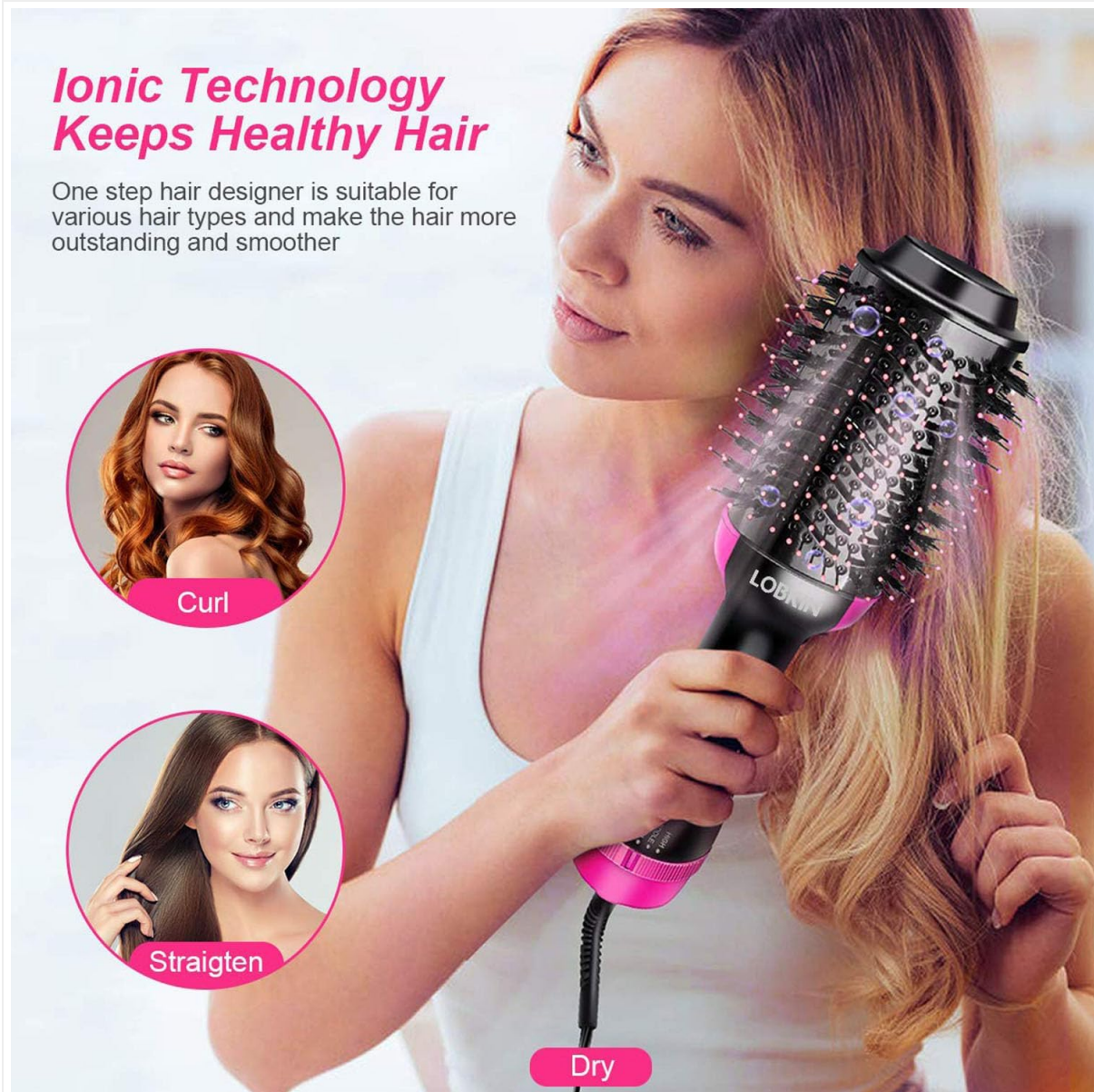
Figure 2.3: This image demonstrates the ionic technology of the LOBKIN Hair Dryer Brush, showing how it helps to curl, straighten, and dry hair while maintaining health.