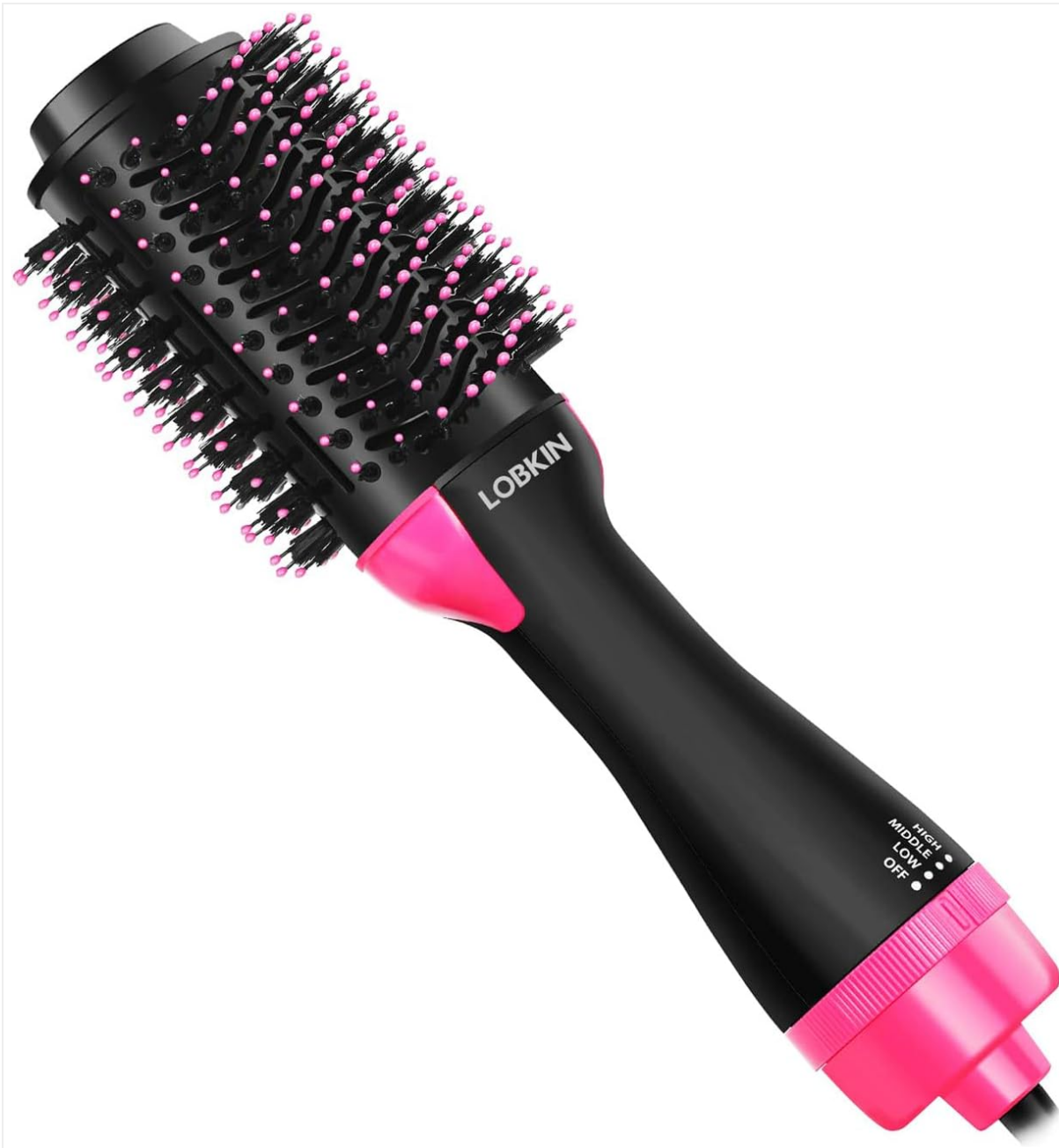
Figure 2.1: LOBKIN Ionic Technology Hair Dryer Brush. This image displays the main unit of the hair dryer brush, showcasing its black body with pink accents and the oval brush head with mixed bristles.