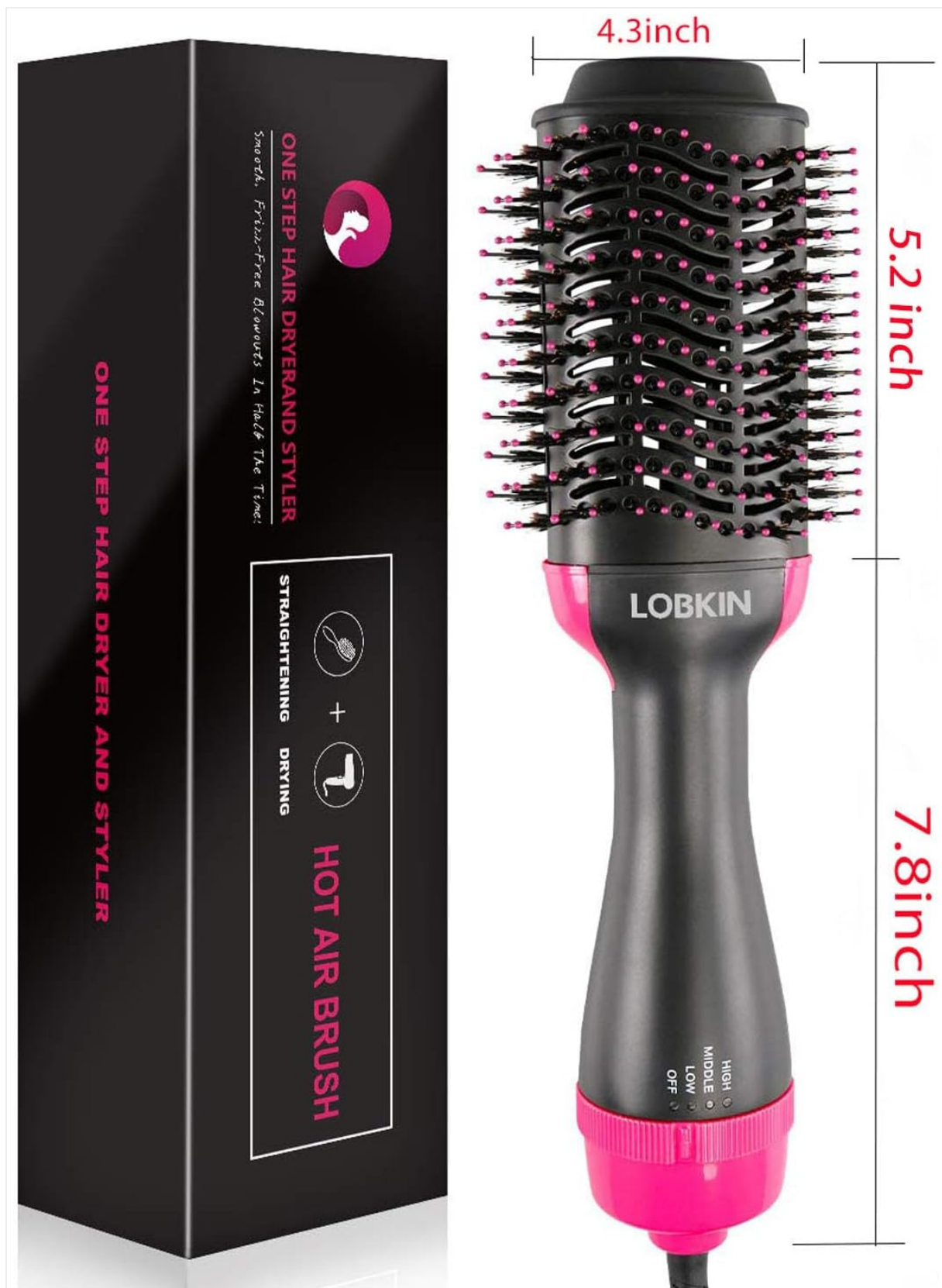
Figure 8.1: Diagram illustrating the dimensions of the LOBKIN Hair Dryer Brush, including its length and brush head measurements.