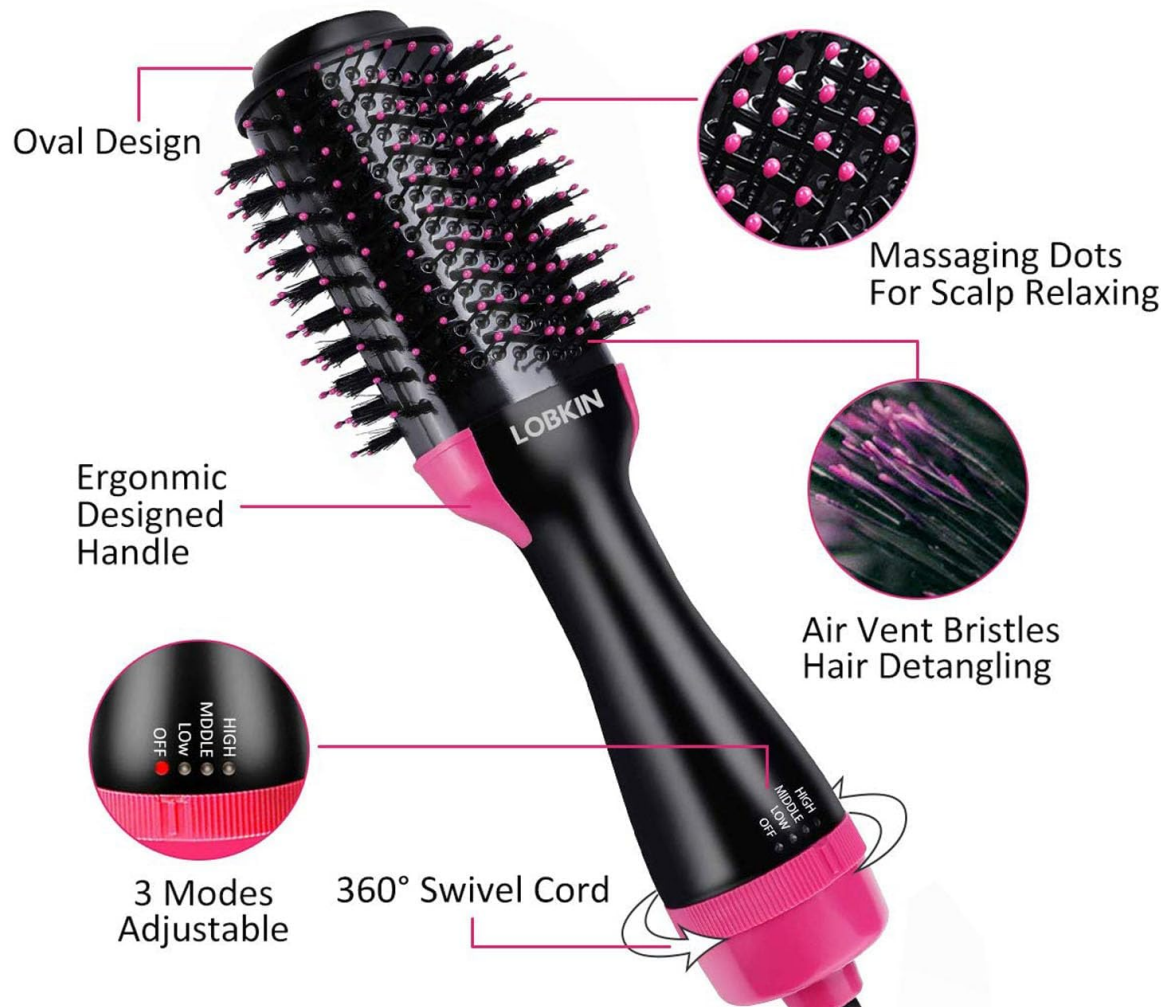
Figure 2.4: A detailed display of the LOBKIN Hair Dryer Brush, pointing out its oval design, massaging dots for scalp relaxing, ergonomic handle, air vent bristles for detangling, 3 adjustable modes, and 360° swivel cord.