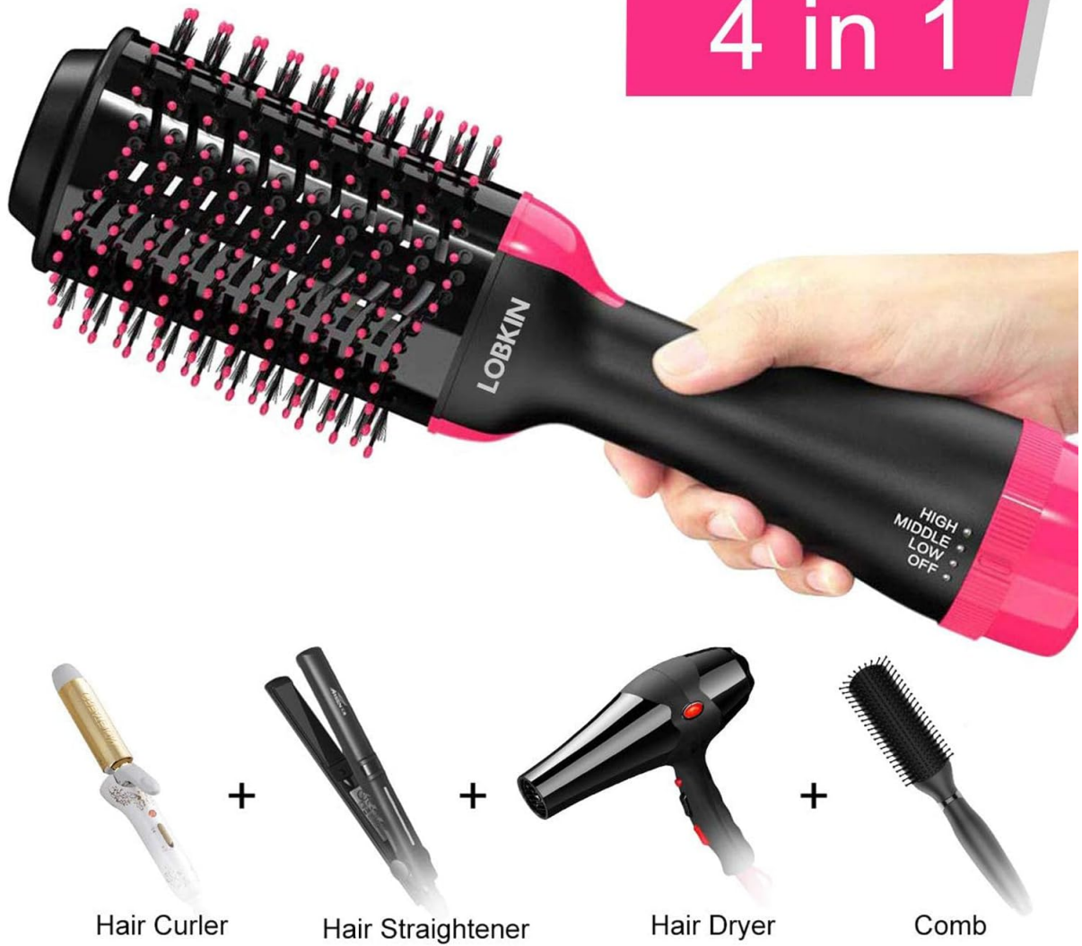
Figure 2.2: The LOBKIN Hair Dryer Brush highlighting its 4-in-1 functionality, illustrating how it replaces a hair curler, hair straightener, hair dryer, and comb.