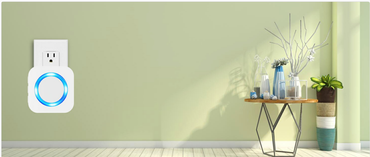
Image: The SURFOU wireless doorbell system, featuring a transmitter and receiver, shown in a modern home setting.

The SURFOU Wireless Doorbell System M9 is designed for convenience and reliability. This system includes one waterproof push button (transmitter) and three plug-in receivers. It offers a long operating range, a variety of ringtones, adjustable volume, and visual alerts, making it suitable for various home and office environments.