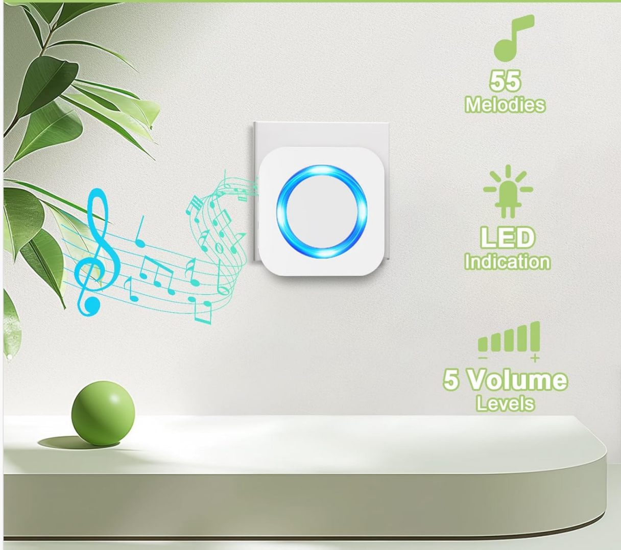
Image: A doorbell receiver with a flashing LED light, indicating its visual alert function.