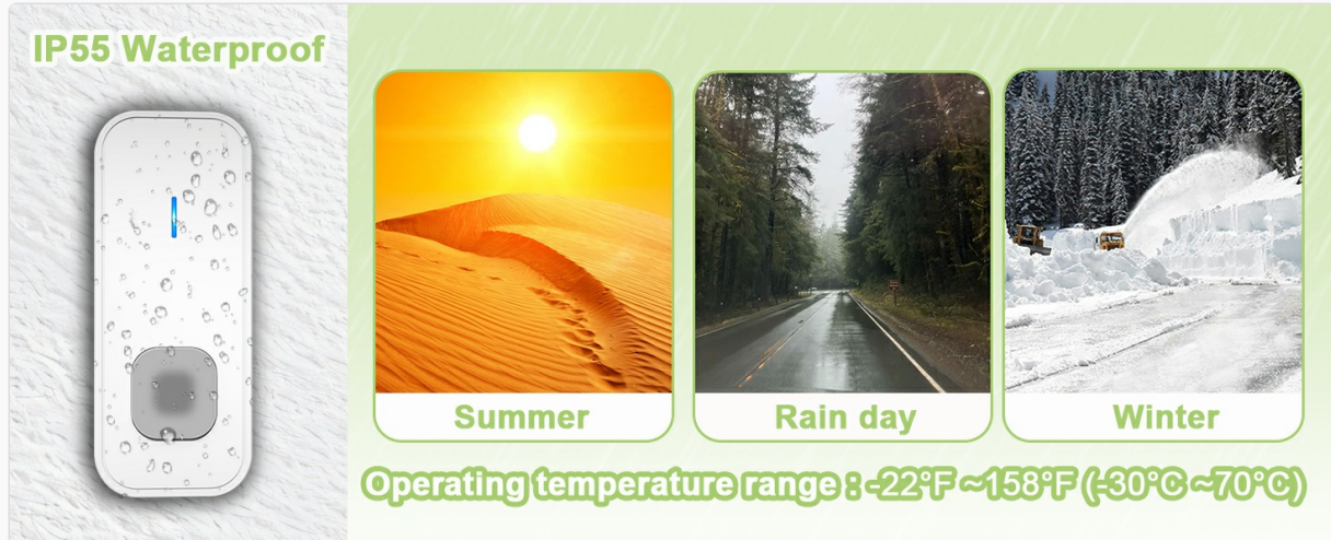
Image: The SURFOU wireless doorbell push button mounted on a wall.